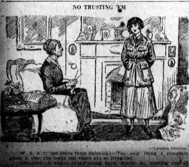
NO TRUSTING 'EM