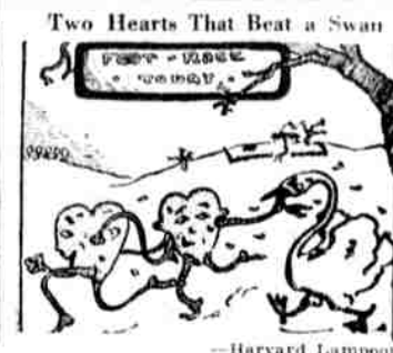
Two Hearts That Beat a Swan