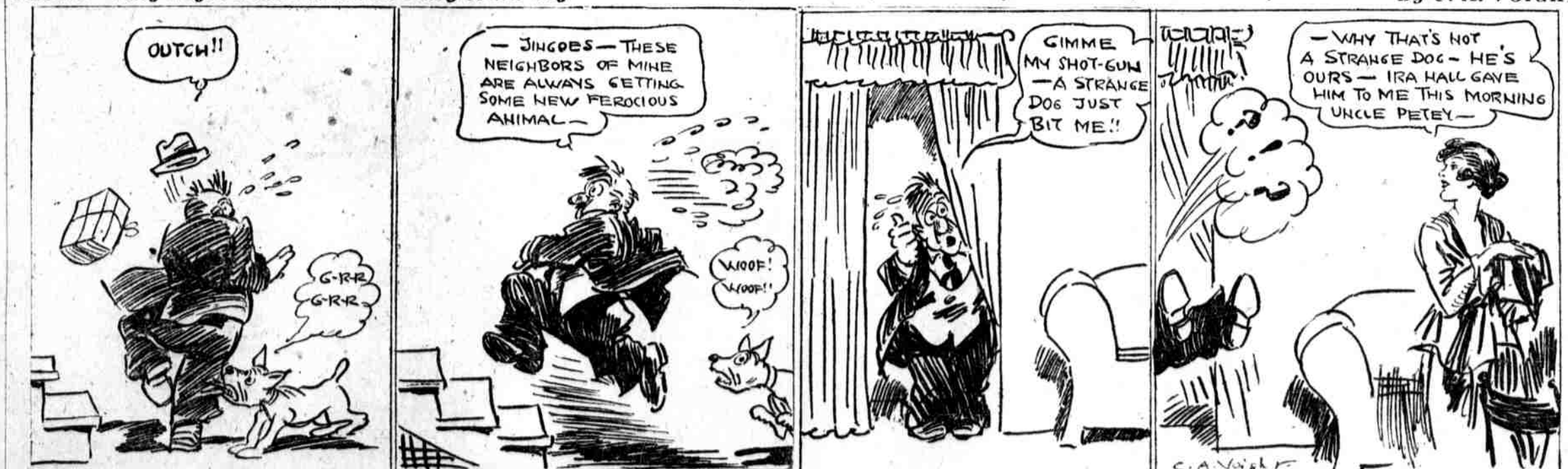
By C. A. VOIGHT