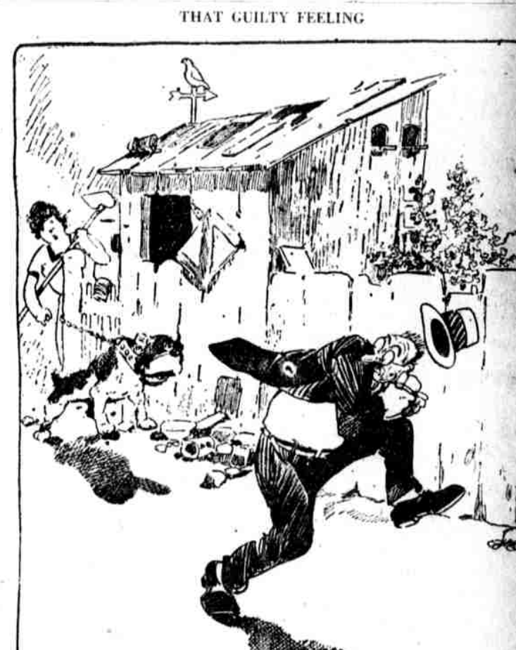
THAT GUILTY FEELING