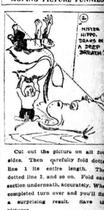
Cut out the picture on all four sides. Then carefully fold dotted line 1 its entire length. Then dotted line 2, and so on. Fold each section underneath, accurately. When completed turn over and you'll find a surprising result. Save the pictures.