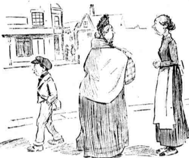
—London Opinion. "Did you put your clock back on Sunday night?" "No—we were so hard up we had to put ours back months ago."

LAST WEEK WHEN THE CITY PAPERS WITH ALL THE WAR NEWS WERE TOSSED OFF THE THROUGH TRAIN THEY ROLLED INTO THE STATION POND