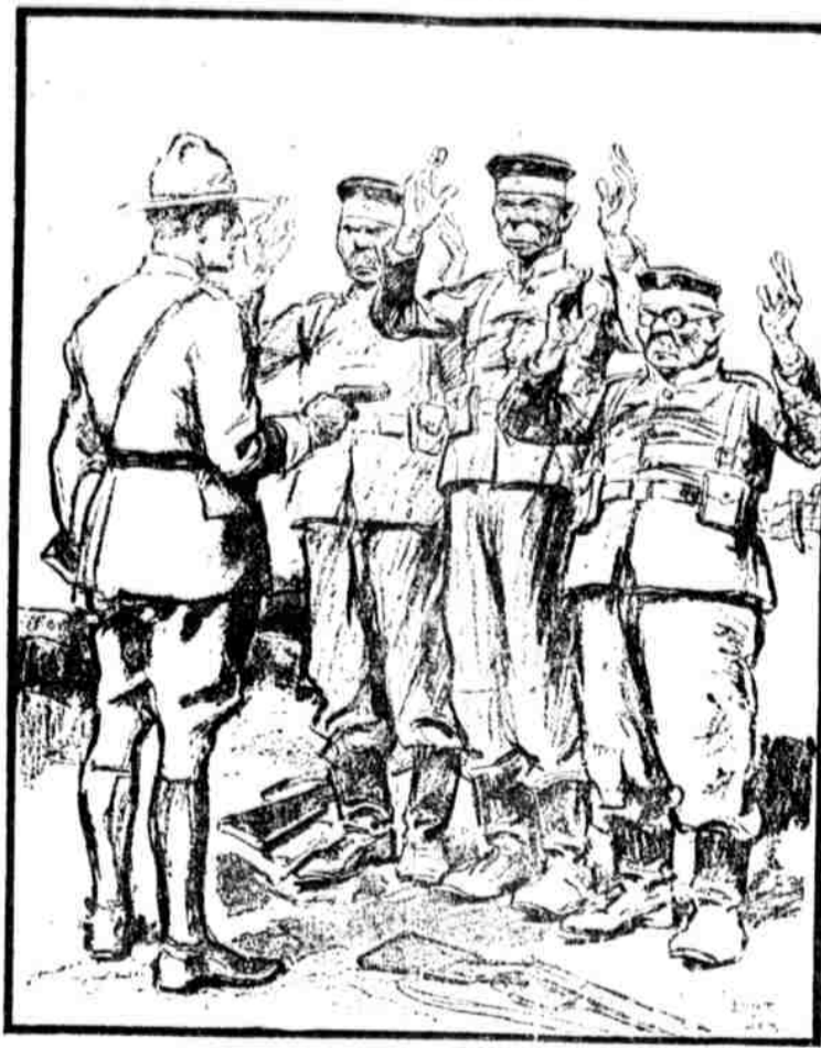
Fritz—Don't kill us—we've only der German peoples. It vos der Kaiser you want to kill, Captain Surething of 'S Army!—Then why the Potsdam have you fellows kept getting between me and the Kaiser for the past eighteen months?