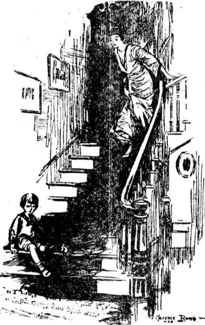
"Why don't you play with your train, Hubbs?" —London Opinion. "I can't. Don't you know there's a railway strike on?"