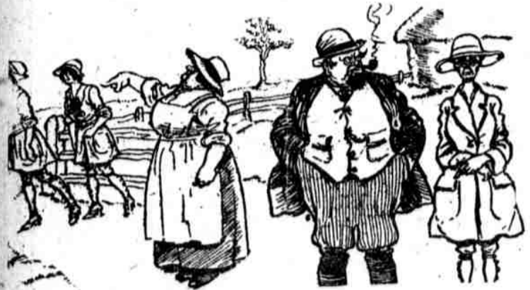
The land girl the farmer's wife selected.