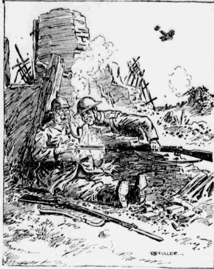
Sammy—Thanks for the light, old man. —Captions Magazine