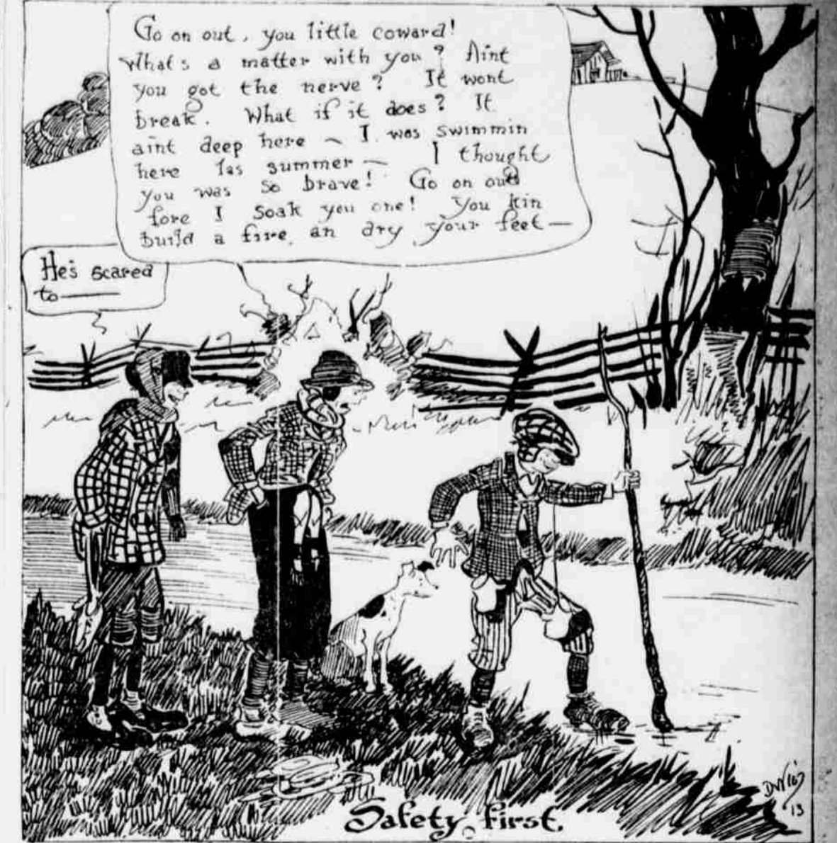
He's scared to