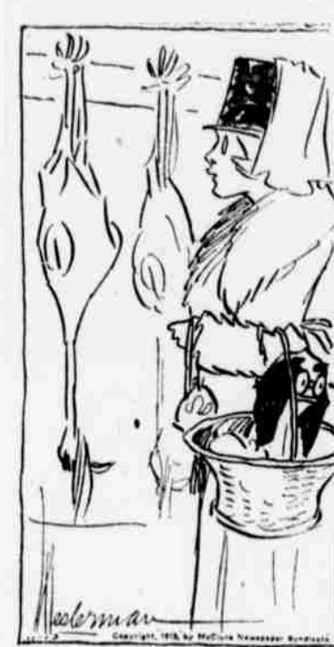
The young lady across the way says Germany does not understand the American temperament if she thinks we will ever be satisfied before we have won a complete victory and thrown up the sponge in triumph in Berlin.