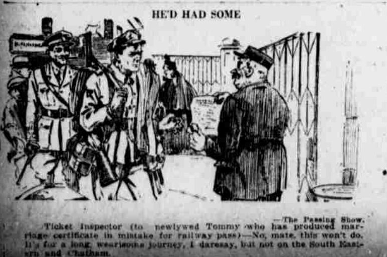
Ticket Inspector (to newlywed Tommy who has produced marriage certificate in mistake for railway pass)—No, mate, this won't do. It's for a long, wearisome journey, I daresay, but not on the South Eastern and Chatham.