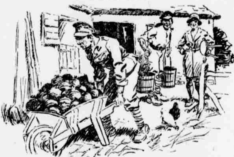
The Maid discussing the new farm help—Has he ever smell you? The Soldier—Im? No! It's a blinkin' woman later.