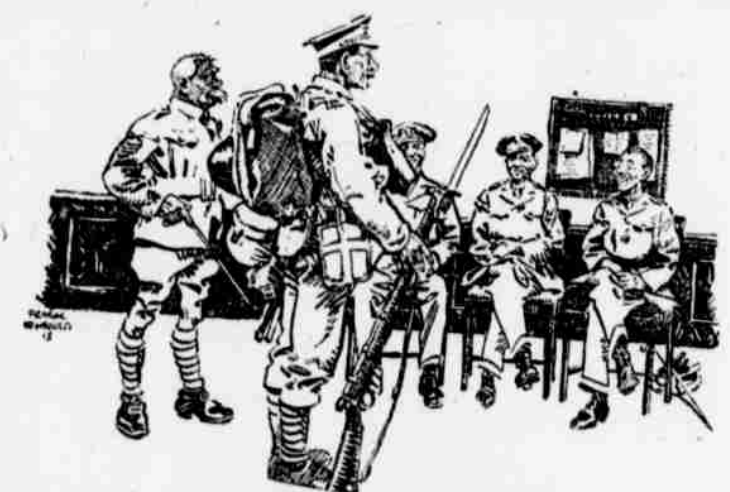
Sergeant Major (after lecturing on the carrying of the full kit—There 's is, see. All the kit aboard—nothing missin', and full to capacity. Now, does any one want to ask any questions? The Donkey—Yes, Sergeant Major. Where—er—does the hoggar carry his—er—bally spare wheel? —London Opinion.