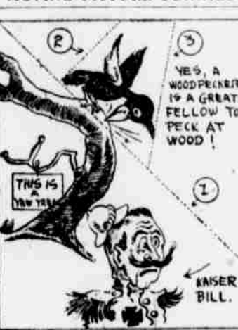
Cut out the picture on all four sides. Then carefully fold dotted line 1 its entire length. Then dotted line 2, and so on. Fold each section underneath, accurately. When completed turn over and you'll find a surprising result. Save the pictures.