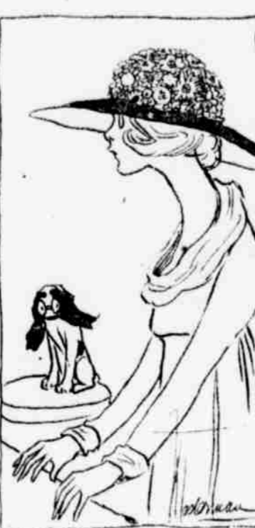
We asked the young lady across the way if she noticed any indications of a growing socialist trend in this country and she said she did think people were entertaining a little more, and for her part she believed it was a good thing to get our minds off the war.