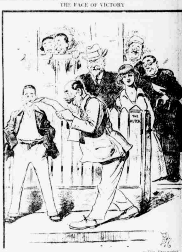
The arrival of newspapers is uncertain in the line of War. We have become so skilled, however, in deciphering the nicely graduated line in Mr. Doodle's face that we can tell, almost to a yard, how many miles of the Hindenburg line has been smashed.