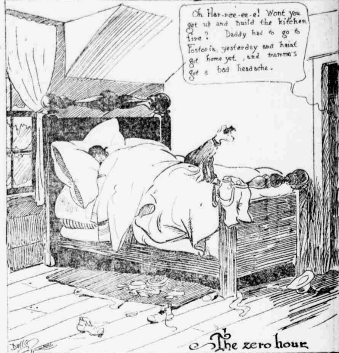
The zero hour

"CAP" STURBS—Pa Talks Too Much By EDWINA