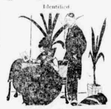
—Yes, that is a photo of my wife and two babies. —I suppose you are then on with the hat on?