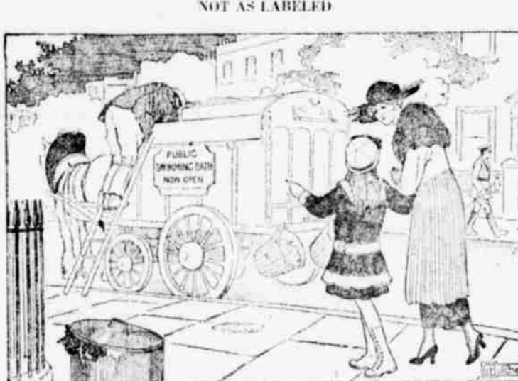
—You, mother dear, will shoot and one word to get swimming in here!