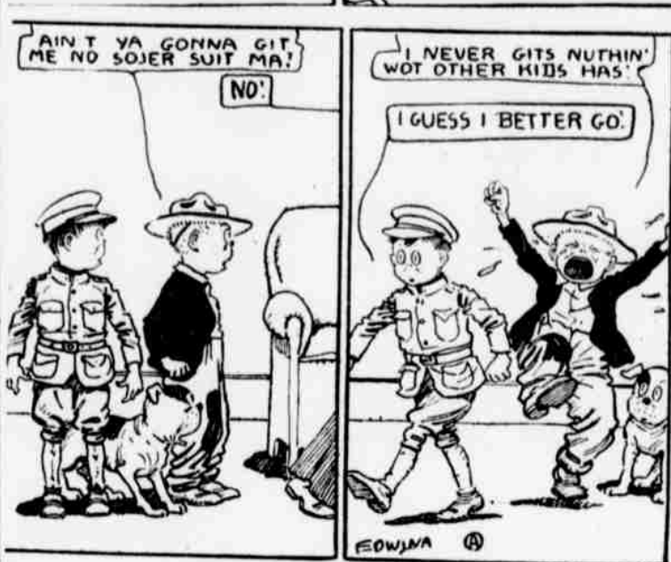
A HELPING HAND