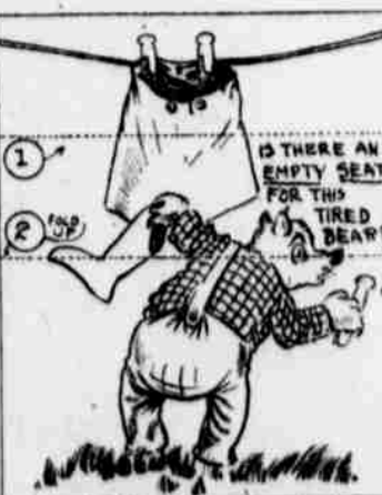
Cut out the picture on all four sides. Then carefully fold dotted line 1 its entire length. Then dotted line 2, and so on. Fold each section underneath, accurately. When completed turn over and you'll find a surprising result. Save the