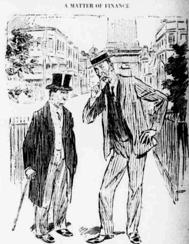
A MATTER OF FINANCE