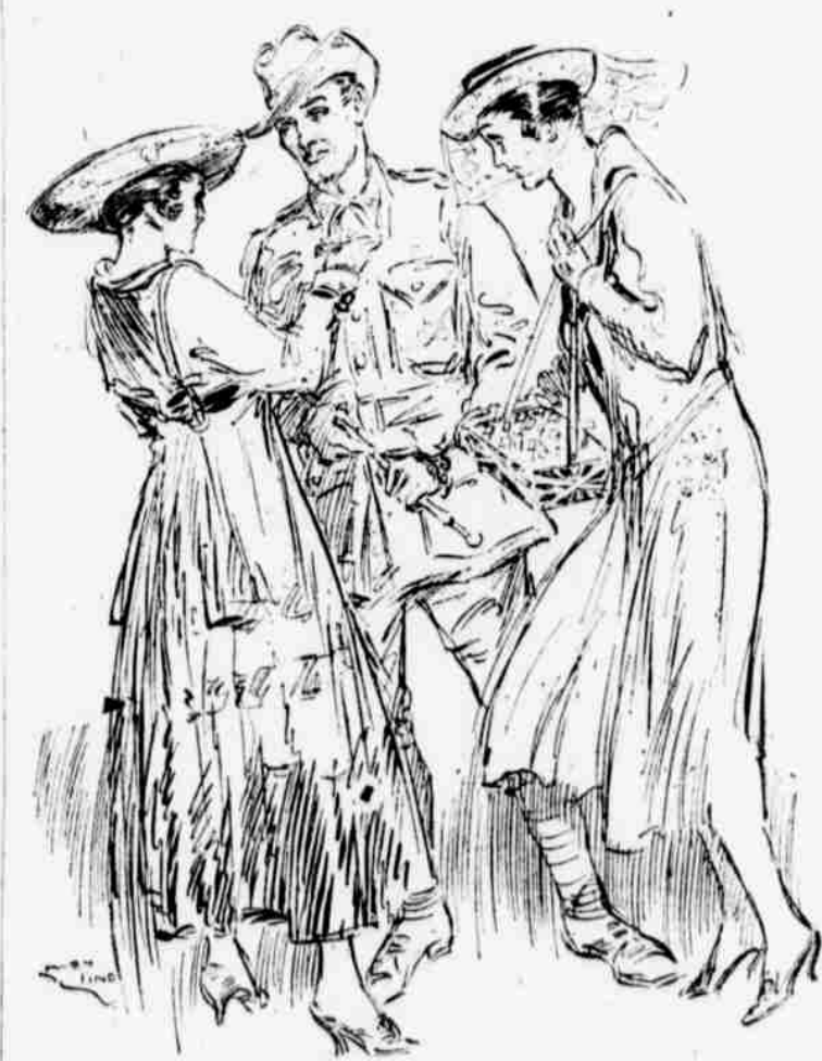
—Sidney Bulletin. May—And they say you took twelve Hun prisoners in a batch. Billim—Yes. May—Without any assistance? Billim—Well, yes, excepting wh at the prisoners gave.