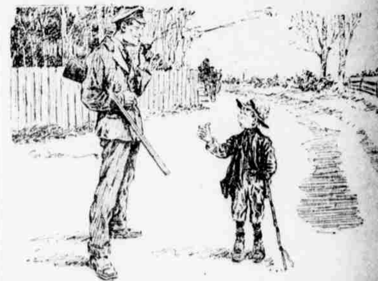
—The Passing Show. Tommy (on track of sport)—Anything one can find to take a pot at, sonny? Boy (with painful recollection of a recent hiding for trespass)—Yus, There's old Farmer Jones drivin' to market.