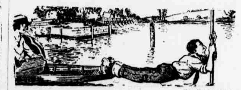
—The Passing Show. "Do be careful, sergeant. You've wetted your necktie."