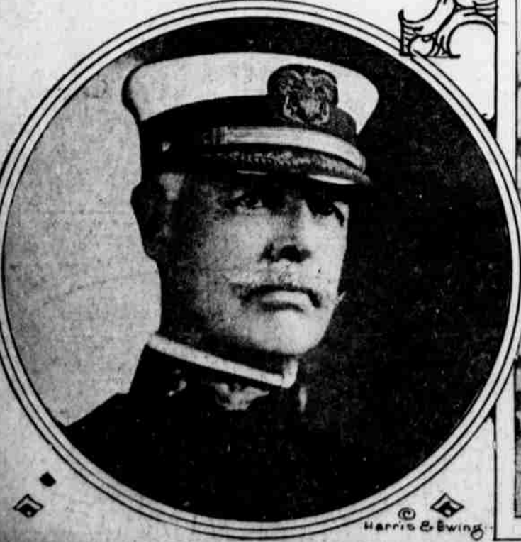
REAR ADMIRAL CHARLES P. PLUNKETT, in charge of the navy guns which are working havoc with the German land forces. While these guns are doing army work, they are operated by officers and men of the navy.