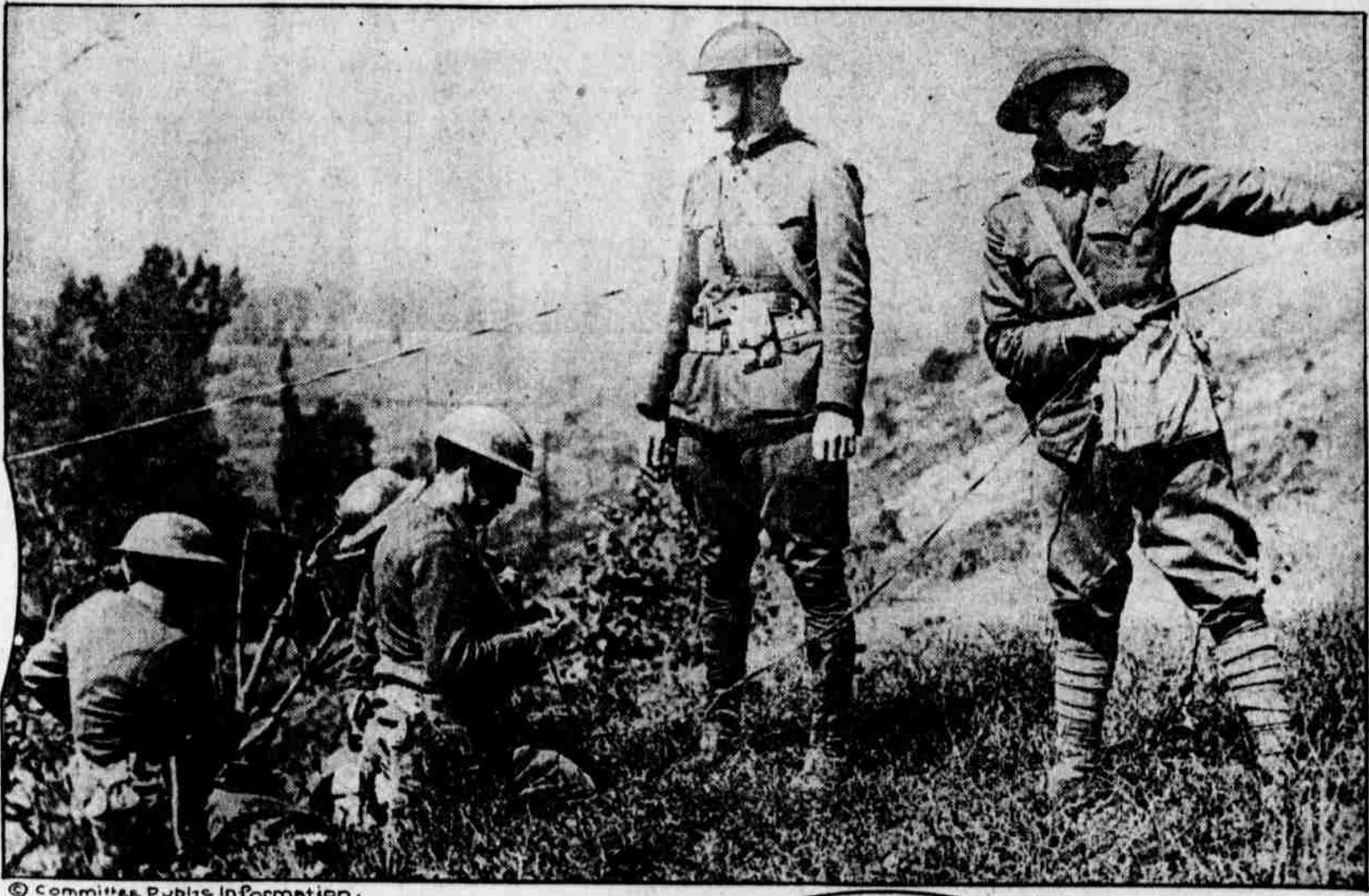
AMERICAN FIELD SIGNAL MEN near Juvigny repairing communication wires that had been severed by shell fire