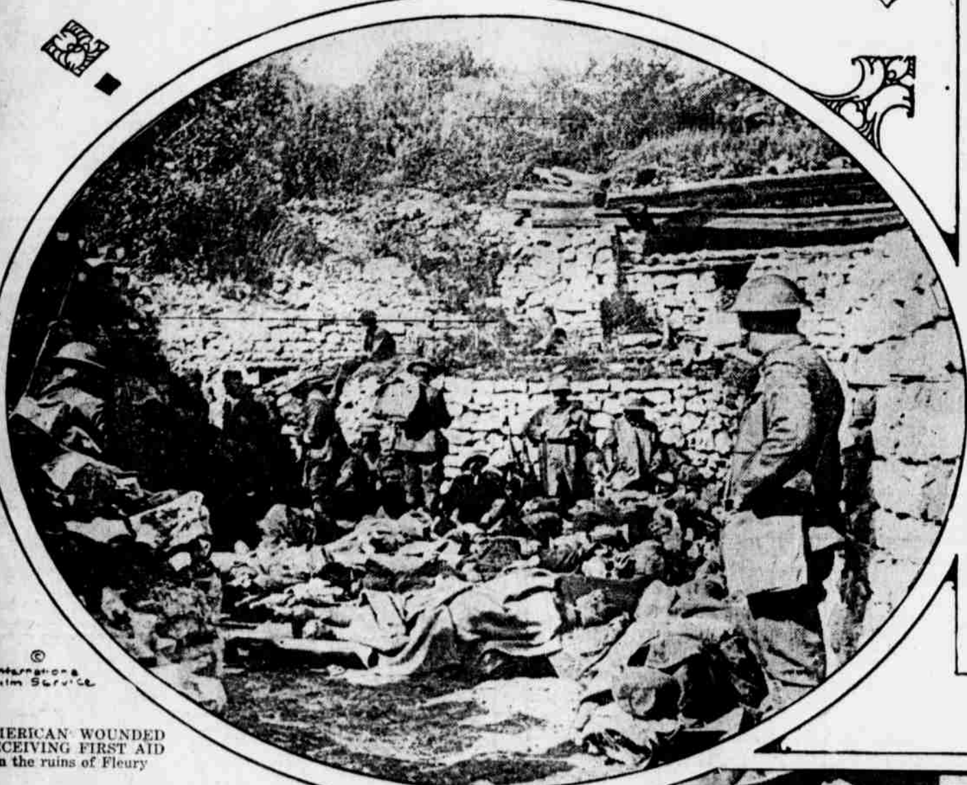
AMERICAN WOUNDED RECEIVING FIRST AID in the ruins of Fleury