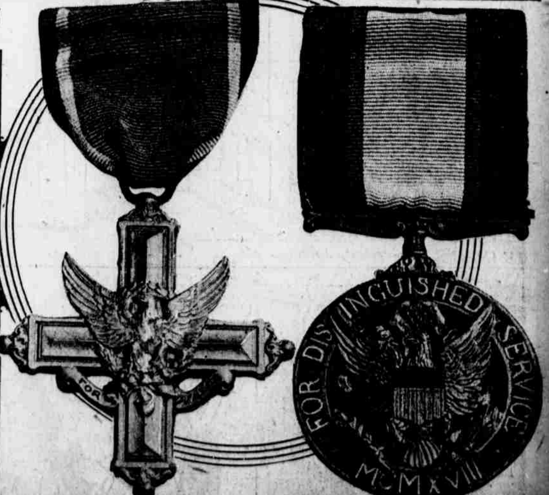
THE AMERICAN WAR CROSS to be awarded to our fighters for deeds of bravery.