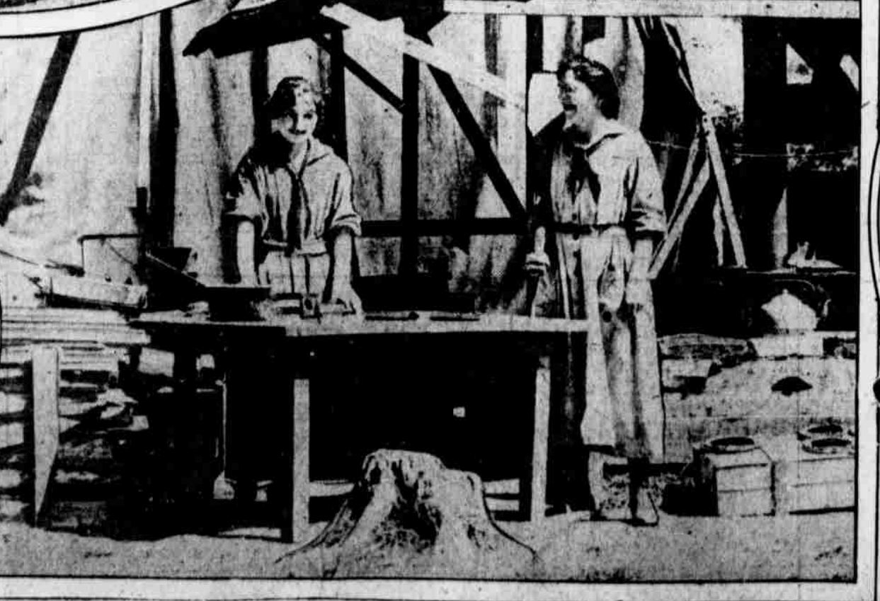
PIE FOLLOWS THE FLAG. One of the outdoor pie bakeries that the Salvation Army establishes wherever the American soldier goes on the western front.