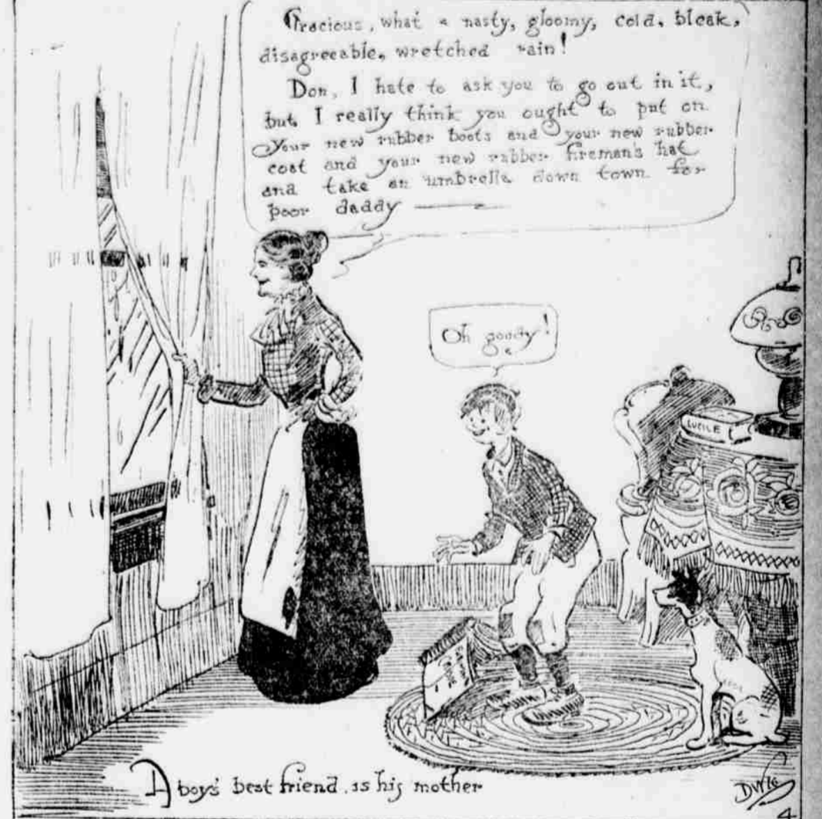
A boy's best friend is his mother

"CAP" STUBBS—Extreme Caution Will Be Necessary