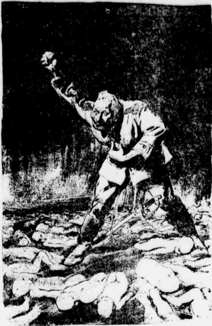
The German infant death rate has gone up to 50 per cent. The All-Highest-Himmler! How odd, when they might have stood for it!