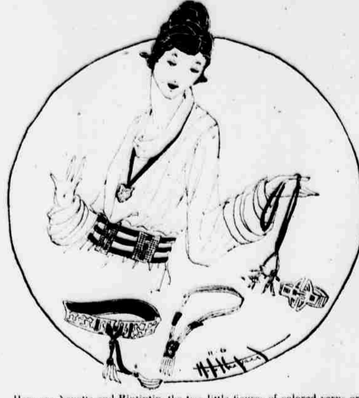
Here are Nette and Rintintin, the two little figures of colored yarns or silks that all France has named as charms...