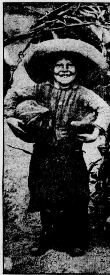
A PAIR OF PUMPKINS AND A GRIN...