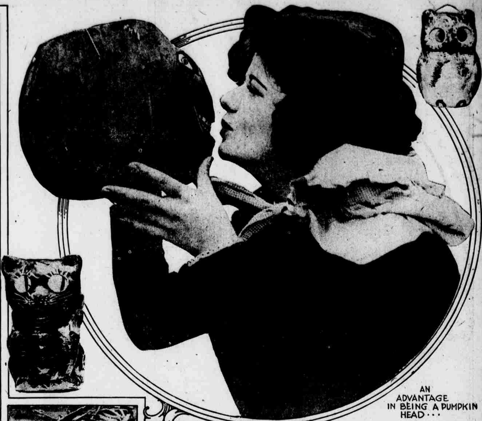
AN ADVANTAGE IN BEING A PUMPKIN HEAD...