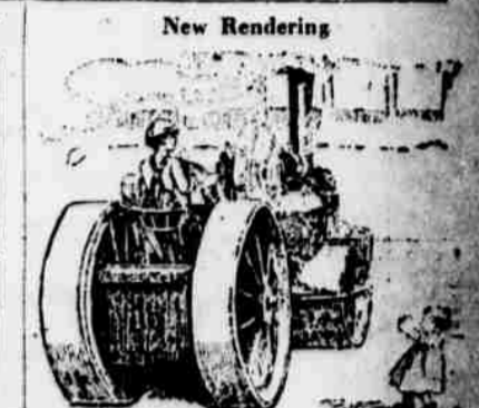
London Opines "Mother, dear mother, come home with me now!"