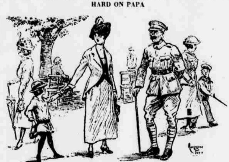
Little Girl (as her mother speaks to passing sergeant of V. T. C.) - I wouldn't speak to him, mummy. He's the man who always shouts so much at poor daddy when he's on parade.