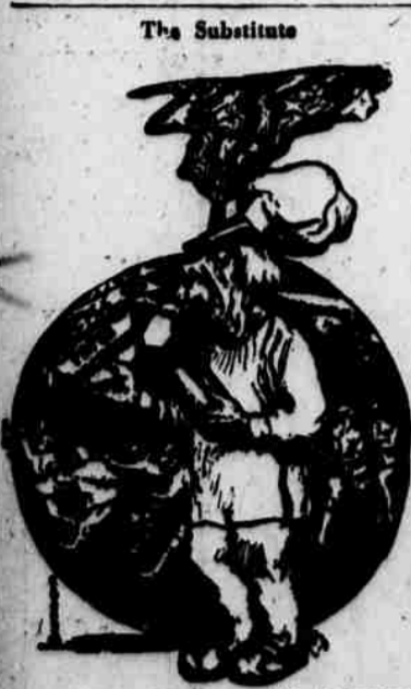
Fritz - No these is de stuff dat I must schmoke!

THE GUMPS - Min's Mother Will Be Here Soon