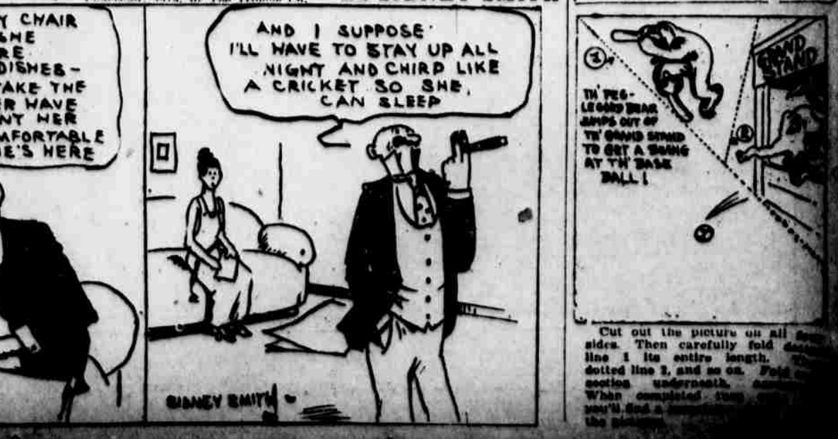
Cut out the picture on all sides. Then carefully fold down line 1 the entire length. Folded line 2, and so on. Fold in coating underneath. When completed, the picture will be ready to use.