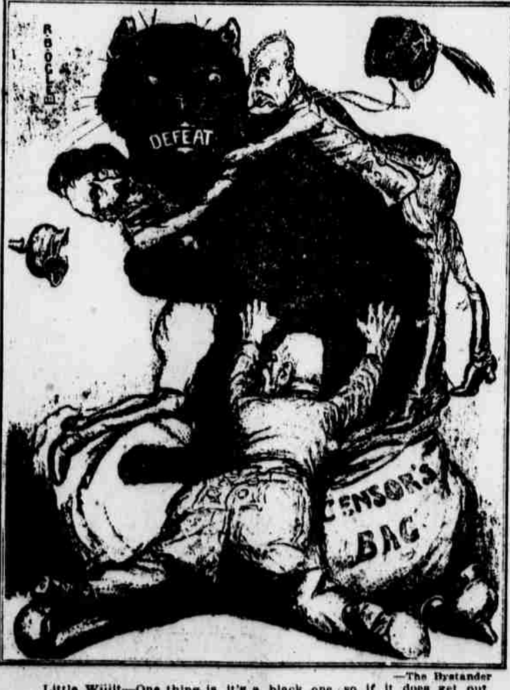
Little Willie - One thing is, it's a black one, so if it does get out we can call it lucky. -The Bystander