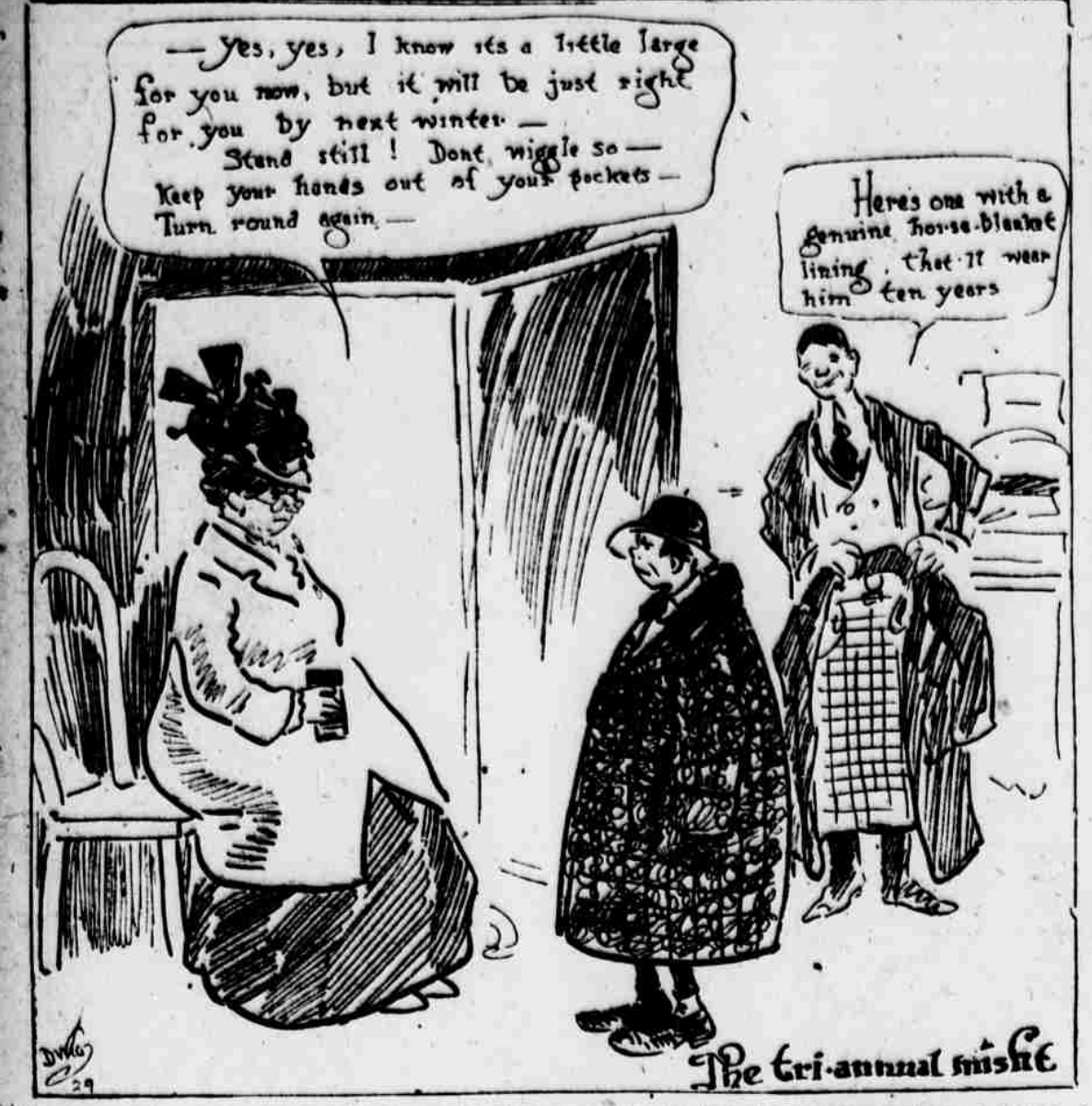
The tri-annual mistle