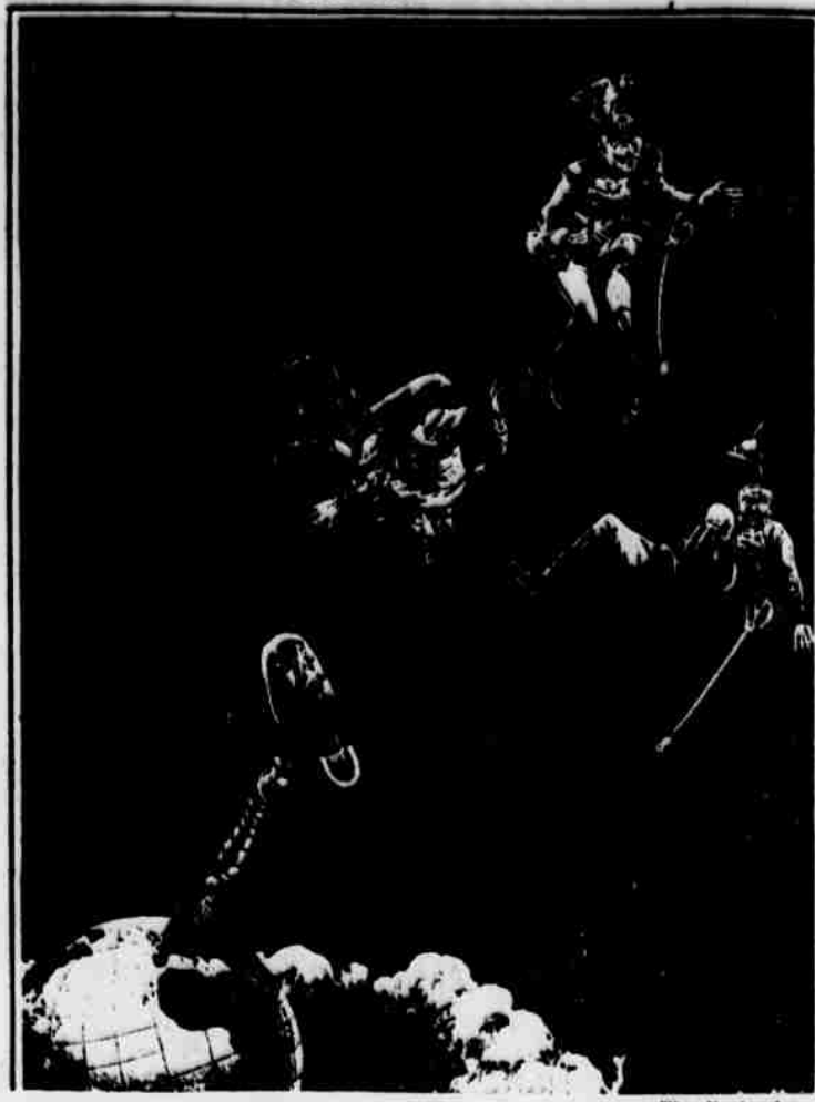
One day soon. -The Bystander