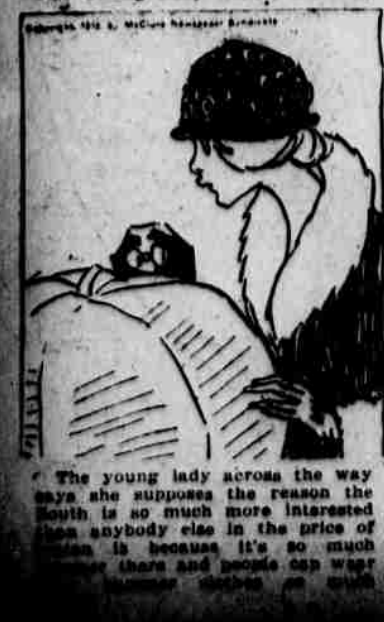
The young lady across the way says she supposes the reason the South is so much more interested than anybody else in the price of cotton is because it's so much more there and people can wear...

THE GUMPS - Nothing's Too Good for Min's Mother