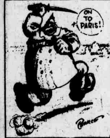
Going or Coming?

"East is East and West is West and yet—"