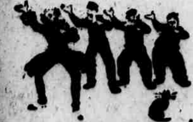
Home Railways, Please Copy

The London Sketch French railway companies have organized elocution lessons for the porters whose duty it is to cry out the names of the stations as the trains come in.