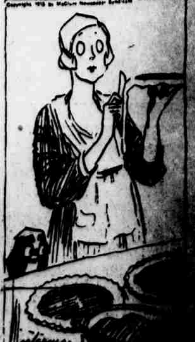
The Young Lady Across the Way

We asked the young lady the way what she thought of contemporary British poetry and she said of course that she never read any of it and in good luck—