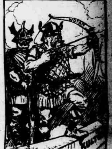
The Crack of Doom

The Bystander. King Olaf Wilhelm—What was that I heard? Einar Tamboerkelver Hindenburg—Victory breaking from thy hand, O Kaiser.