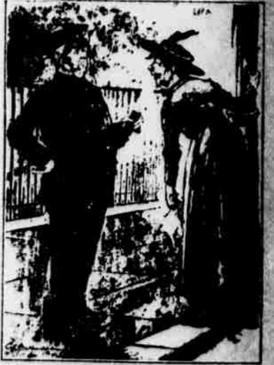
On the Home Front

The Stetch. The Special (who likes to choose his words)—Look here, my good woman, you must stop that singing or accompany me. The Joyous Lady—Right-o, sporty boy! 'um any old tune yer fancy and we'll 'owl it together.