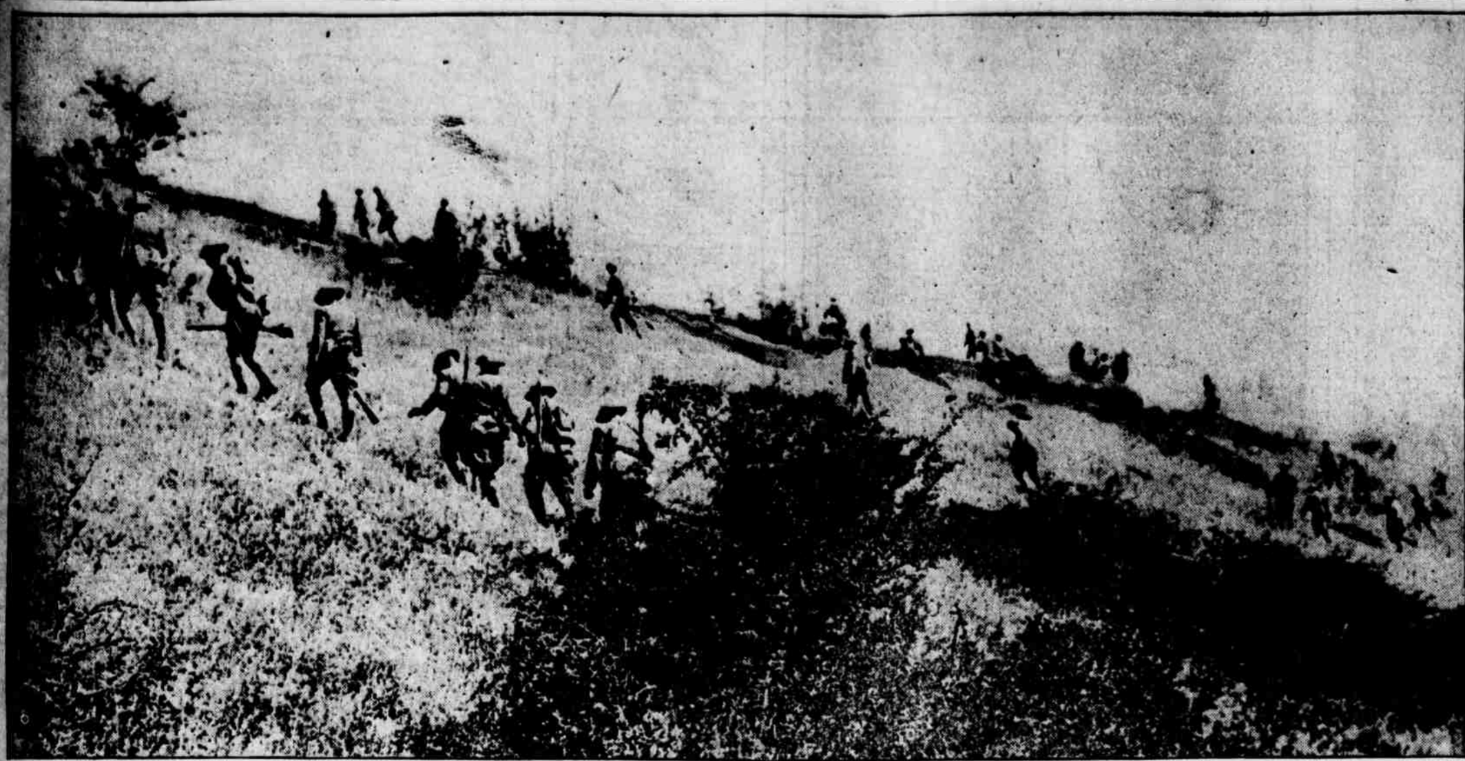
HOW THE DOUGHBOYS ADVANCE after they have gone over the top