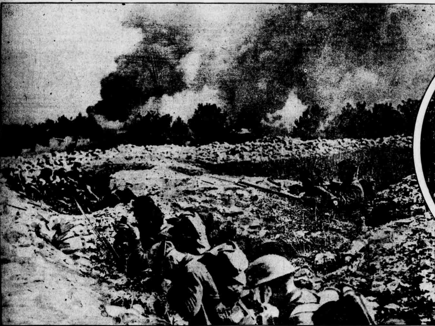
A GAS ATTACK COMING UP—Americans hastily adjusting their gas masks