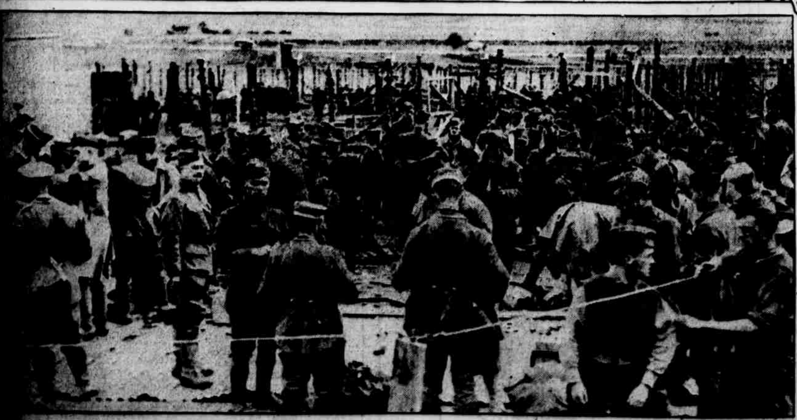
SEARCHING CAPTURED GERMANS FOR PAPERS and concealed weapons before confining them in the prison pens built behind the lines. These are a few of the first men captured by the Americans in their assault on the St. Mihiel salient