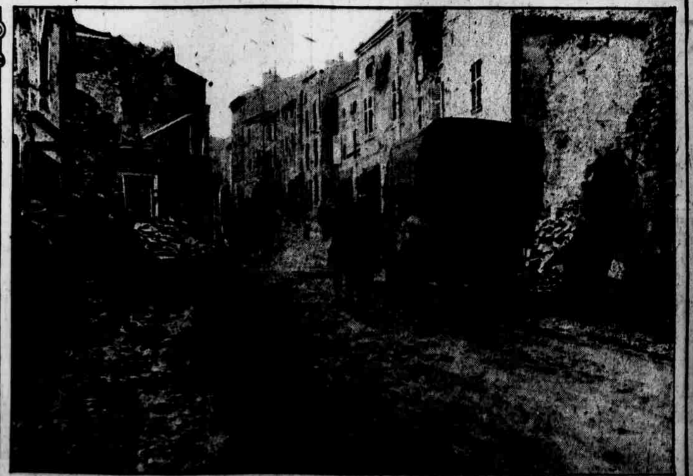
FRENCH AND AMERICAN SOLDIERS in the streets of St. Mihiel