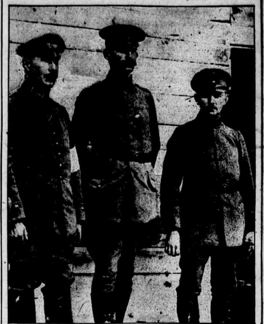
AMONG THE FIRST OFFICERS CAPTURED BY THE YANKEES were this German major (center) and two lieutenants