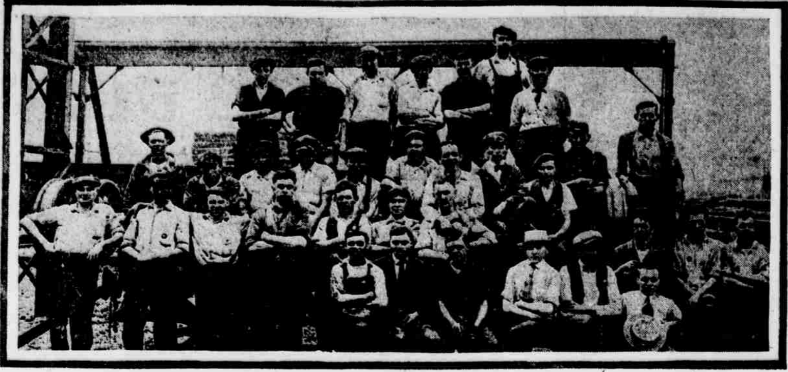
These men are all in the yard maintenance and repair shops and must know their business to hold their jobs. Most of them are foremen