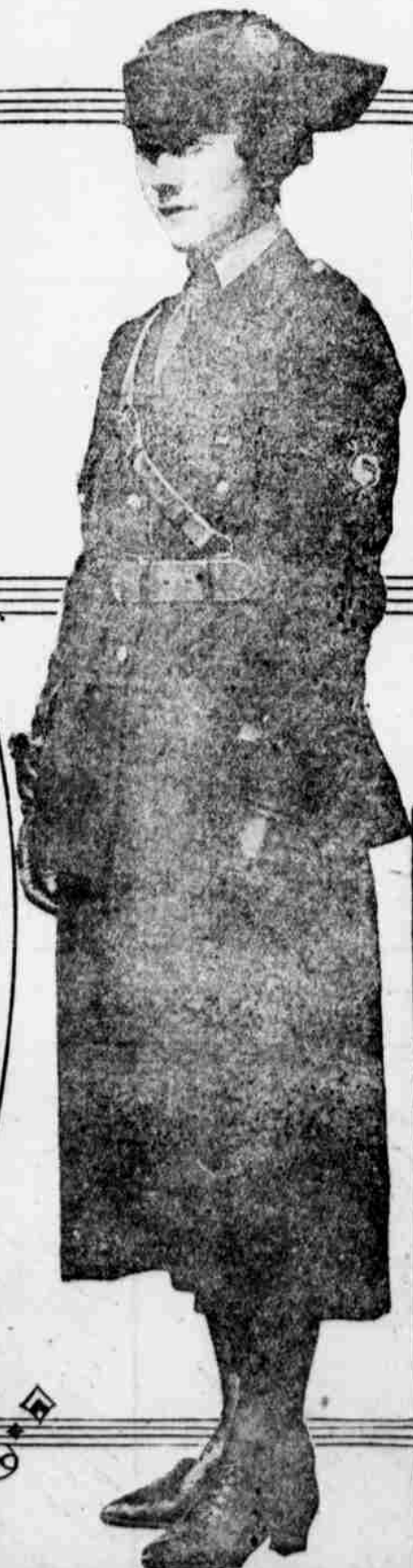
THE NATTY DARK-BLUE UNIFORM of the girls of the Emergency Fleet Corporation.