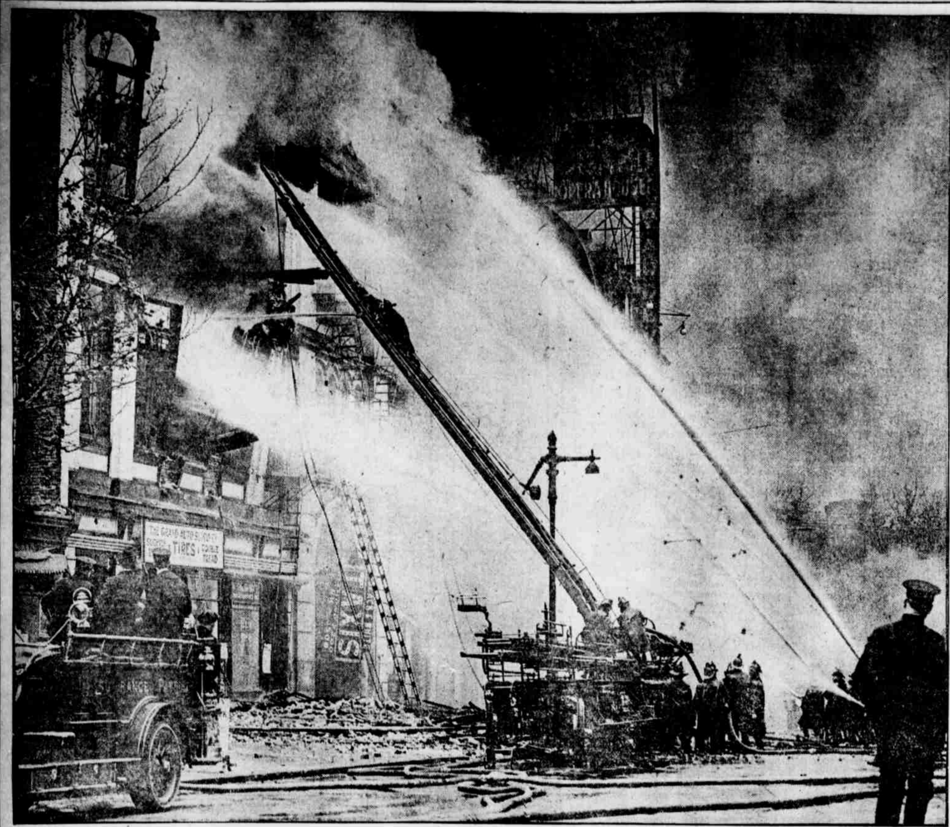
IN FRONT OF THE TAXICAB COMPANY'S BUILDING, WHERE THE FIRE STARTED