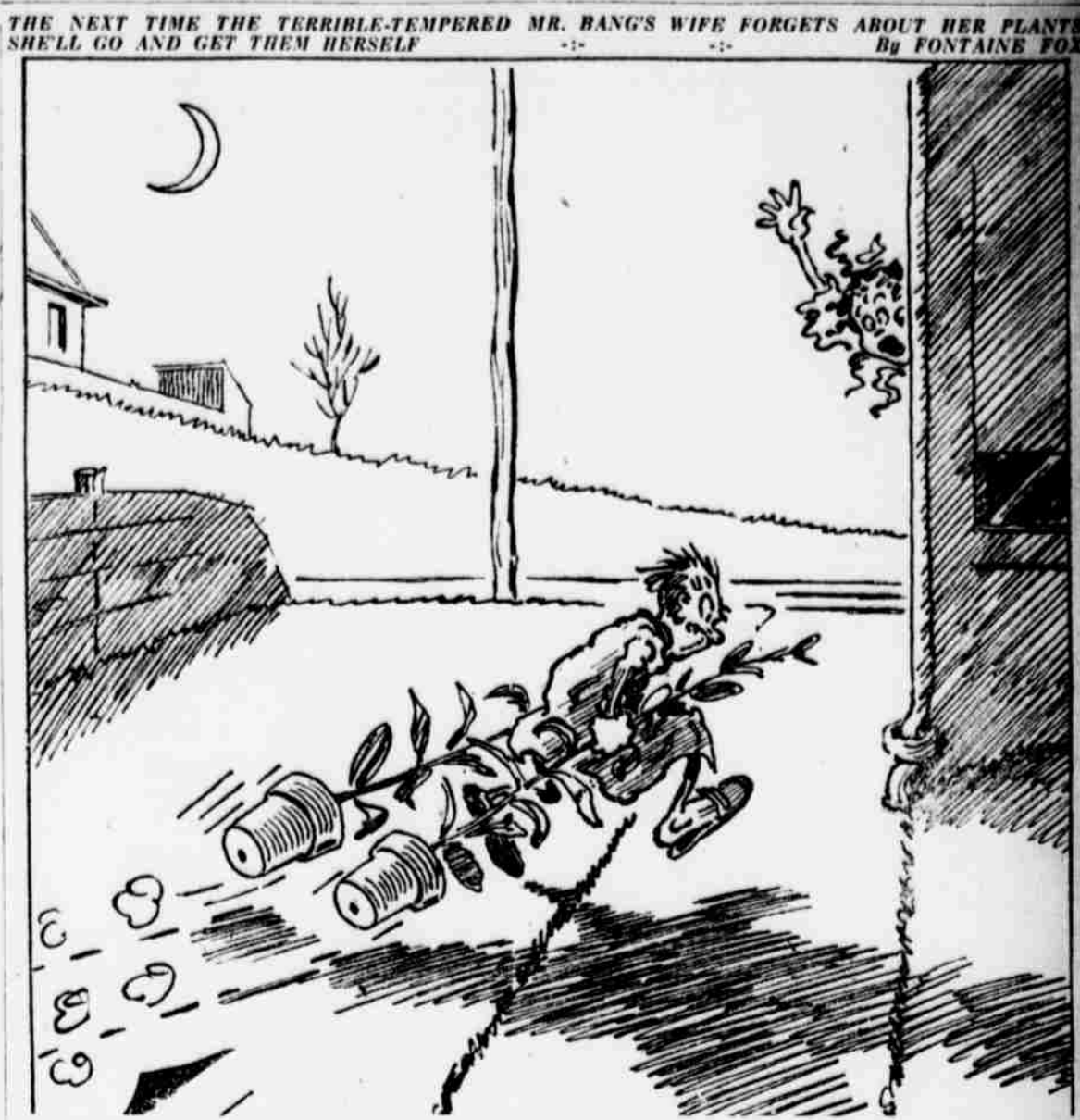
THE NEXT TIME THE TERRIBLE-TEMPERED MR. BANG'S WIFE FORGETS ABOUT HER PLANTS SHE'LL GO AND GET THEM HERSELF