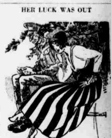
HER LUCK WAS OUT