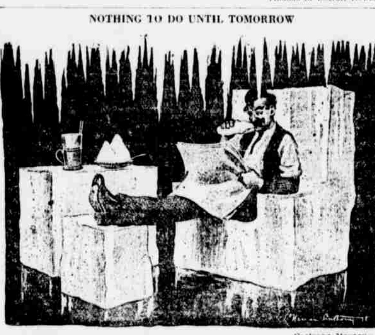
NOTHING TO DO UNTIL TOMORROW