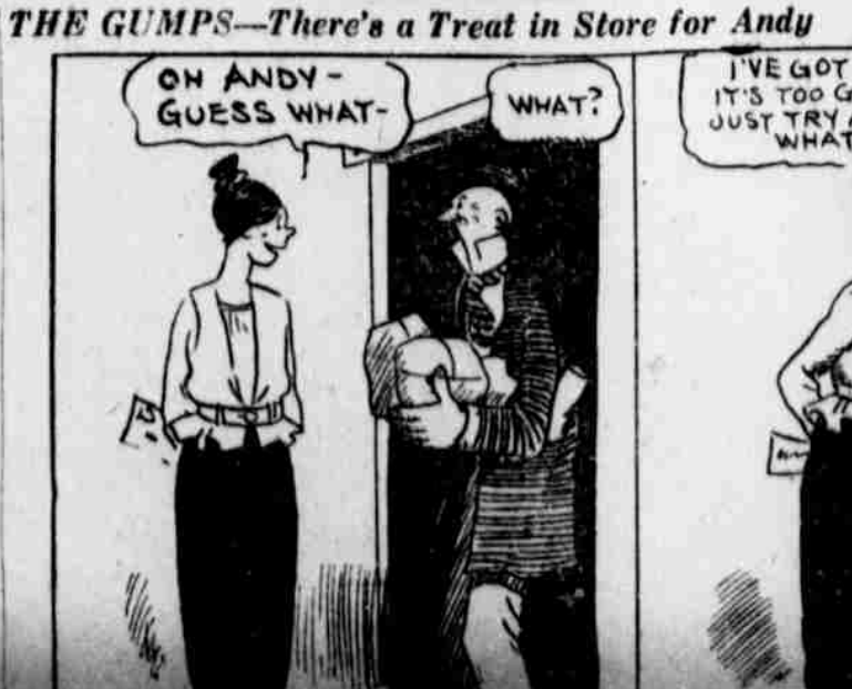
THE GUMPS—There's a Treat in Store for Andy