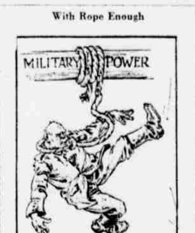
With Rope Enough