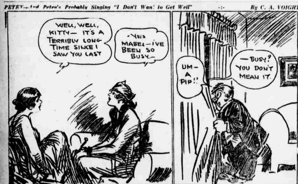
PETEY—And Pete's Probably Singing "I Don't Want to Get Well"