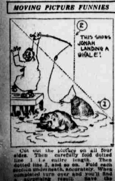
MOVING PICTURE FUNNIES