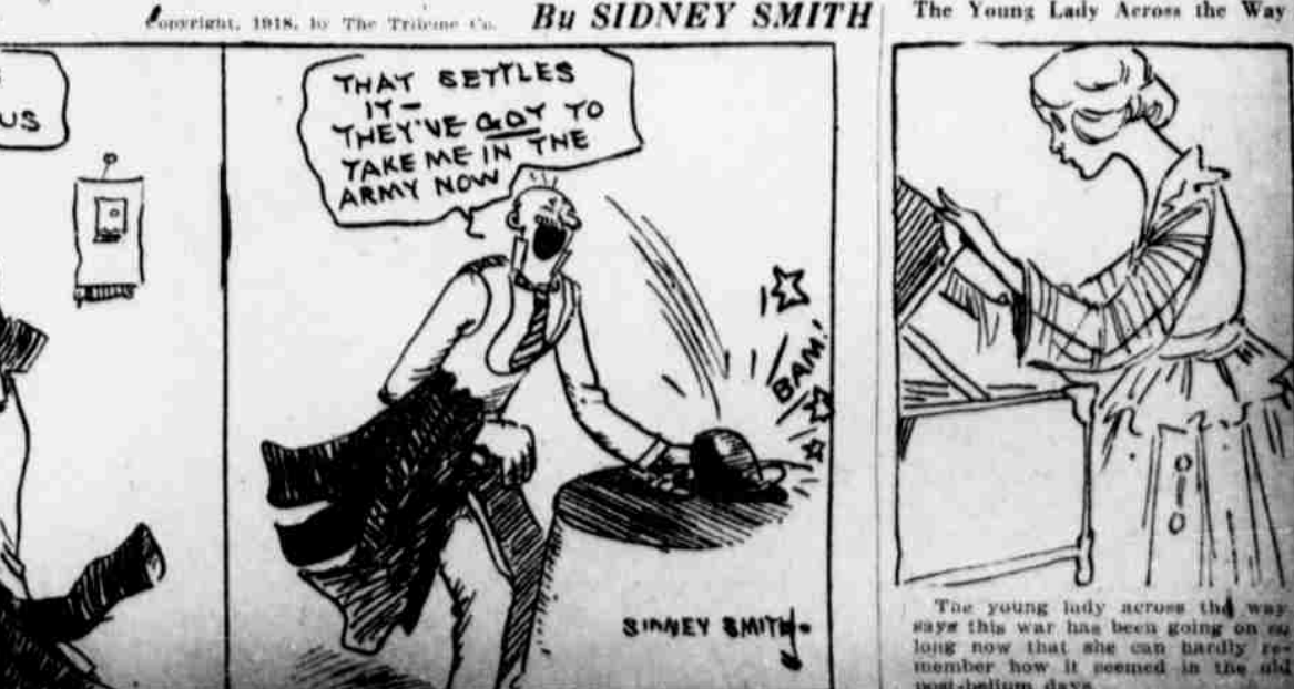
MOVING PICTURE FUNNIES