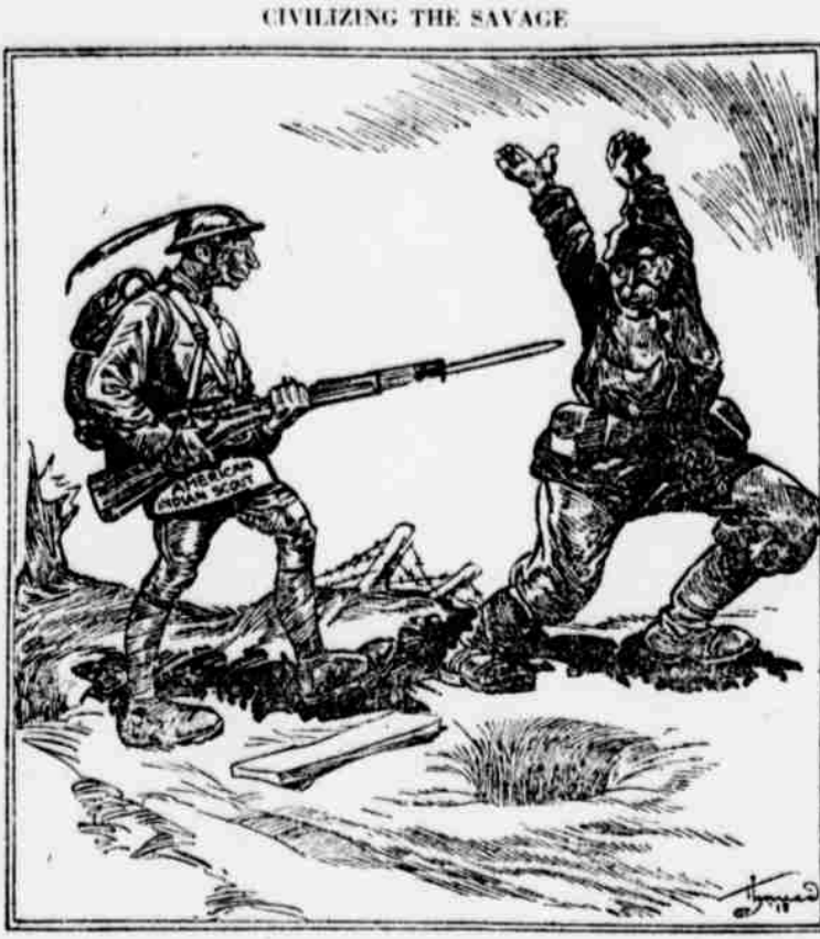
CIVILIZING THE SAVAGE