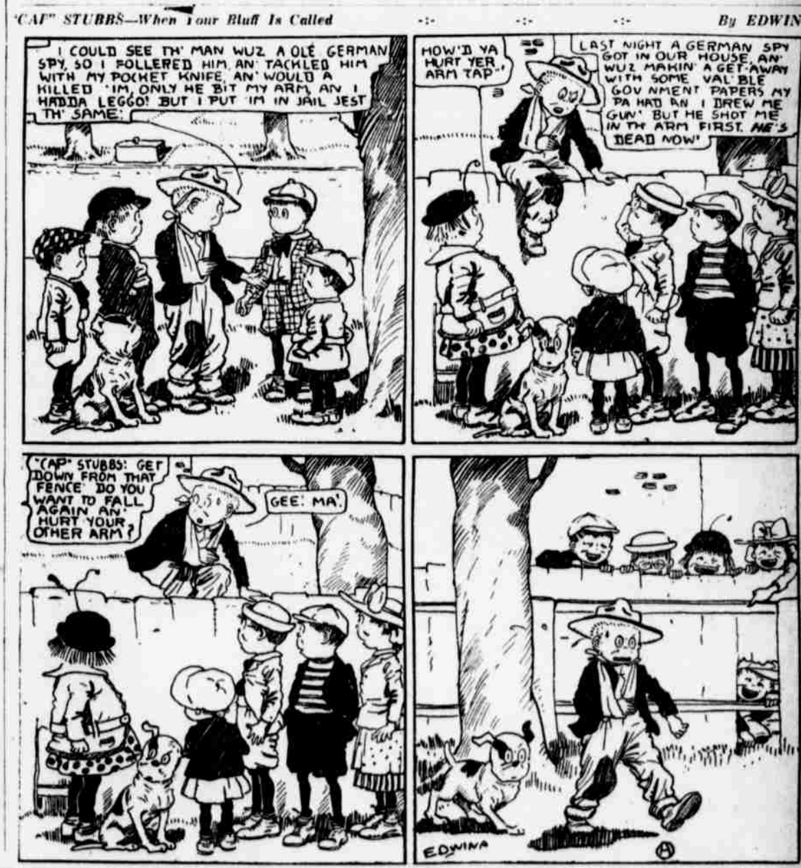
CAP STUBBS—When Your Bluff Is Called