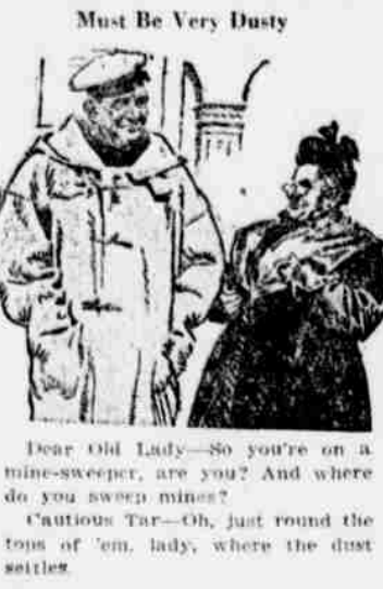
Must Be Very Dusty