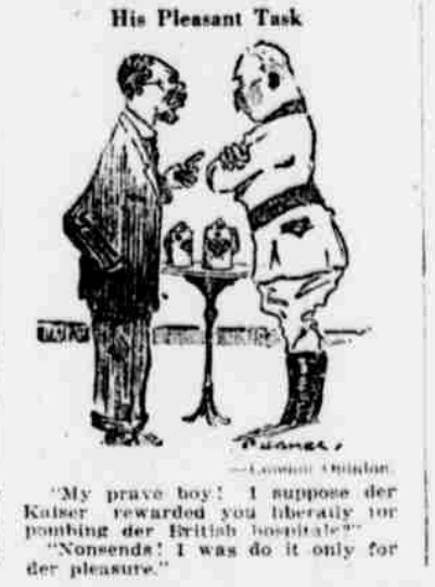
His Pleasant Task