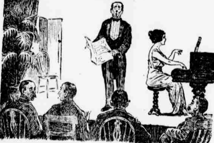
—London Opinion. Tommy (at Red Cross concert)—'What's that man got his eyes shut for while he's singing?' Friend—'Because he can't hear to see us suffer.'