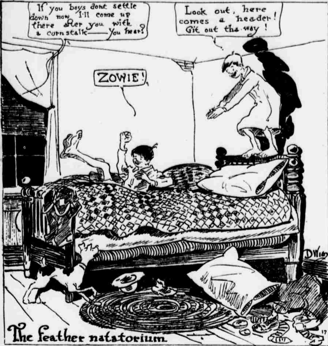
The feather natatorium.