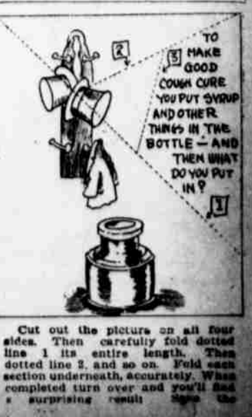
Cut out the picture on all four sides. Then carefully fold dotted line 1 its entire length. Then dotted line 2, and so on. Fold each section underneath, accurately. When completed turn over and push and a surprising result. Sign the