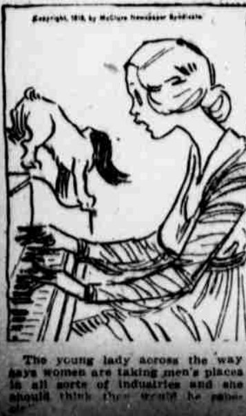
The young lady across the way says women are taking men's places in all sorts of industries and she should think they would be safer.

THE GUMPS—They're Going to Have Company for Dinner