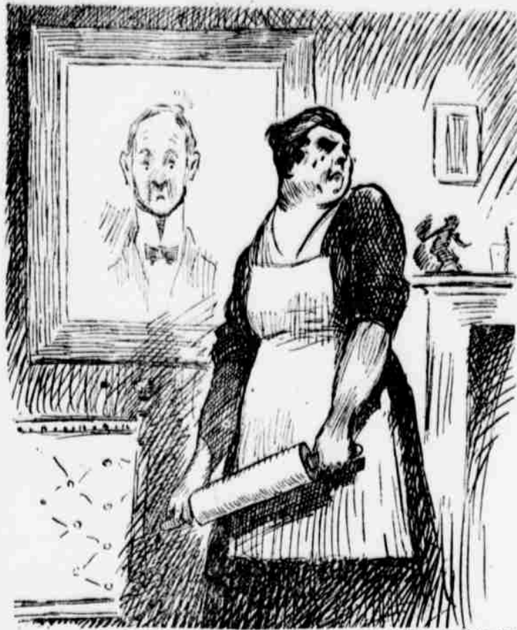
"And just to think that Oscar has gone to France. He actually seemed glad to go to the big war. And after I had tried so hard to please him! Sometimes I'm afraid he thought I was only a poor imitation after all. Oh, dear!"

THE SOLDIER WHO COULDN'T GET HIS TRENCH HELMET OFF