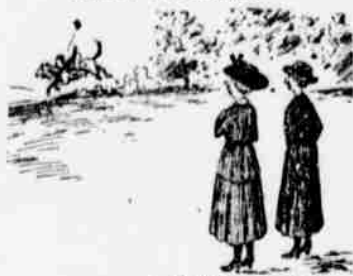
"Mr. Sinkins told me he doted on horses, but I don't think its nice of him to be lugging them in public, do you?"

PETRY—It's a Clever Idea If You Have the Nerve