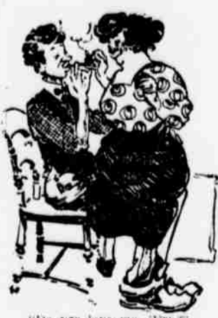
"Do yer love me, 'ker?" "Love yer, 'Liza. I should jest think I does. Why, if yer ever gives me up I'll murder yer. I can't say more'n that, kin I?"