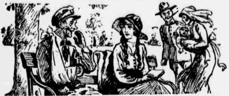
The Flapper—But, George, I don't understand how you managed to camouflage your battery.