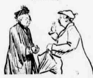
—The Tattler. First Lady—'ear your 'usband's joined up, but 'e carries on just the same, don't 'e?' Second Lady—'Yus, 'e do, dearie; was than ever.'