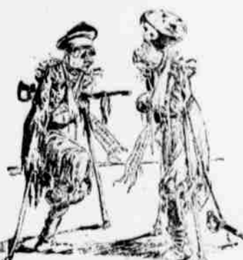
—San Francisco Chronicle. Crown Prince Ruprecht—'All Prince how did you enjoy dot little trip to Paris?' Crown Prince Frederick Wilhelm—'Yah well, France but tell me about your sojourn at dose channel ports.'