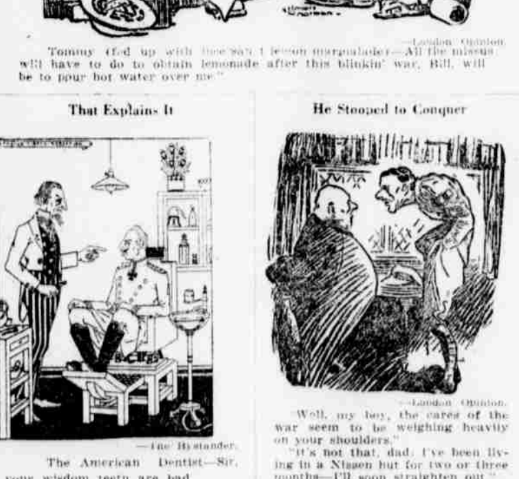
That Explains It