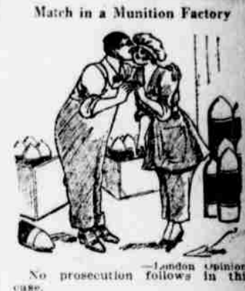
Match in a Munition Factory