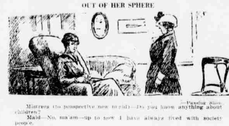
OUT OF HER SPHERE