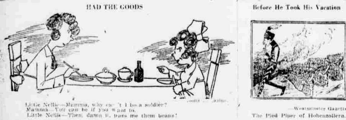
HAD THE GOODS

WHEN THE TOONERVILLE TURNPIKE WAS BEING REPAIRED LAST WEEK THE SKIPPER INDUCED HIS FRIEND, ED SIMS TO RUN THE BIG STEAM ROLLER ON THE TROLLEY RAILS.