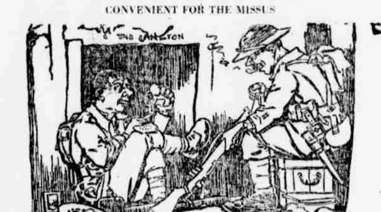
CONVENIENT FOR THE MISSUS