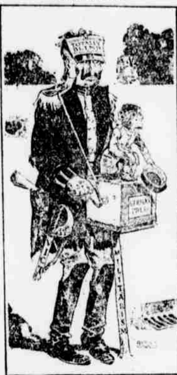
The Lost Sword