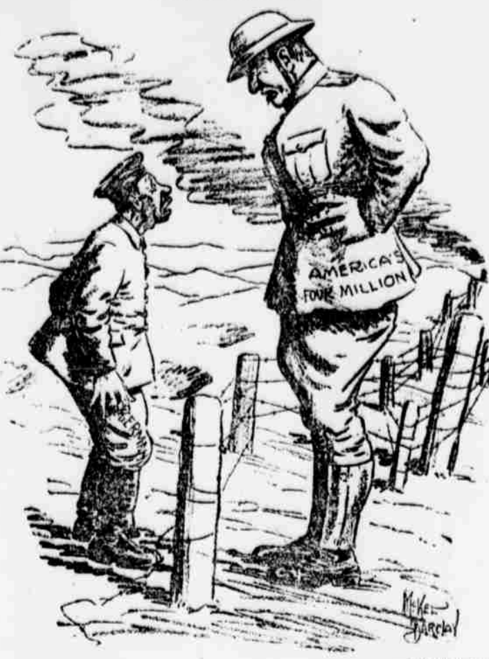
The superman's awakening