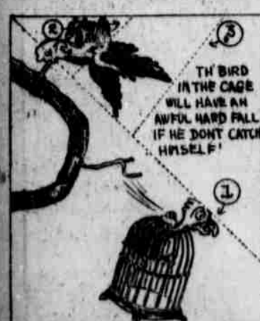
MOVING PICTURE FUNNIES

Put out the picture on all four sides. Then carefully fold dotted lines 1 to 4 in entire length. Then dotted line 5 and so on. Fold each section underneath, accurately. When completed turn over and you'll find a surprising result. Save the picture.