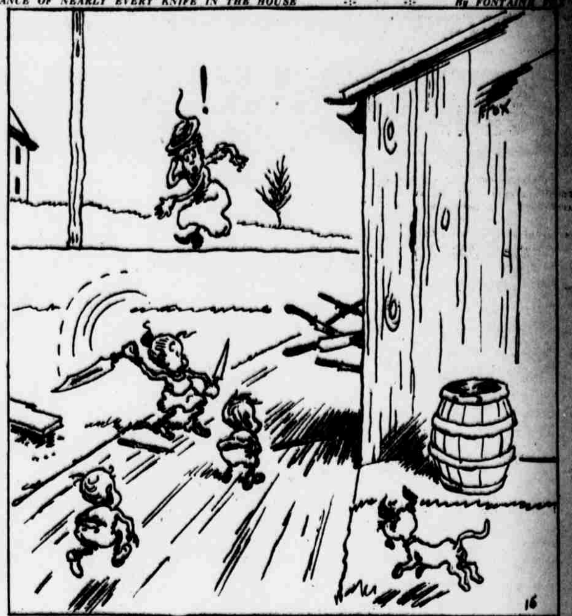
A "STRATEGIC WITHDRAWAL"