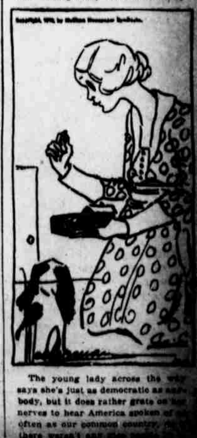
The Young Lady Across the Way

The young lady across the way says she's just as democratic as anybody, but it does rather grate on her nerves to hear America spoken of so often as our common country, especially there wasn't any one else.