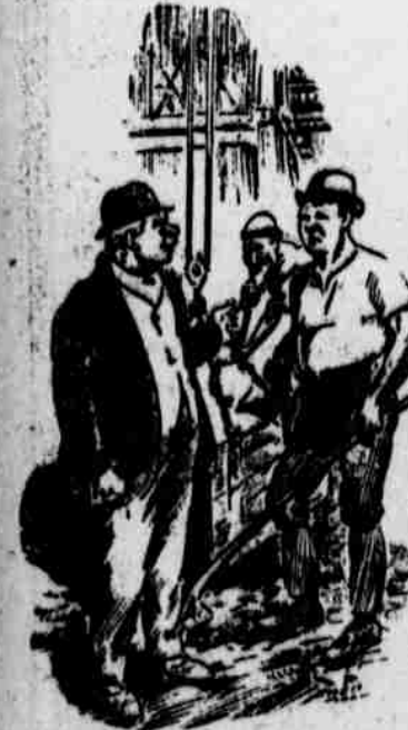
No Use Arguing

—Sydney Bulletin. "Now, look 'ere; old Bill's putting in three shovelfuls to your one." "Well, I've told 'im about it, but 'e won't take any blanky notice."