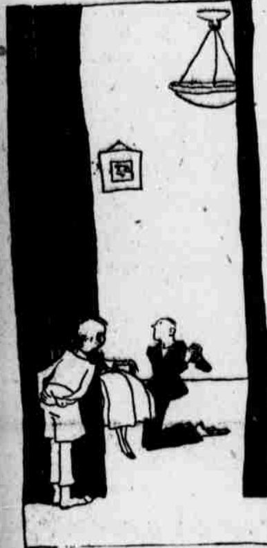
—Cartoons Magazine. An advanced listening post.

—Sydney Bulletin. Dot—I had nine proposals at Manley last summer. Gladys—How disagreeably persistent a holiday acquaintance can be!