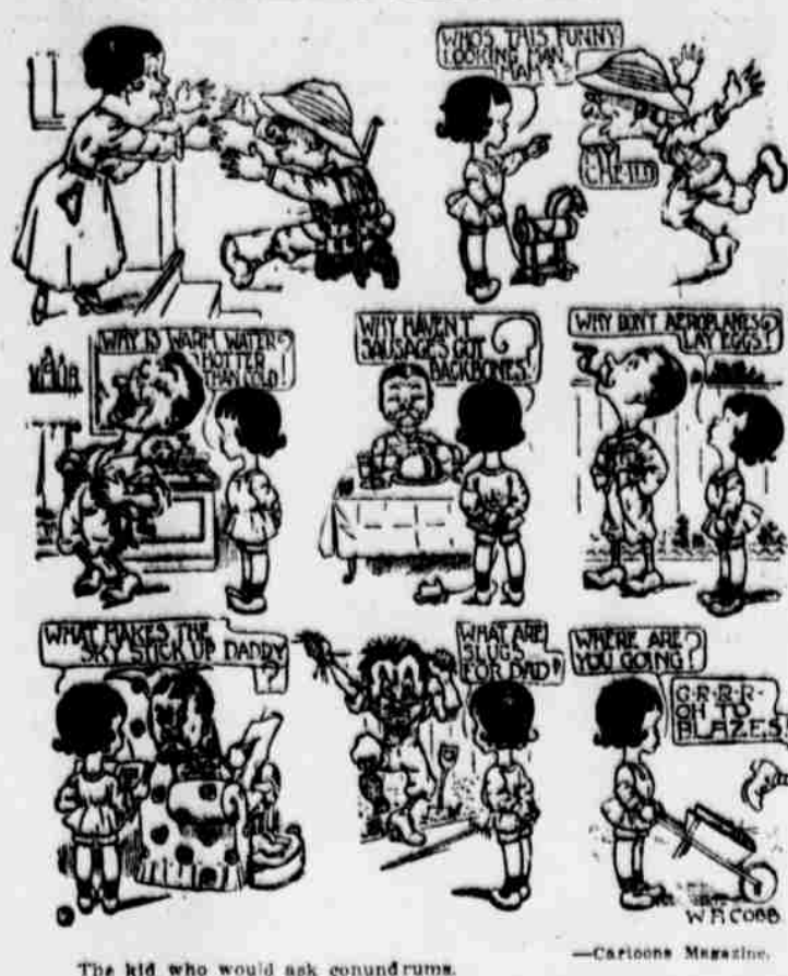
The kid who would ask conundrums