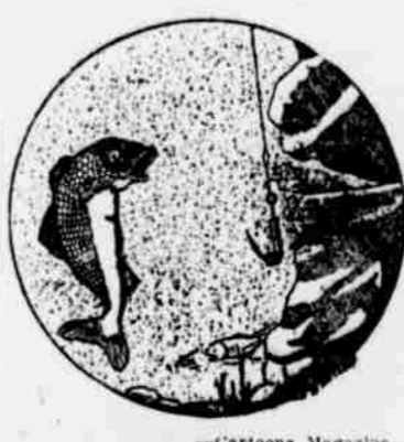
A fish, but not a sucker.