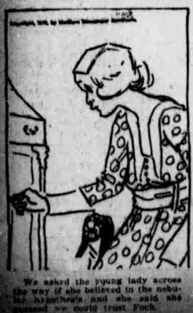
We asked the young lady across the way if she believed in the robust hypothesis, and she said she wished we could trust Foch.

THE GUMPS—It's a Proud Day in the Gump Family