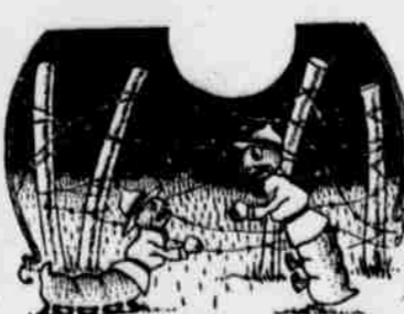
Why Not Use Cooties?

PETEY—"Five X" Is for Most of Those Who Think They Ought to Be Officers