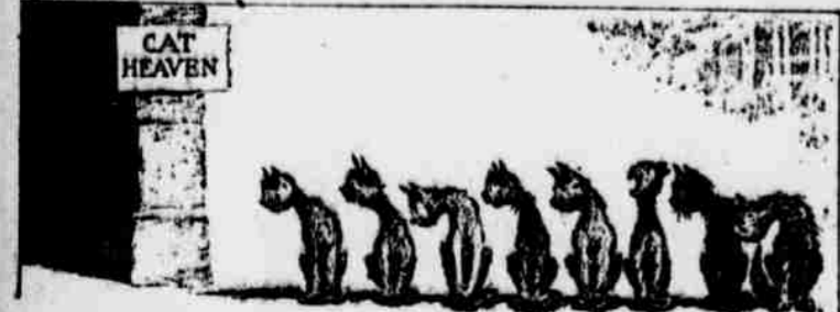
Waiting for the ninth.