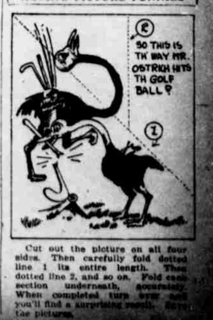
Cut out the picture on all four sides. Then carefully fold dotted line 1 its entire length. Then dotted line 2, and so on. Fold each section underneath, accurately. When completed turn over and you'll find a surprising result. Save for pictures.

50 THIS IS THE WAY MR. OSTRICH HITS THE GOLF BALL?