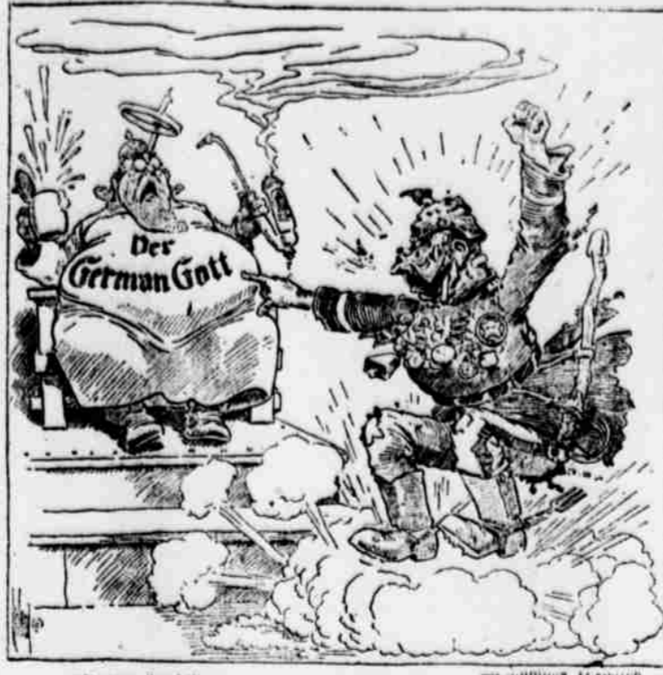
No Doubt About It