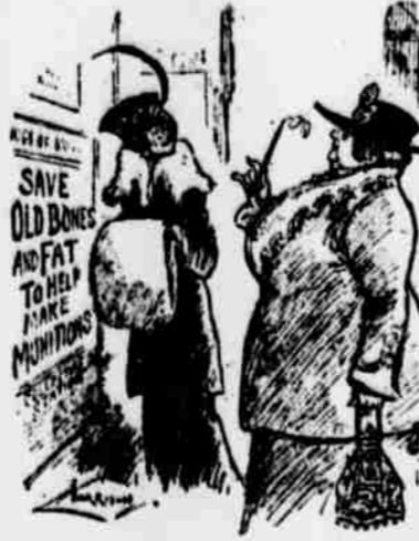
The Union Forever