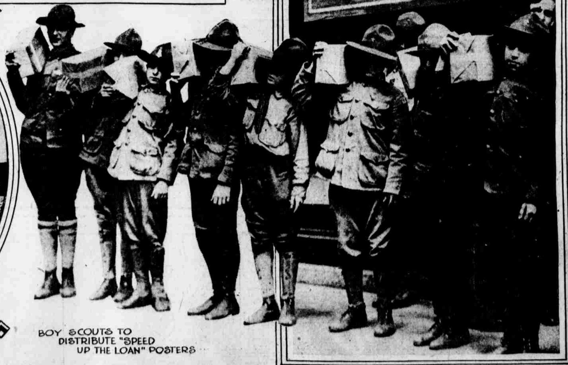
BOY SCOUTS TO DISTRIBUTE "SPEED UP THE LOAN" POSTERS