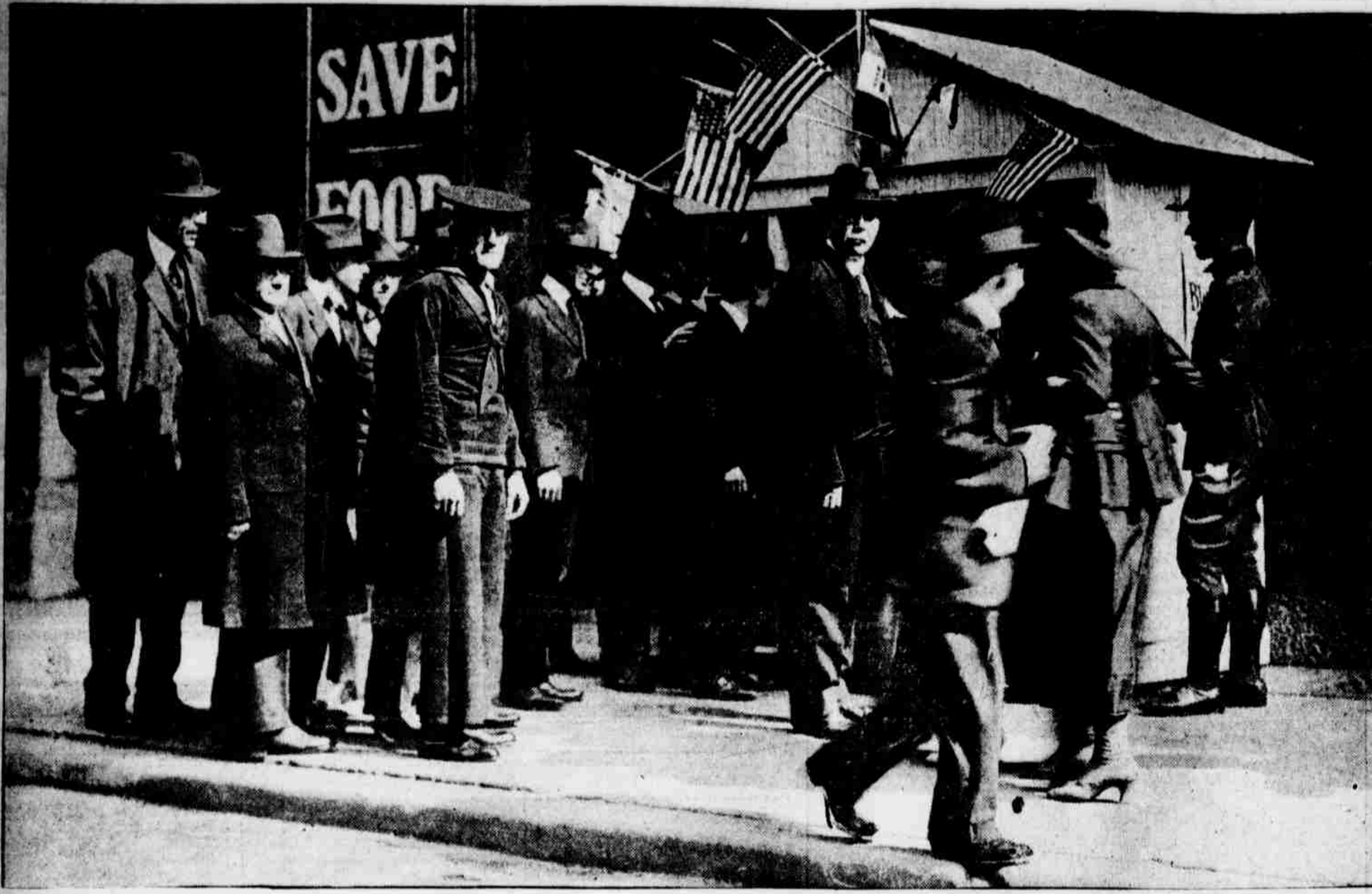
GOING OVER THE TOP AT 4 TH and CHESTNUT.

LEND, LEND, LEND. SUBSCRIPTIONS TO THE FOURTH LIBERTY LOAN SWEEPING ALONG TO SUCCESS