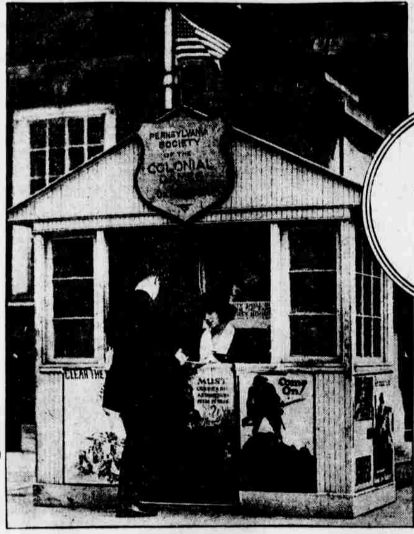
Where the Passer-by May Sign for Liberty