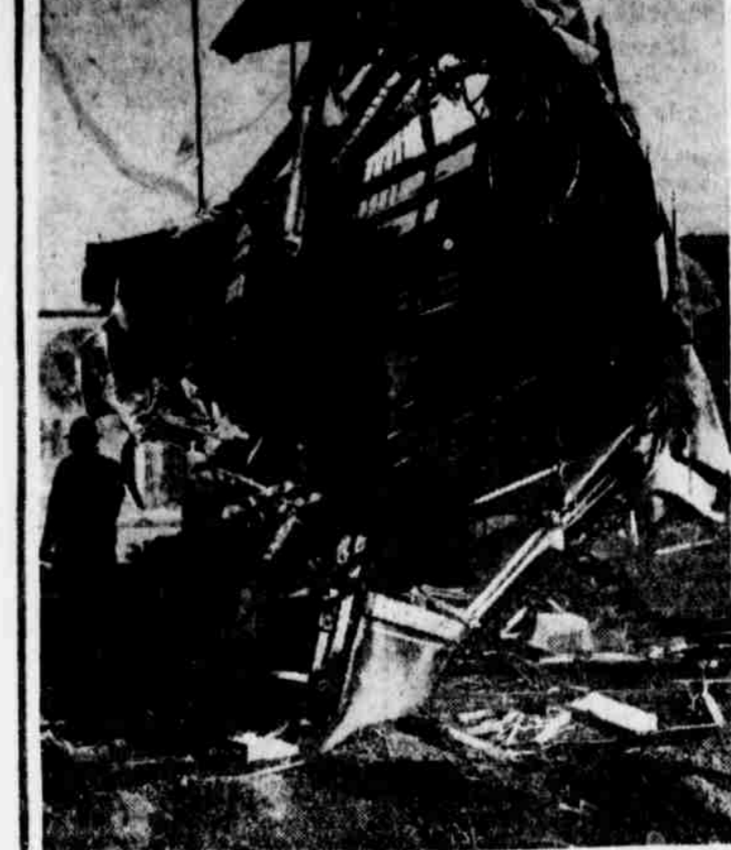
Four men were injured when an eastbound Hog Island trolley car was struck by a shifting engine at Broad street and Oregon avenue