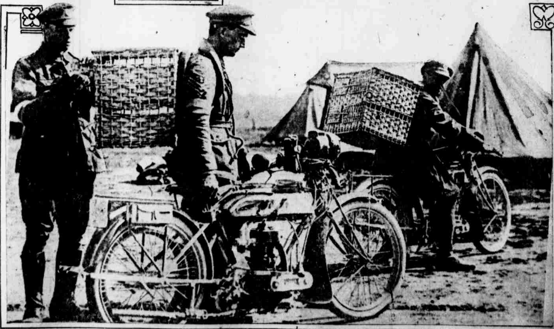
MOTORCYCLES ARE USED in transporting carrier pigeons back and forth, along the battlefield by British Tommies.