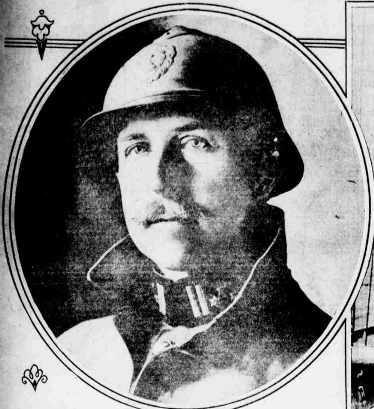
ALBERT OF BELGIUM in his trench helmet. The latest photograph of Belgium's warrior King. At the head of his troops he is forcing the Huns back across the country they have so unmercifully ravaged.

OVER THE SEA AND AT HOME THE CAMERA PICTURES THE LIVE NEWS EVENTS OF THE DAY