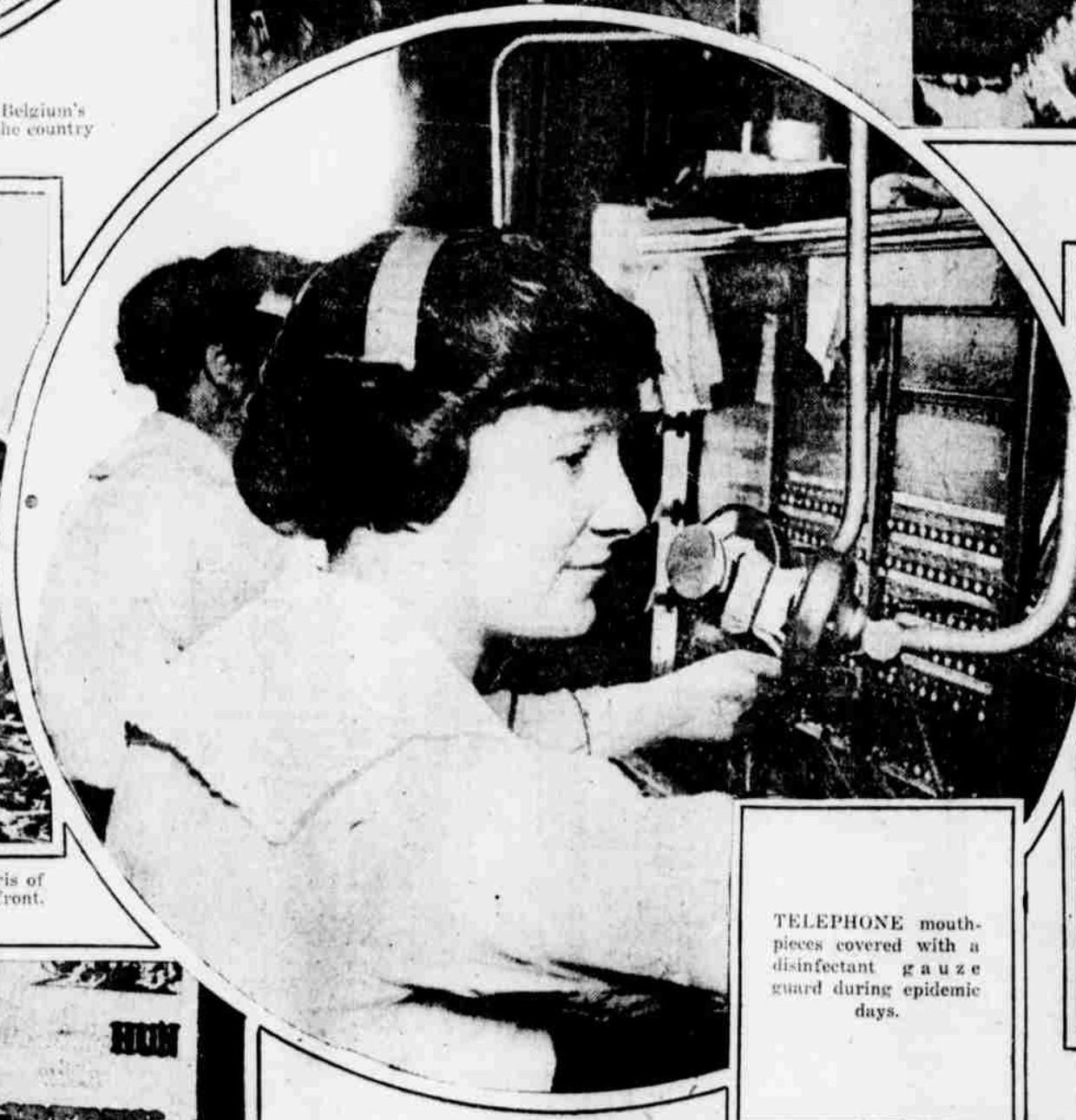
TELEPHONE mouthpieces covered with a disinfectant gauze guard during epidemic days.