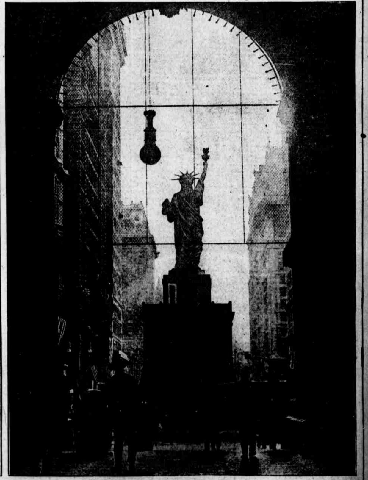
CAN YOU PASS THIS AND NOT BUY A BOND? ...