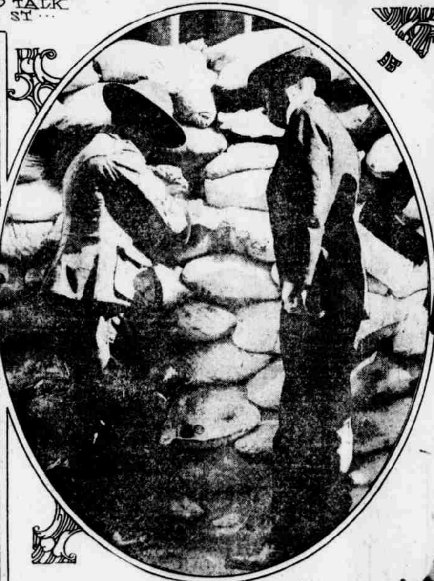
CAPTURED BY A BOY SCOUT