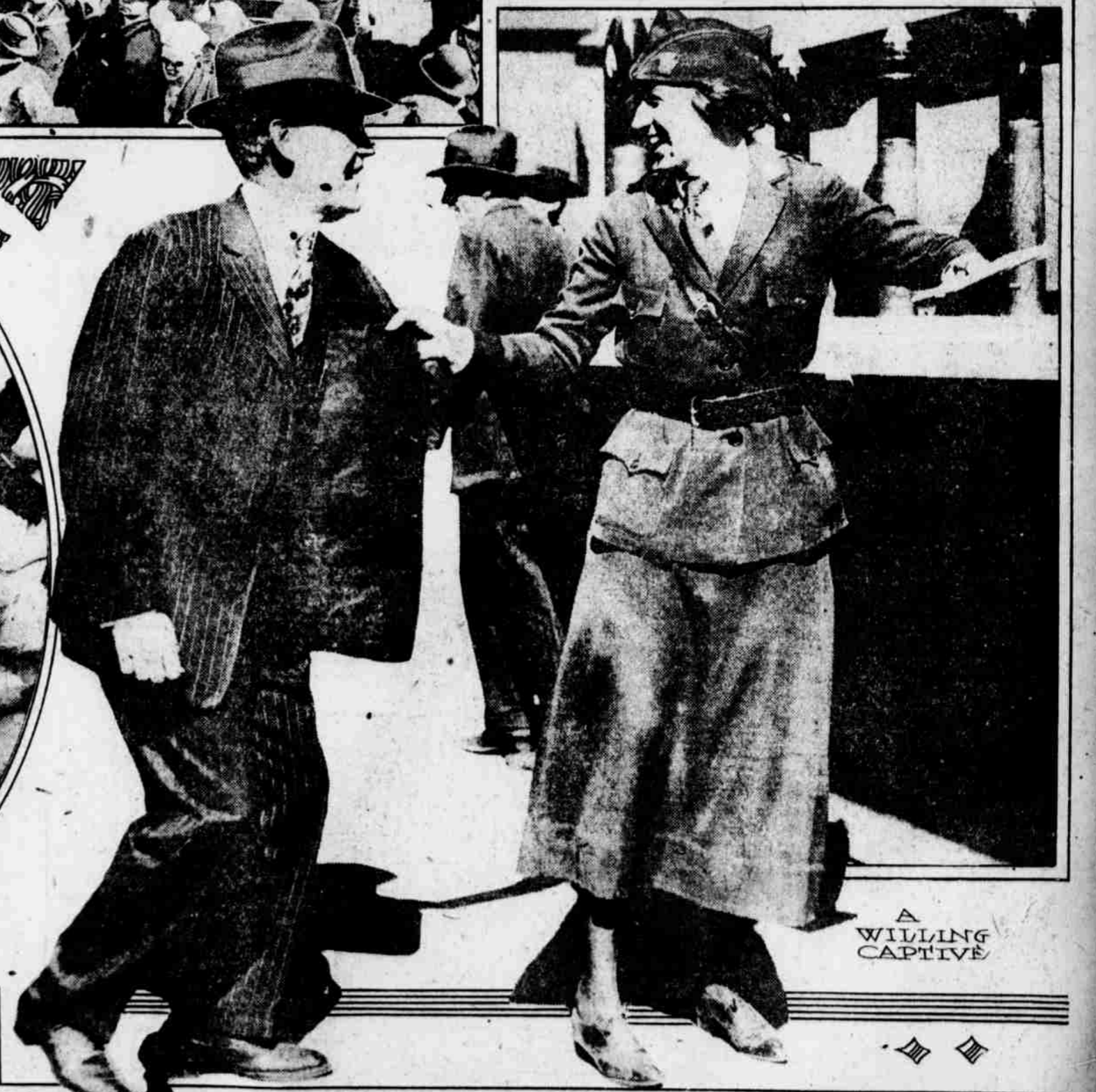
A WILLING CAPTIVE