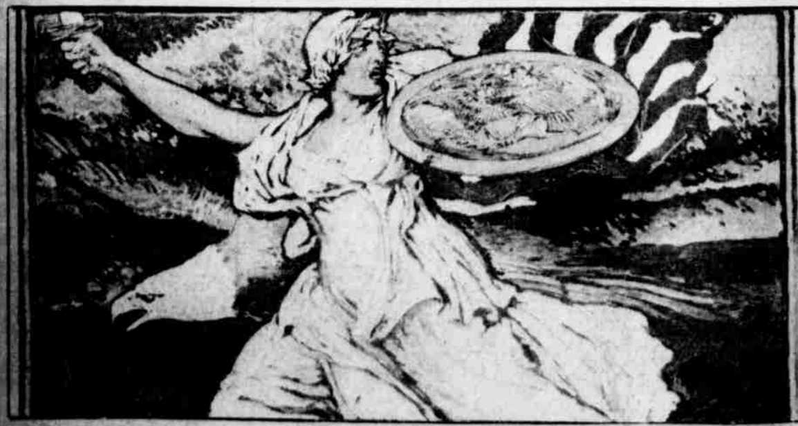
A POWERFUL POSTER APPEAL