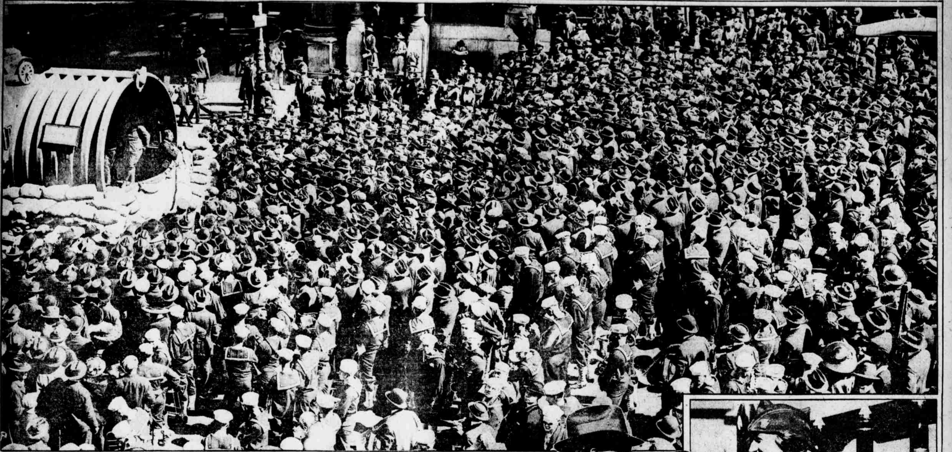
EAGER LISTENERS TO A BOND TALK FROM THE "SHELL-PROOF" IN BROAD ST.