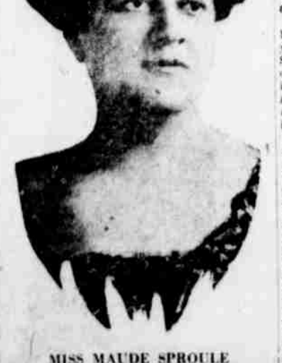
ontralto singer of note, who died her home in West Philadelphia