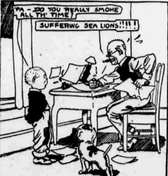
PA—DO YOU REALLY SMOKE ALL TH' TIME?