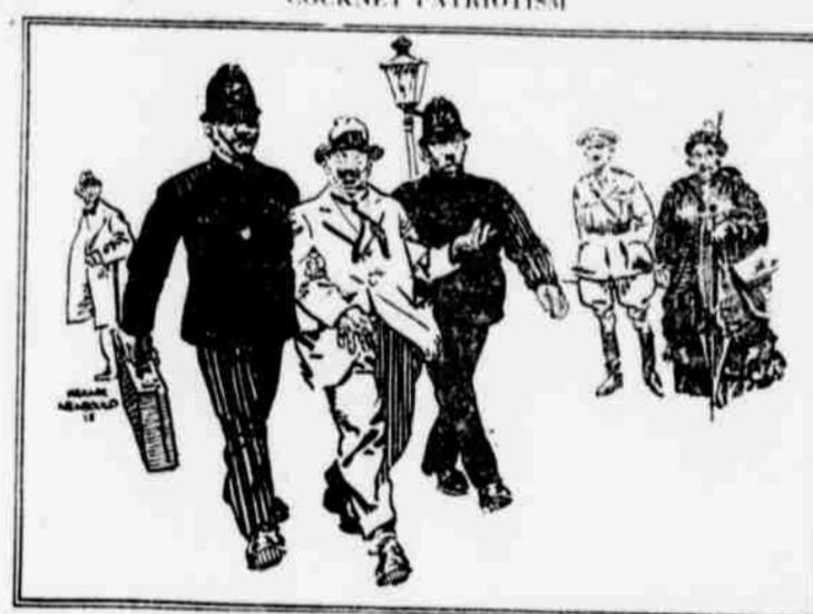
"Old Lady—Yes, my dear, that's the kind of "Herr rain" I do like to see."