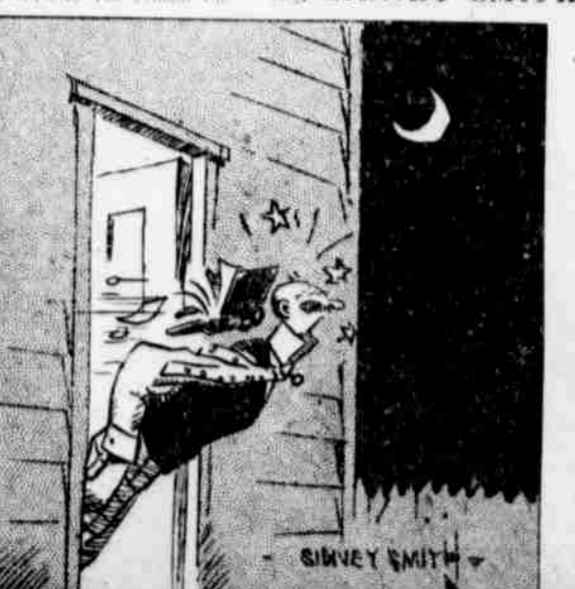
WHAT MAKES YOU THINK THAT?