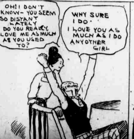
OH! I DON'T KNOW—YOU SEEM SO DISTANT—A TALE DO YOU REALLY LOVE ME AS MUCH AS YOU USED TO?