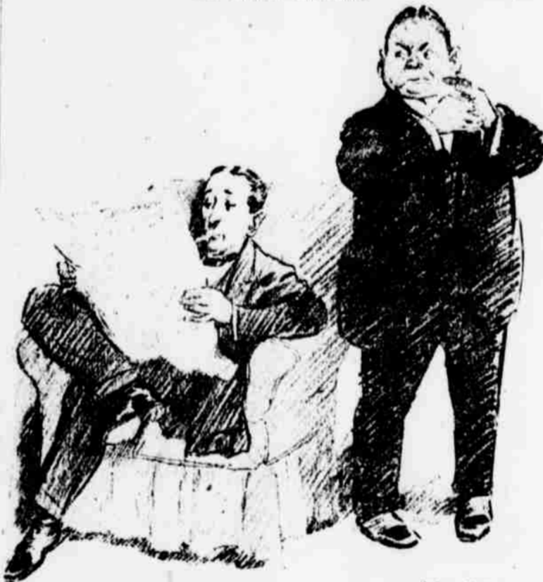
"My mother had a deuced handsome face." "It was your father, then."