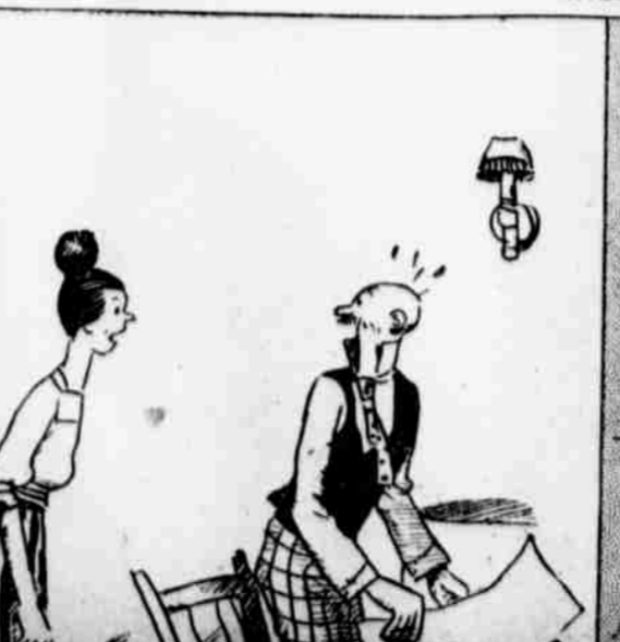
WHY SURE I DO—I LOVE YOU AS MUCH AS I DO ANYOTHER GIRL