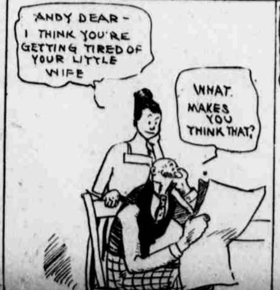
ANDY DEAR—I THINK YOU'RE GETTING TIRED OF YOUR LITTLE WIFE