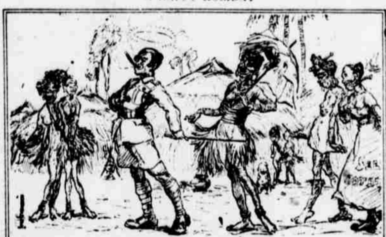
A HAPPY HOLIDAY