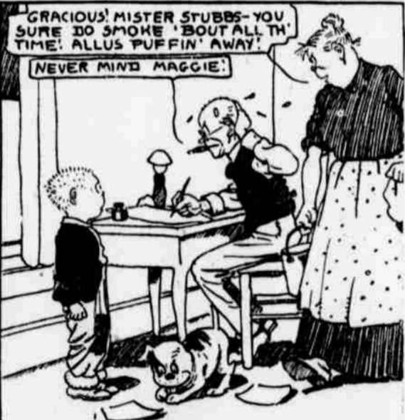
GRACIOUS, MISTER STUBBS—YOU SURE DO SMOKE 'BOUT ALL TH' TIME! ALLUS PUFFIN' AWAY!