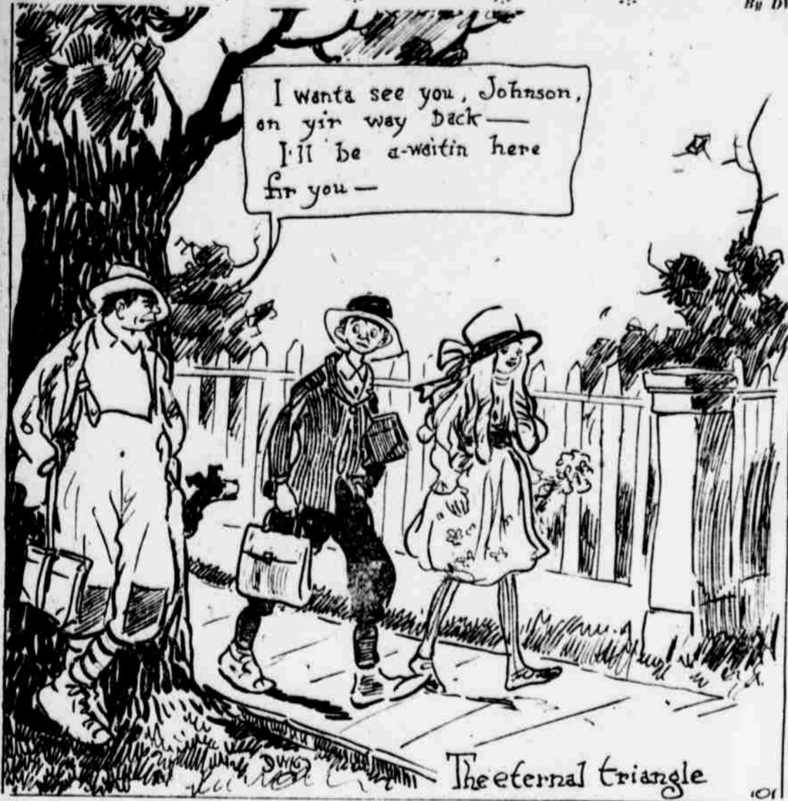
The eternal triangle