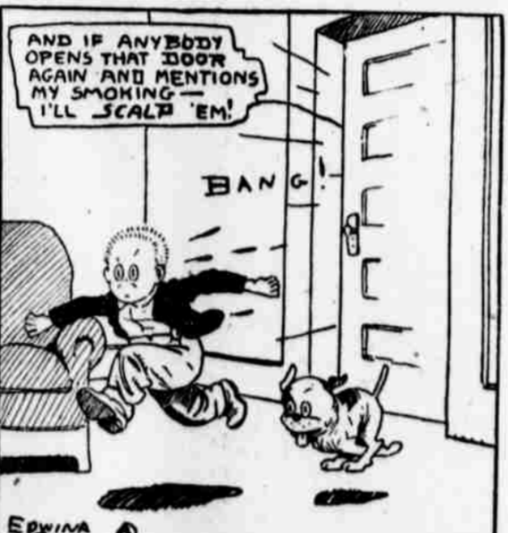
AND IF ANYBODY OPENS THAT DOOR AGAIN AND MENTIONS MY SMOKING—I'LL SCALP 'EM!