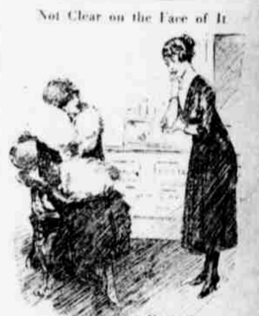
Not Clear on the Face of It