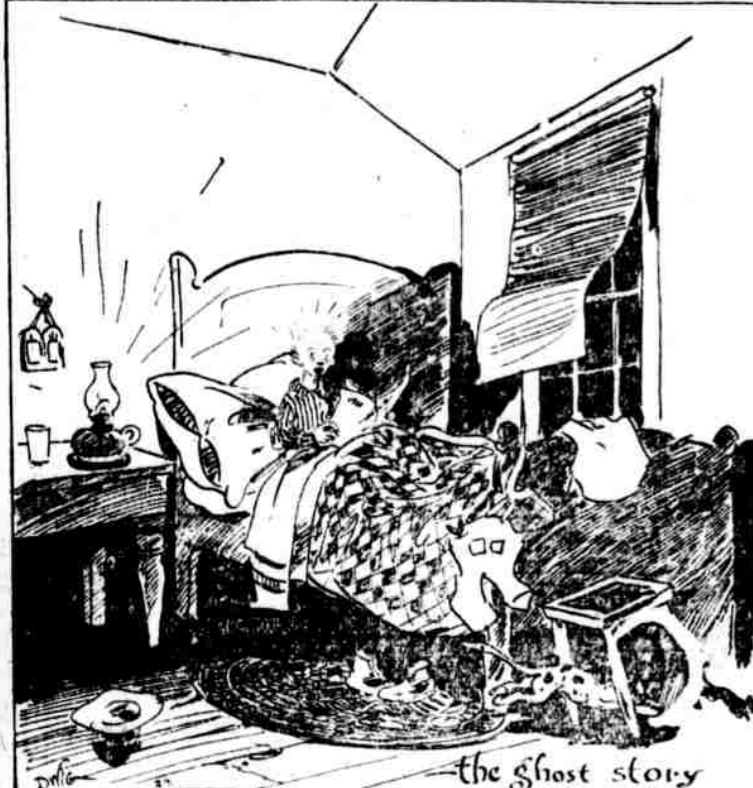
the ghost story