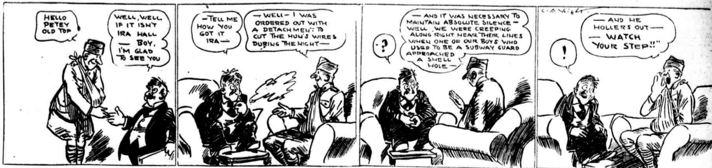
By C. A. VOIGHT