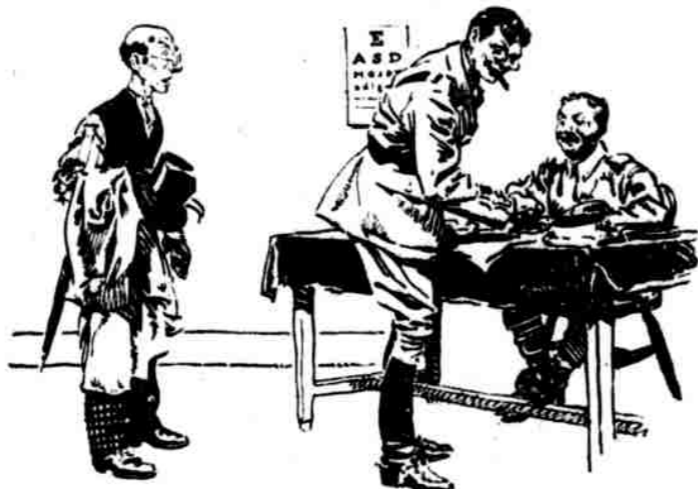
WITH A DIFFERENCE

Forty-five—Well, what do you think I am, doctor? Medical Officer—Oh, A-1. Forty-five—Not really? M. O.—No, not really—category.