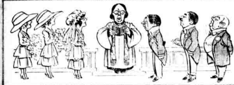
THE CARD HABIT—AS IT MAY BE

The Parson—Will you have th's woman to be thy wedded wife, according to the particulars set forth in the wedding card?