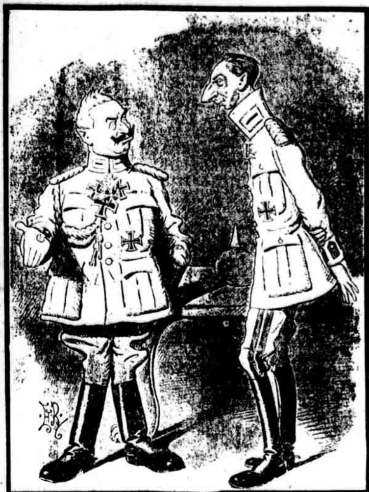
The Liquor and the Licked

It—simply sickening—not getting into Rheims or Epernay? Biggest and finest stock of liquor in the world—millions of bottles hiding over there. H. I. M.—Biggest and finest liquor indeed? Instead of which you've had the biggest and finest licking in the world, nearly got yourself bottled up, and had a hiding we shan't forget in a hurry.