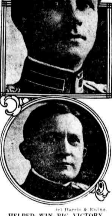
HELPED WIN BIG VICTORY Colonel William Mitchell (top) directed the aerial work of the St. Mihiel drive...