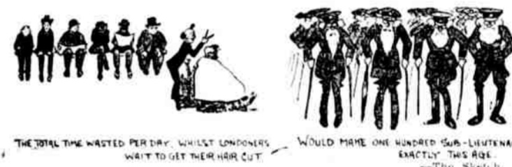
WASTE OF DYNAMIC ENERGY IN WAR

THE TOTAL TIME WASTED PER DAY, WHILEST LONDONERS WAIT TO GET THEIR HAIR CUT, WOULD MAKE ONE HUNDRED SUB-LIEUTENANTS EXACTLY THIS AGE.