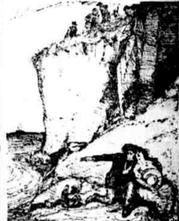
A Day's Excursion

—The Sketch. The Post—Oh, this is the moment I have hungered for! Alone! Alone! Only the vast ocean a witness to our great passion of love. Voice from above—That's the stuff to give her.