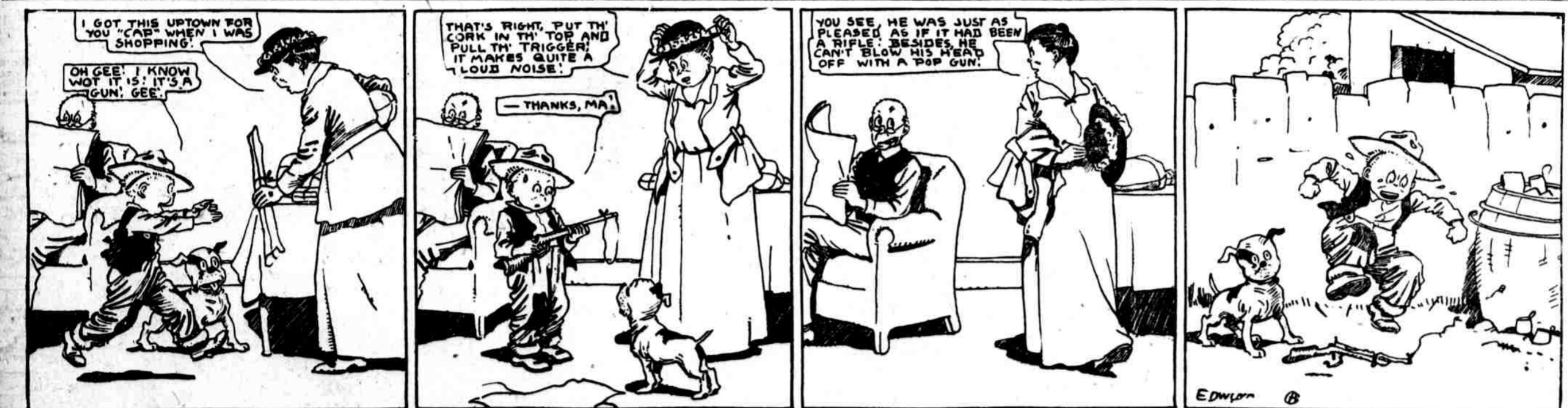
PETEY—It All Depends on What Comes Within His Vision