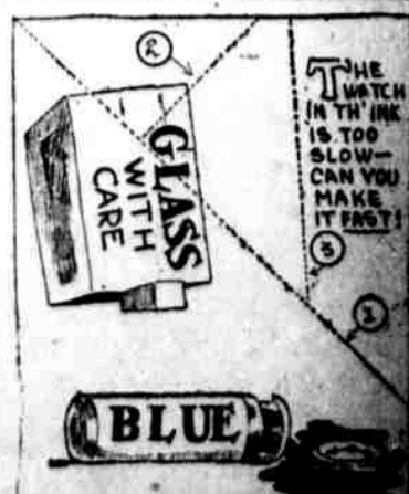
MOVING PICTURE FUNNIES

Cut out the picture on all four sides. Then carefully fold dotted line to its entire length. Then dotted line 2, and so on. Fold each section underneath, accurately. When completed turn over and you'll see a surprising result.