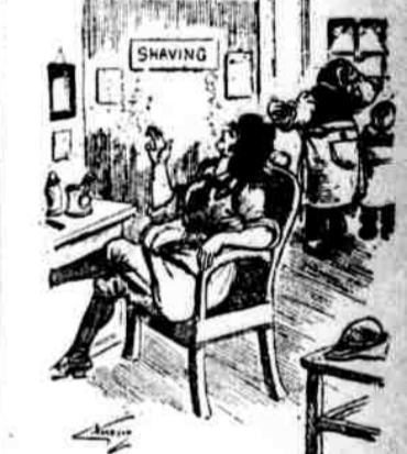
The Style Hadn't Reached Stodgely-on-the-Wold

—London Opinion. Village Barber (puzzled at order from Land Girl)—See she wants her hair "bobbed." Hanged if I know wot she means.