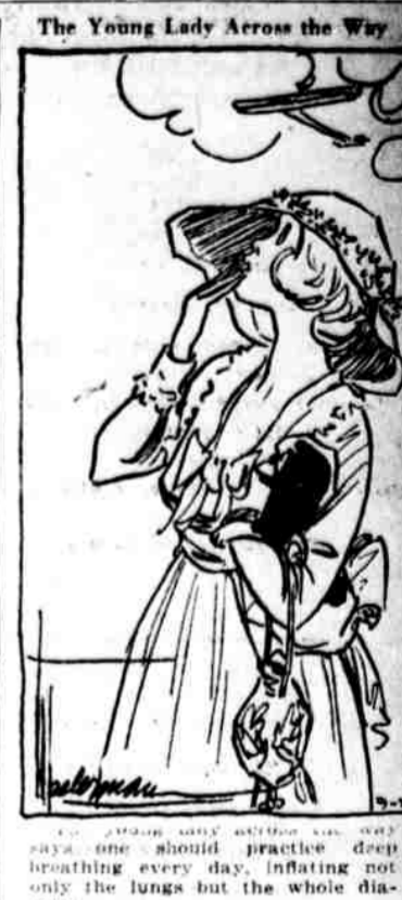
The Young Lady Across the Way