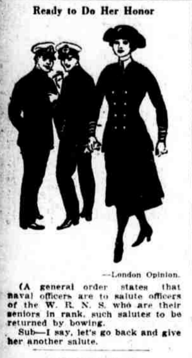
Ready to Do Her Honor

—London Opinion. (A general order states that naval officers are to salute officers of the W. R. N. S. who are their seniors in rank, such salutes to be returned by bowing. Sub—I say, let's go back and give her another salute.