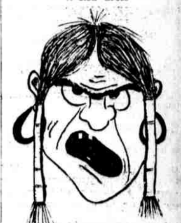
Pennsylvania Punch Bowl