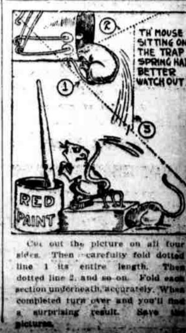
Cut out the picture on all four sides. Then carefully fold dotted line 1 its entire length. Then dotted line 2, and so on. Fold each section underneath, accurately. When completed turn over and you'll find a surprising result. Save the picture.