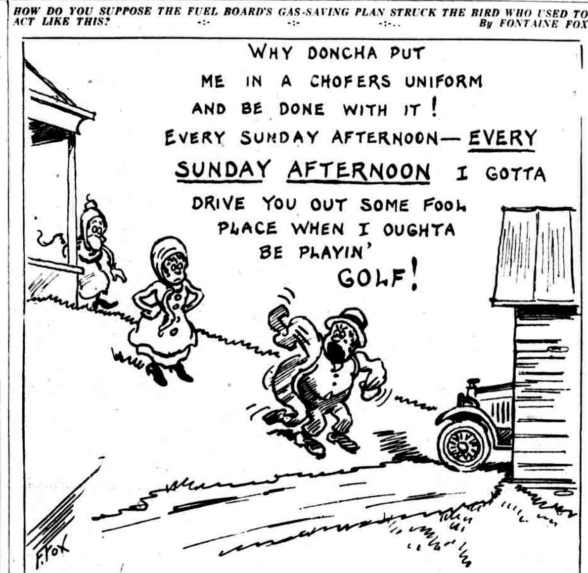
HOW DO YOU SUPPOSE THE FUEL BOARD'S GAS-SAVING PLAN STRUCK THE BIRD WHO USED TO ACT LIKE THIS? By FONTAINE FOX

—The Father. Smallone—I'm working in the stores. I suppose I'm too small for the front. Tommy—Yes, you wouldn't be any use there. Smallone—I meant the front of the shop.