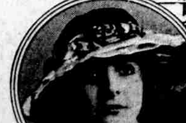
ENID BENNETT in "Coils of Fire" - Locust