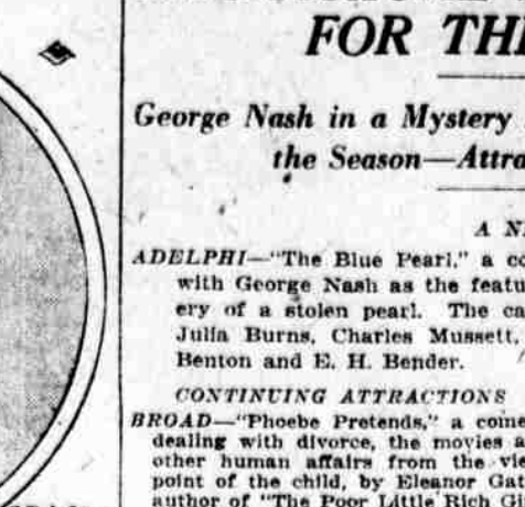
GRACE CARYLE in "The Blue Pearl" - Adelphi