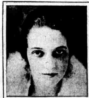
MIRIAM COOPER in "The Prussian Cur" - Locust