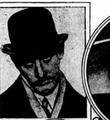
JOHN BARRYMORE in "On a Quiet Arcadia" - Lyric