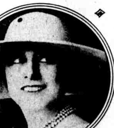
GEDALDINE FARRAR in "The Turn of the Wheel" - Stenley