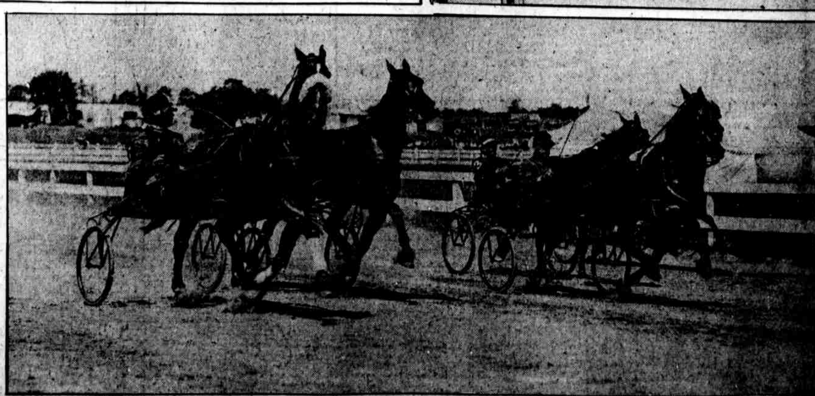
A COUNTY FAIR without its horse race would be like Labor Day without its customary parade of the sons of toil, and, needless to say, Byberry has not departed from precedent.