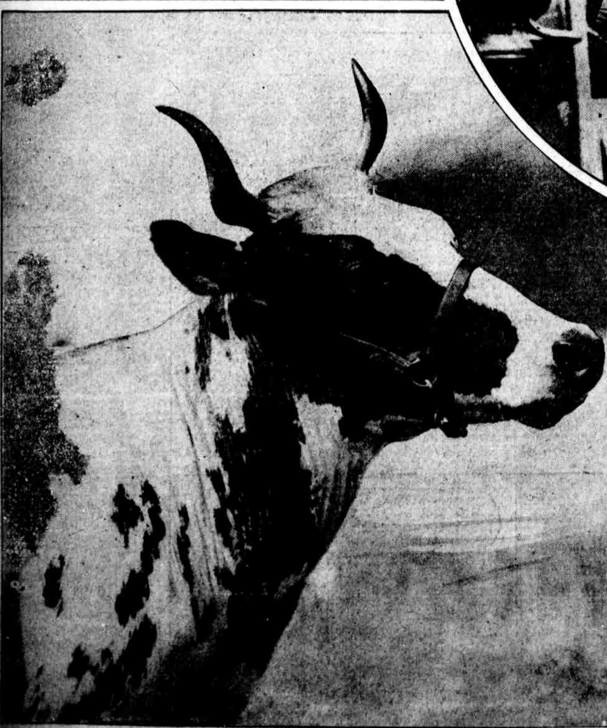
A NAME JUSTLY DESCRIPTIVE is that applied to "Flash Girl," a stunning exhibit in the cattle exhibit at Byberry.