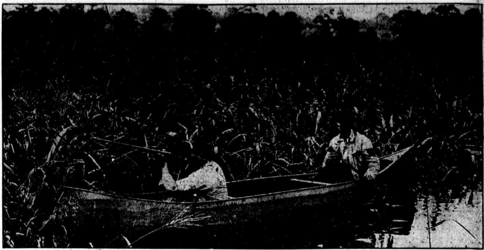
CASUALTIES AMONG the birds were high yesterday, if the numbers of the hunters in the marshes and their tales of well-filled bags are any criterion.