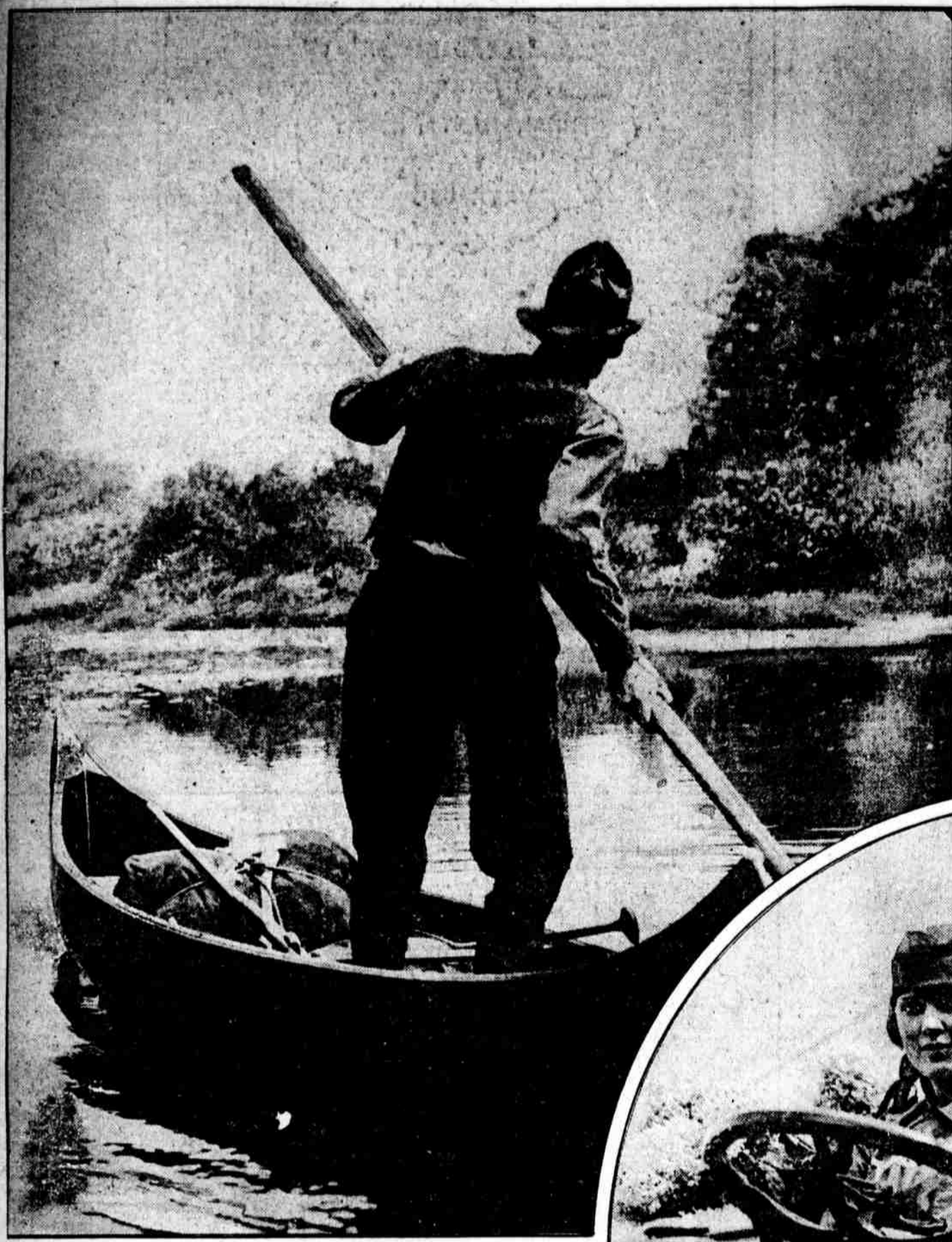
WHEN SEPTEMBER COMES and the longing of the outdoor lover becomes overpowering, away he goes a-camping in his canoe and under the turquoise skies.