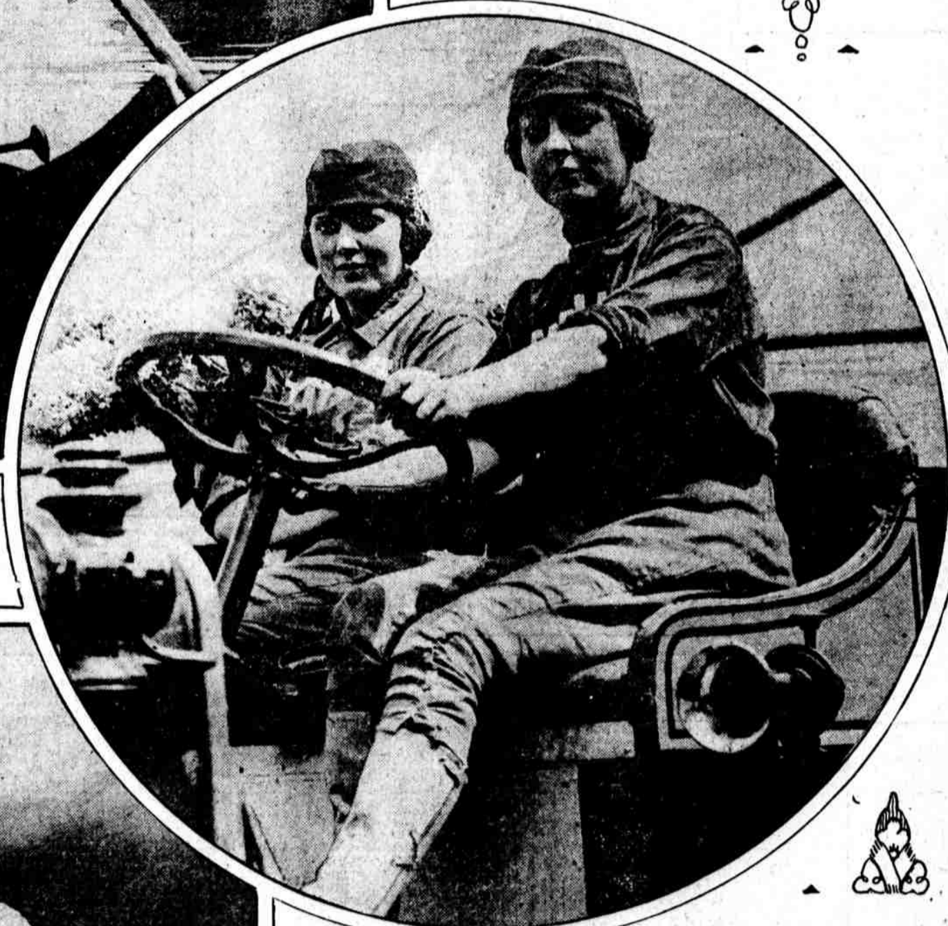
THE WAR NOTE pervaded the time-honored Philadelphia County Fair at Byberry on the opening day, so that the sight of girl chauffeurs demonstrating autotrucks caused little stir.