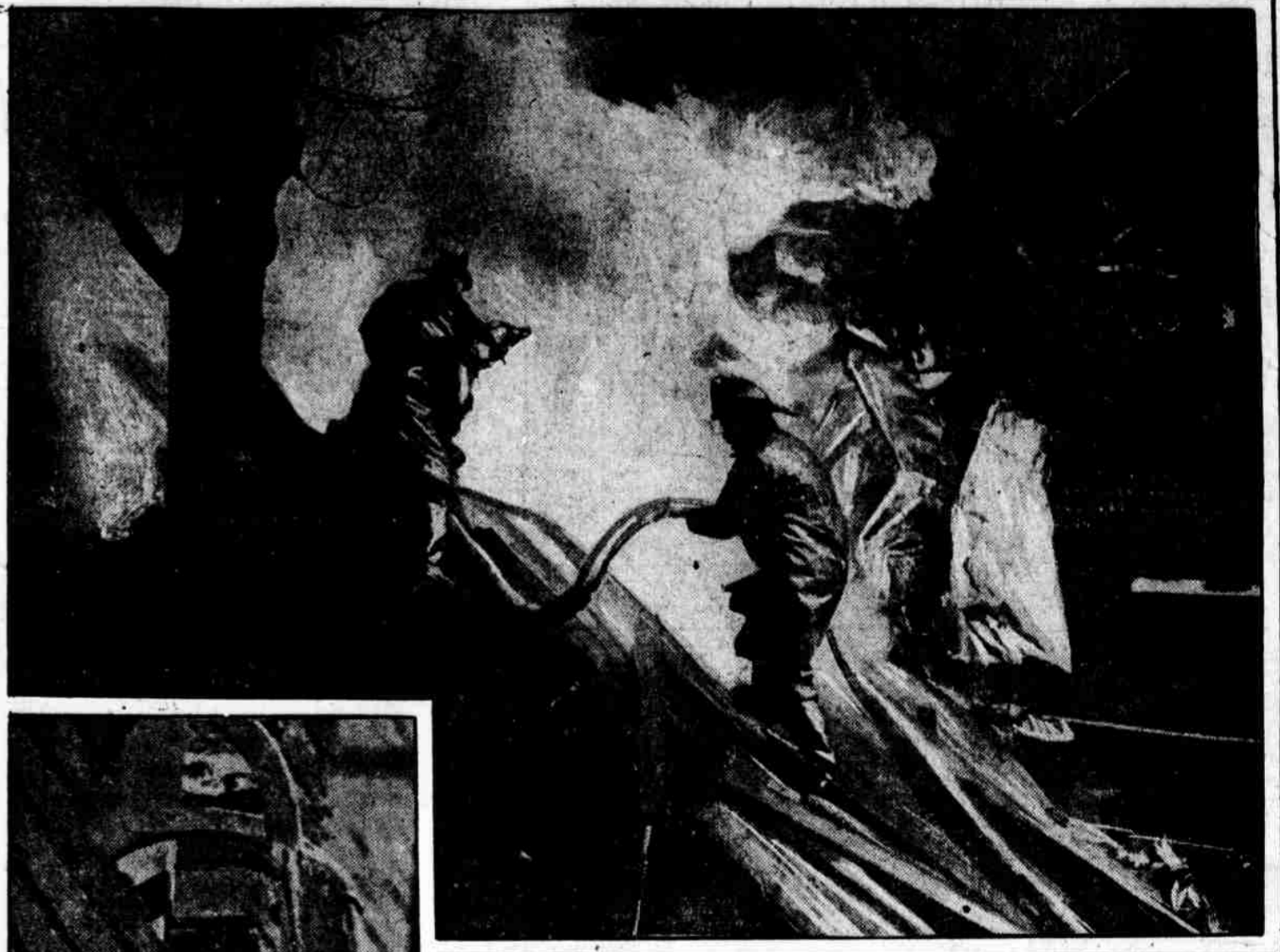
LIKE THE LADS IN THE TRENCHES, the firemen are wont to "see things through," no matter where they are called or when. Fire and smoke, heat, wet or cold fail to deter them.