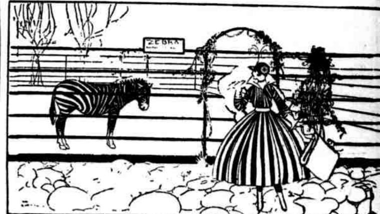
"Mercy, what a silly looking thing." —Cartoons Magazine.