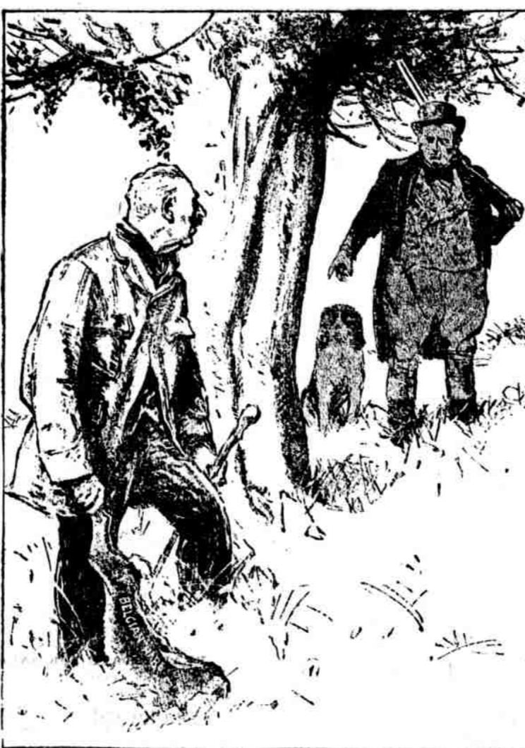
(Count Hertling has announced that Germany does not propose to keep Belgium, but only to use it as a pawn in peace negotiations.) Gamekeeper Bull—What are you doing with that hare? Wilhelm the Poacher—Nothing. I only shot it to offer you as a bribe in case you caught me.