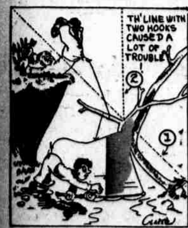
Out out the picture on all four sides. Then carefully fold dotted line 1 its entire length, then dotted line 2, and so on. Fold each section underneath, accurately. When completed turn over and you'll find a surprising result. Save the picture.