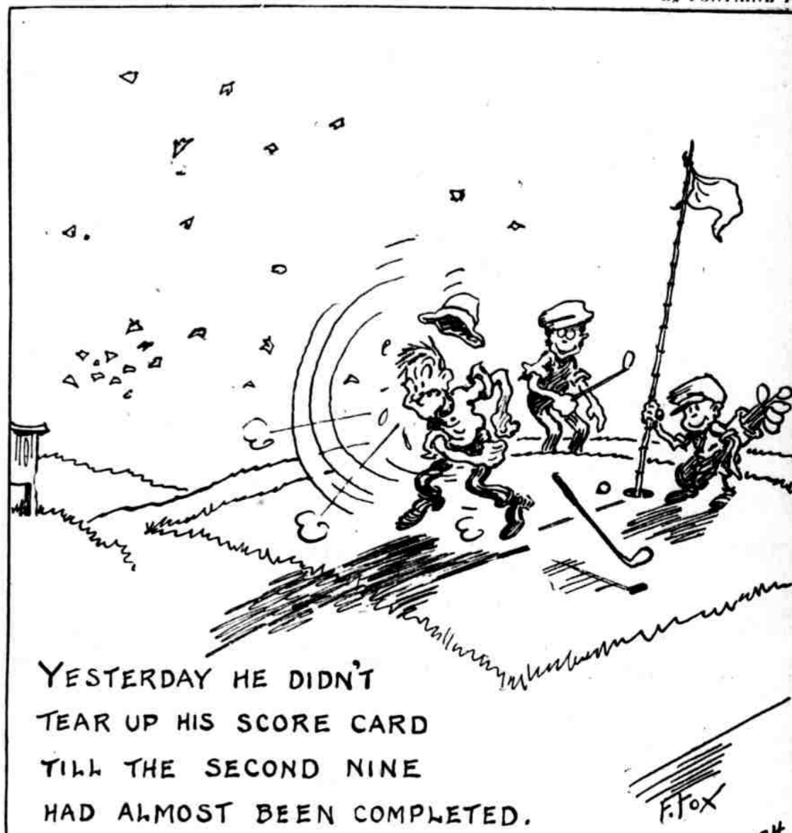
YESTERDAY HE DIDN'T TEAR UP HIS SCORE CARD TILL THE SECOND NINE HAD ALMOST BEEN COMPLETED.