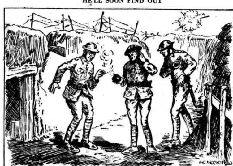
Absent-minded Bomber—Now let me see—what was it I intended to do?