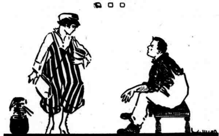
Plumber (to girl who has taken up plumbing to release a man for the front)—Well, what cha forgotten? Girl (proudly)—Not one thing. Plumber—You ain't? Well, by cricket, I ain't surprised. I told the boss a woman couldn't never make good at this business.