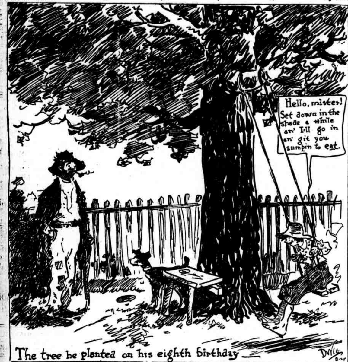
The tree he planted on his eighth birthday