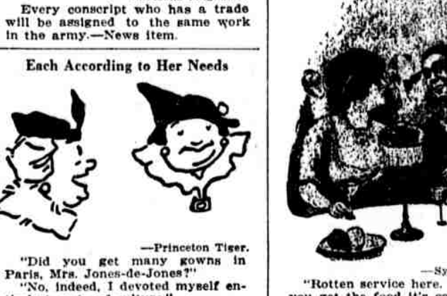
"Rotten service here. By the time you get the food it's cold." "Yes, but the charges are always hot."

tirely to art and culture." "Ah, we both got what we needed most."