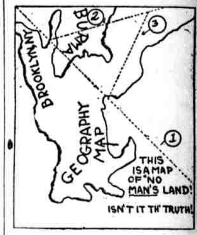
Cut out the picture on all four sides. Then carefully fold dotted line 1 its entire length. Then dotted line 2, and so on. Fold each section underneath, accurately, When completed turn over and you'll find a surprising result. Save the