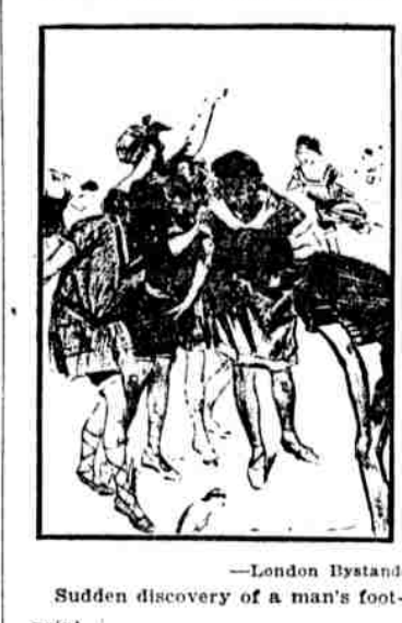
Sudden discovery of a man's footprint.

-Dartmouth Jack o' Lantern. "Why do they call her the college "Because all the guys she goes around with are dead ones."