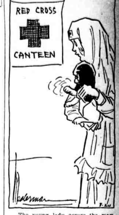
The young lady across the way says there are many ways in which the women can help, and for her part she's going to buy her crochet hooks three or four at a time after this, so as to make it worth while for the store to deliver them,