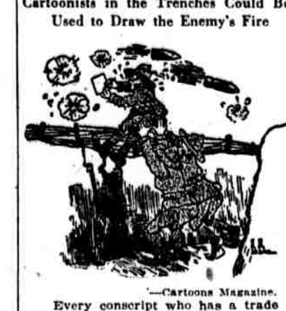
Every conscript who has a trade will be assigned to the same work in the army.-News item.

tirely to art and culture." "Ah, we both got what we needed most."