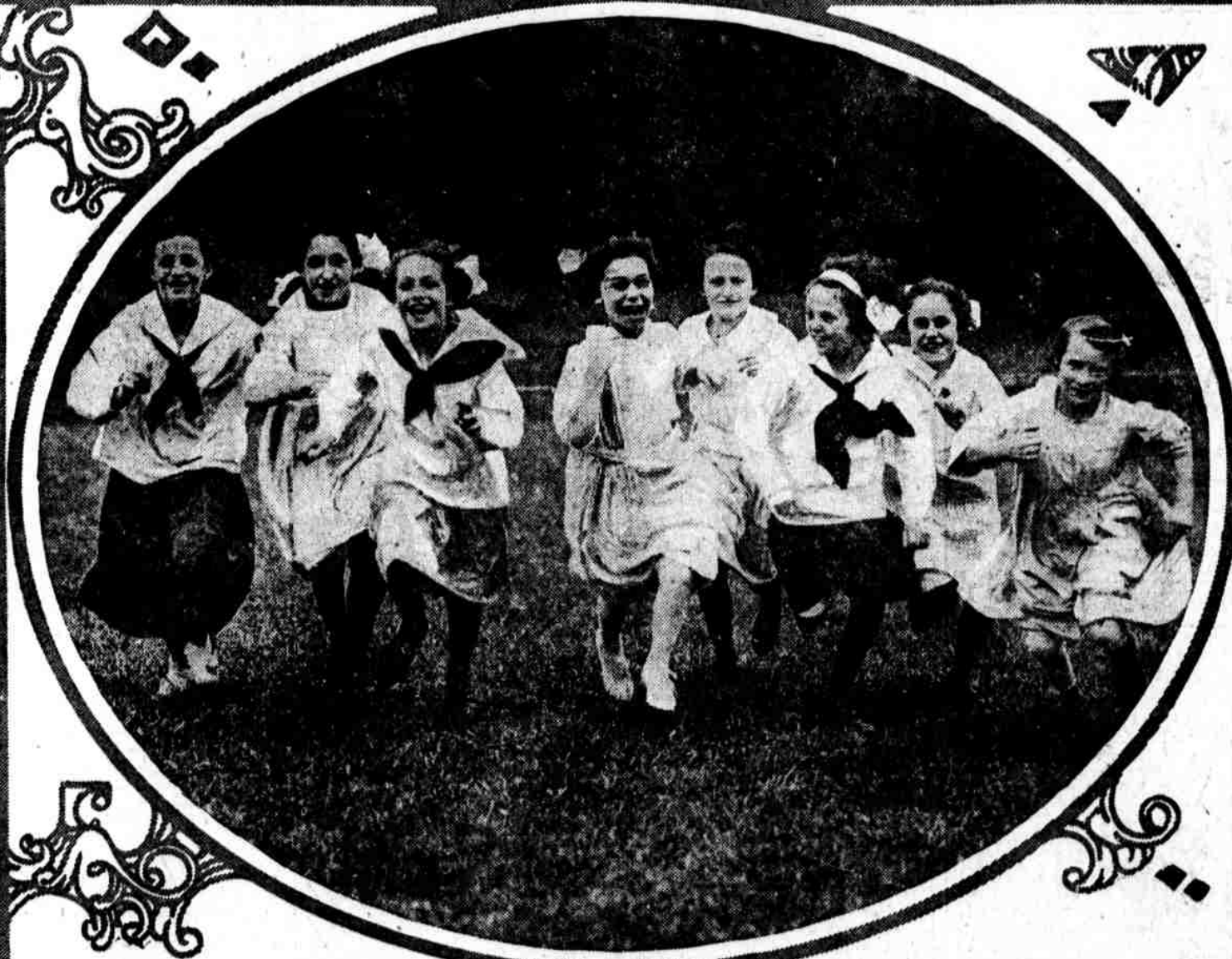
THERE IS NO YEARNING FOR FAR-OFF FIELDS AND PLAYGROUNDS WHEN MISS PHILADELPHIA, JR., finds opportunities for open-air sport such as this within walking distance of home.