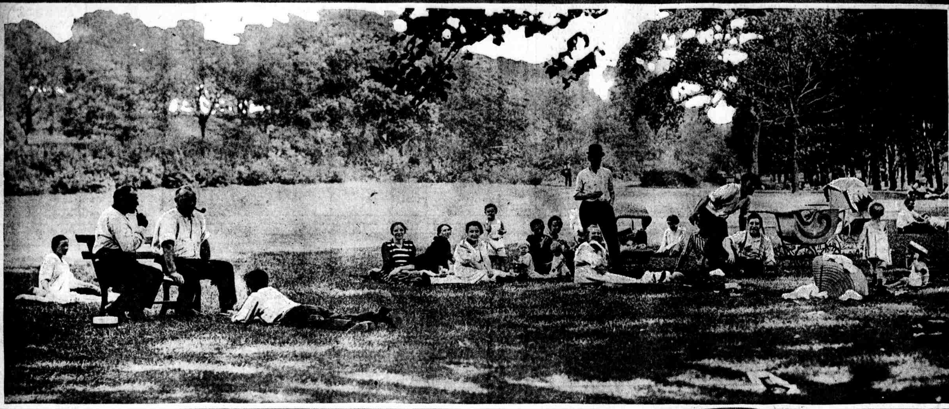
FATHER, MOTHER AND THE KIDDIES, NOT OMITTING THE NEIGHBORS, "SPEND A DAY IN THE COUNTRY" WITH REAL HOME COOKING amid the many delightful picnic grounds of Fairmount Park.