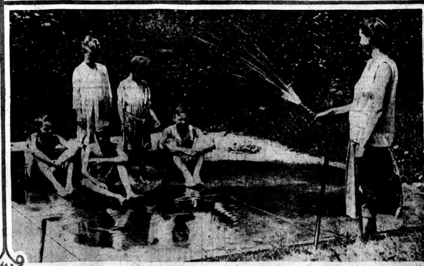
WHERE ALONG THE ENTIRE JERSEY COAST MAY A BATH LIKE THIS BE HAD? And here in its own backyard the whole stay-at-home family joyously indulges in a "shower."