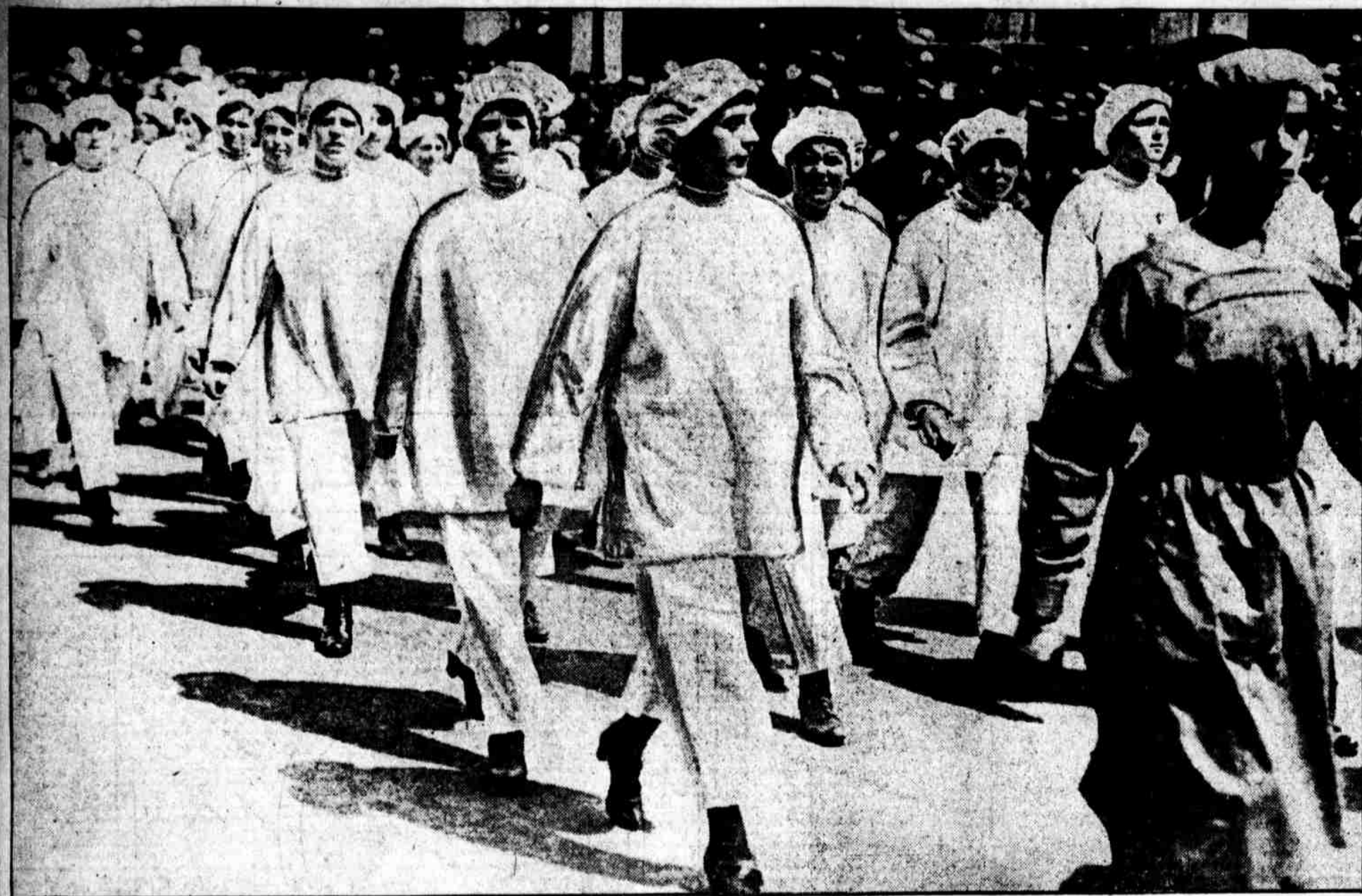
SHE "MAKES THE BULLETS, BUT HE FIRES THEM OFF" might apply to these British munition workers, shown as they turned out in the Canadian Recruiting Mission drive.

EA H WOMAN IN HER TURN "PLAYS MANY PARTS" IN TODAY'S RAPID, CHANGING WORLD