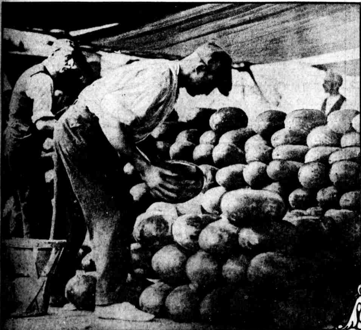
PLUG 'EM YOURSELF, to see that they're ripe, but you'll never find the secret why the cost of watermelons remains high.