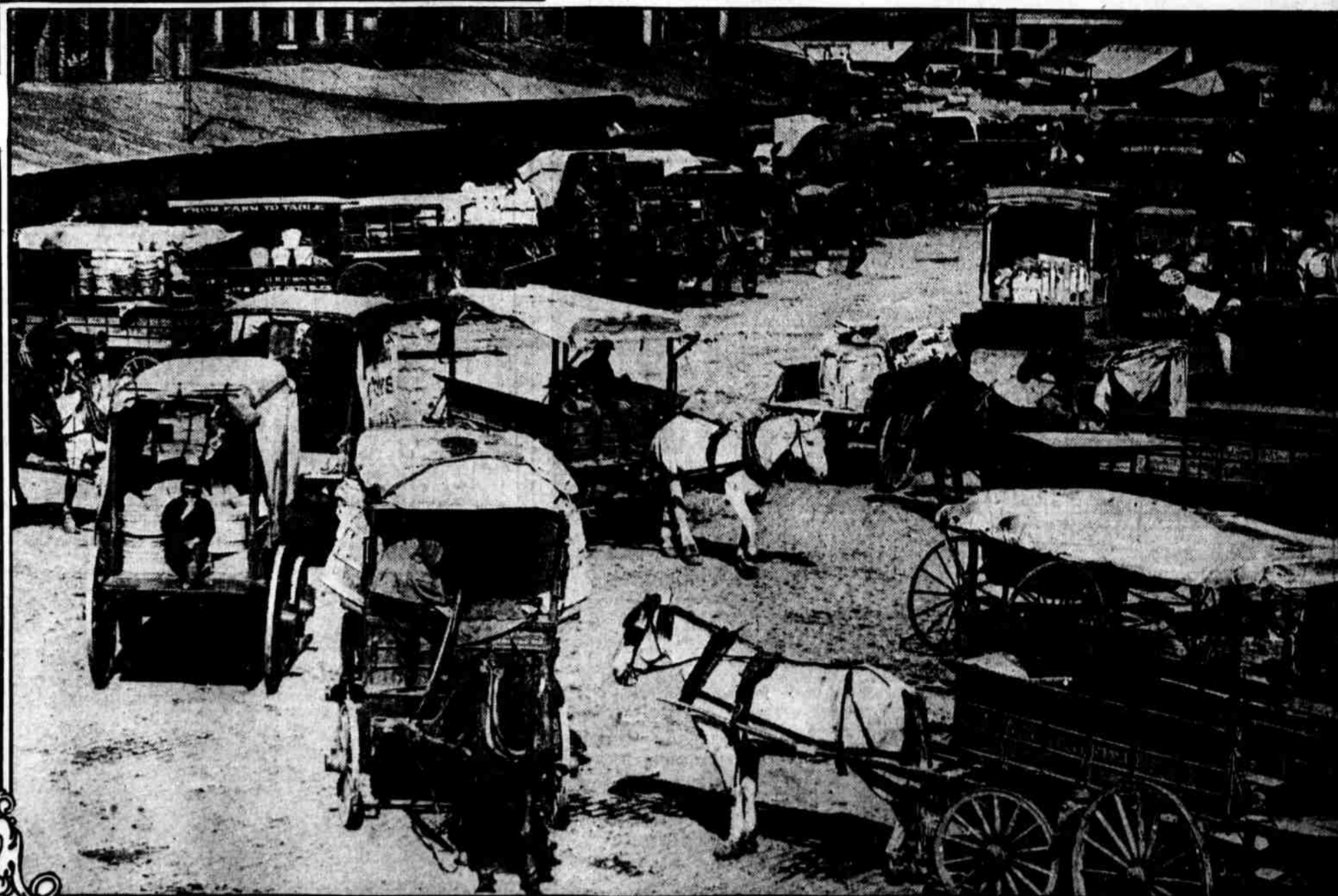
FEEDING PHILADELPHIA IS A GIGANTIC TASK, as anybody who watches the teeming traffic at the Dock Street Market any morning will quickly realize.