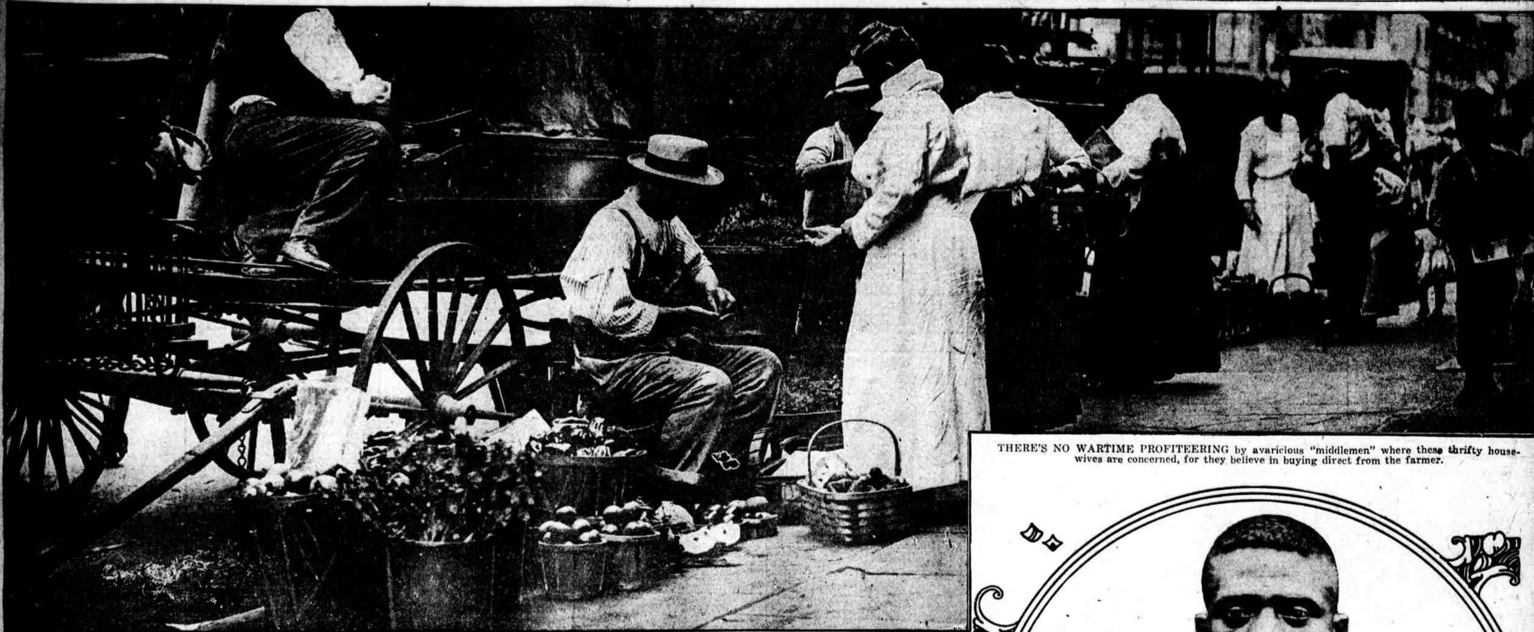
THERE'S NO WARTIME PROFITEERING by avaricious "middlemen" where these thrifty housewives are concerned, for they believe in buying direct from the farmer.

THE VEGETABLE ARMY BEING RUSHED TO THE PHILADELPHIA FRONT TO DEFEAT THE HIGH COST OF LIVING