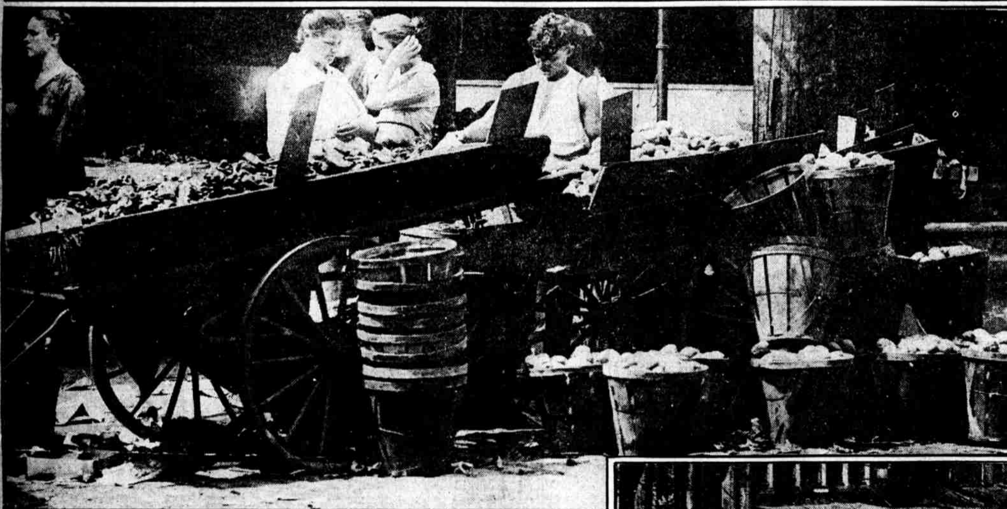
THE UBIQUITOUS PUSH CART is another means of bringing produce to the consumer, now that most horses are hauling guns and military supplies.