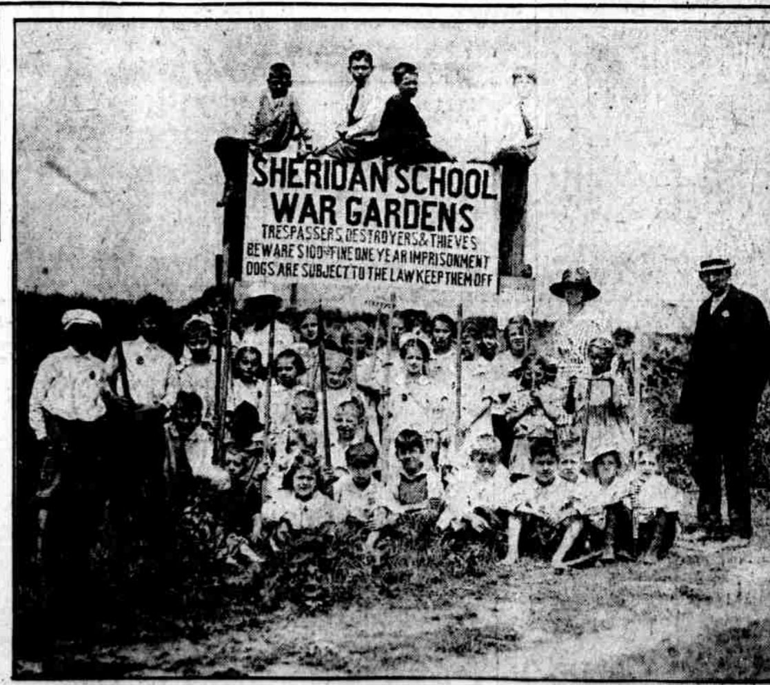
IT'S HARD TO BELIEVE THIS SPICK AND SPAN BATTALION OF SCHOOL AGRICULTURISTS can labor in the fields, yet keep so clean, but the EVENING PUBLIC LEDGER staff photographer snapped them "right on the job."