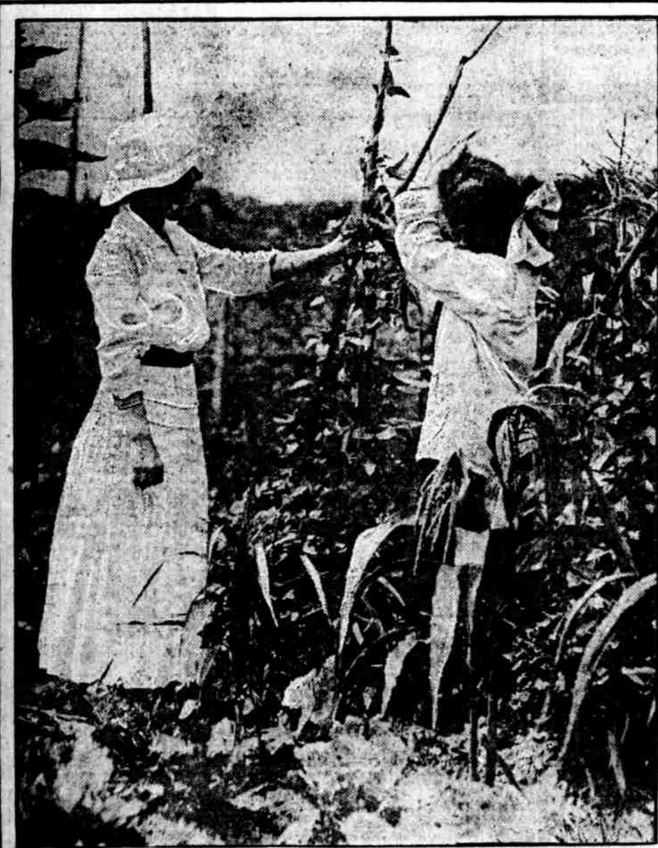
"JACK AND HIS BEANSTALK" MAY BE A FAIRY TALE AND PURE MYTH, but no scoffer dare "say beans" to these products of the vegetable growers from the Sheridan School.