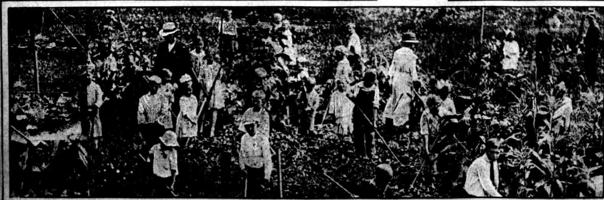
HIAWATHA, YOU REMEMBER, LABORED "TILL THE CORN WAS RIPE AND GROWING KNEEDEEP IN THE THRIFTY FURROW," but up at D and Tioga streets these Philadelphia public school raisers of the great American cereal keep everlastingly at their task until the stalks are more than head high in their war garden.