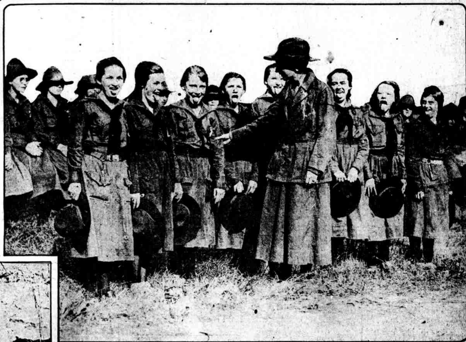
DO NOT MISTAKE THIS ACTION FOR ONE OF IMPUDENCE OR UNLADYLIKE CONDUCT. It's part of the daily health inspection at the Hilldale camp.