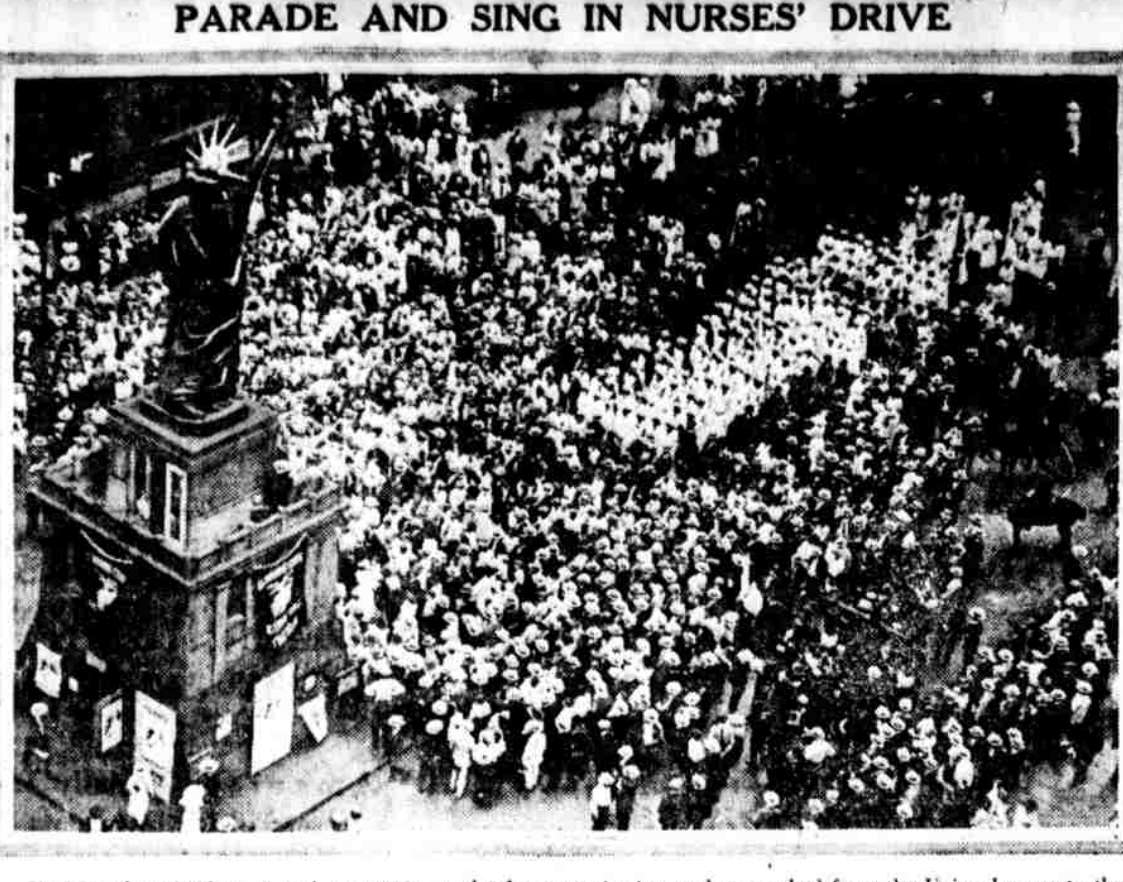
Uniformed women's war work association and other organizations today marched from the Union League to Liberty Statue in a "recruiting sing" for nurses. In the line were membhers of the of the National League for Women't Service, Emergency Aid aides, Red Cross Motor Messengers and Girl Scouts, together with nurses from thirteen hospital

GERMAN CAPTIVES Robinson Quits Post HEAT FATAL TO 13,