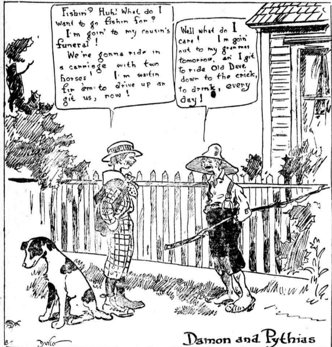
Damon and Pythias