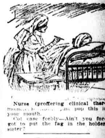
Nurse (proffering clinical thermometer)—You're a little feverish. "Ain't you forgot to put the fag in the holder, sister?"