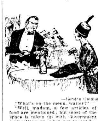
—London Opinion. "What's on the menu, waiter?" "Well, madam, a few articles of food are mentioned, but most of the space is taken up with 'Government instructions on what not to eat'."