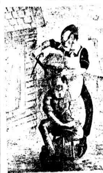
—Harvard Lawman. When a startling series of events suggest that One-Eyed-Louis has the patch over his good eye.

PETEY—Now He Wonders If They'll Leave Him Any Shirts