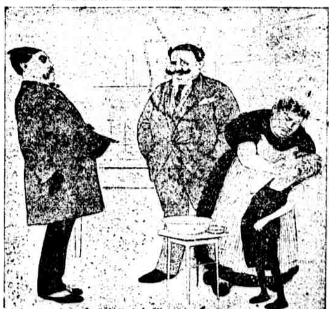
"What are you crying for, sonny?" "Because my father has discovered a new soap substitute, and every time a customer comes in I get washed as an advertisement."