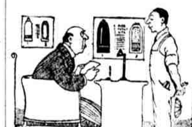
At the Munition Pl... "You're dead! I have an old hen at home that can make a better than you."

Fogg is rather disgusted with poultry farming. He says that when he left home yesterday morning forty of his hens were bragging about what they were going to do; but on his return he found that only eight had laid—the rest of the bunch had simply lied.—Boston Evening Transcript.