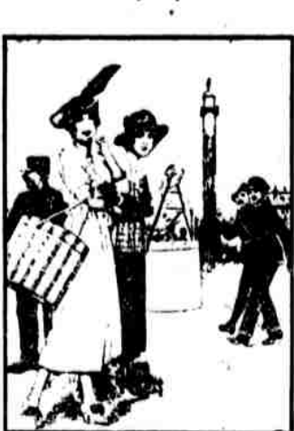
—London Bystander. The "Cherries" of the Rue de la Paix.