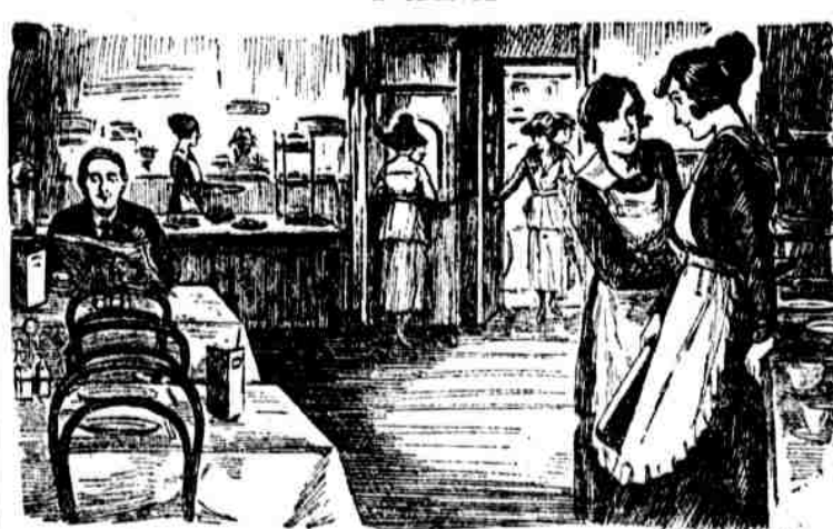
First Waitress—I see you can't be married. Second Waitress—How do you know? First Waitress—He always has his meat coupons.