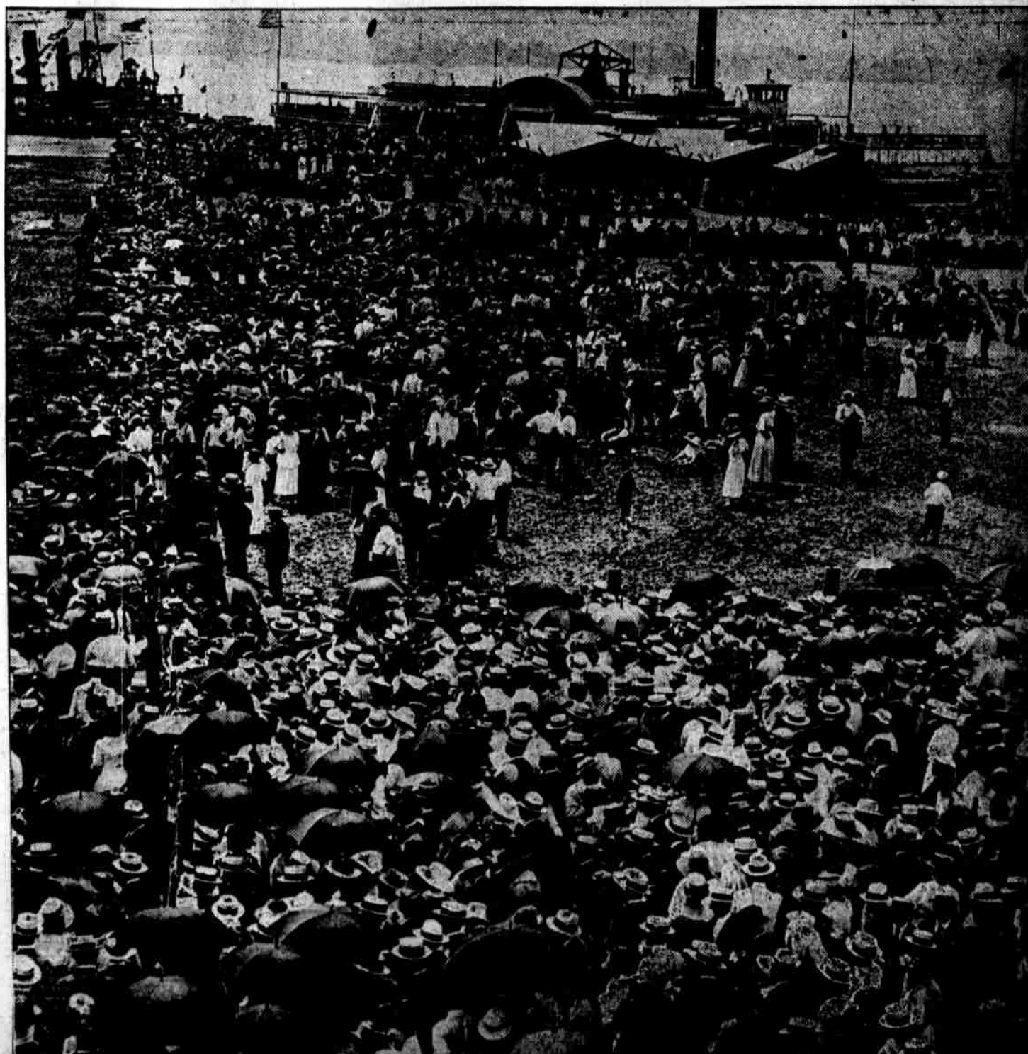
AN ENTHUSIASTIC CROWD OF 30,000 people attended the launching of the Quistconck, first ship completed at Hog Island.