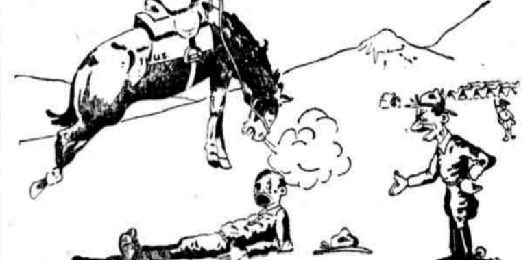
'Don't let him do that! Don't let him do that! You'll ruin his disposition.' — Princeton Tiger.