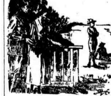
The Lady—How on earth does that man get his feet through those little puttees?