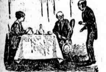
Patron—You're conserving food, I judge, by the size of your portions. Waiter—Yes, sir. Patron—Well, here's half the amount of the bill—I'm conserving my own resources.