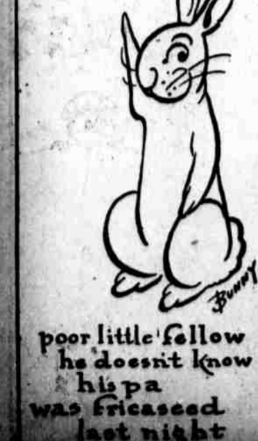
poor little fellow he doesnt know his pa was fricaseed last night