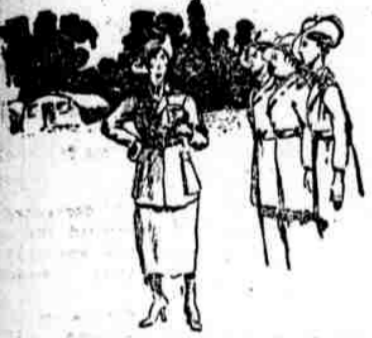
The W. A. A. C. Officer—Squad—'Shun! One of you girls tell me if my hat's on straight.'