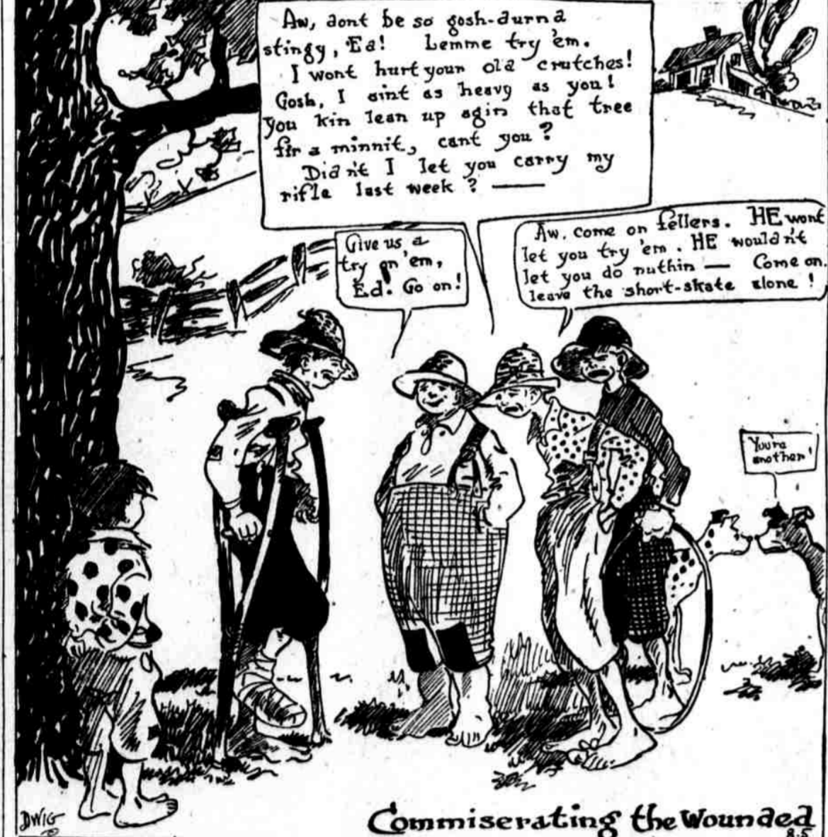
Commiserating the Wounded

OBTAINING A SATISFACTORY DECISION ON SHOTS CLOSE TO THE LINE IS SOMETIMES VERY DIFFICULT IN TENNIS WITHOUT AN UMPIRE By FONTAINE FOX