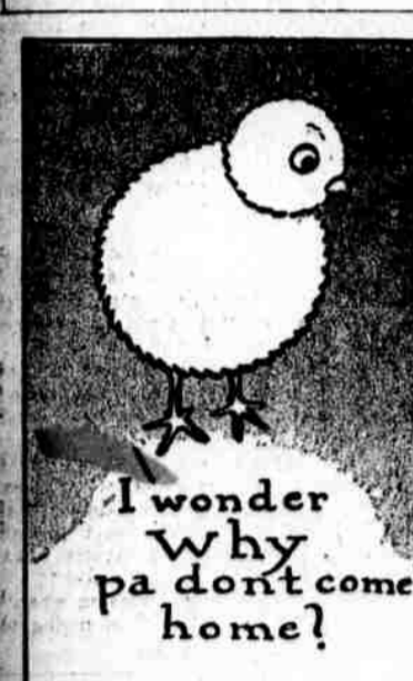
I wonder why pa dont come home?