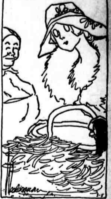
The young lady across the way says she doesn't see why so many unpleasant things are said about the eternal triangle, and personally she thinks it's a very pretty instrument and adds quite a little to a good symphony orchestra.