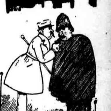
—The Passing Show. Would you mind escorting me a little way, constable? I've been seen by two fellows with this box of matches.