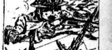
—Penn State Froth.