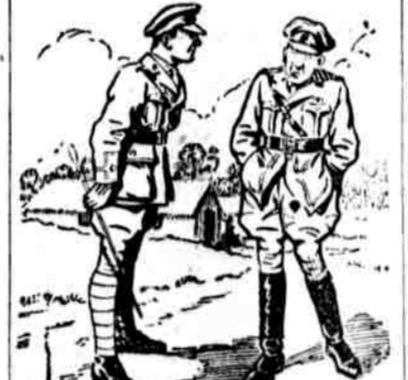
First Sub—What do you think of your new C. O.? Second Sub—H'm! I suppose he's all right in his way, but—er. First Sub—No, he wouldn't give me my week-end leave, either.