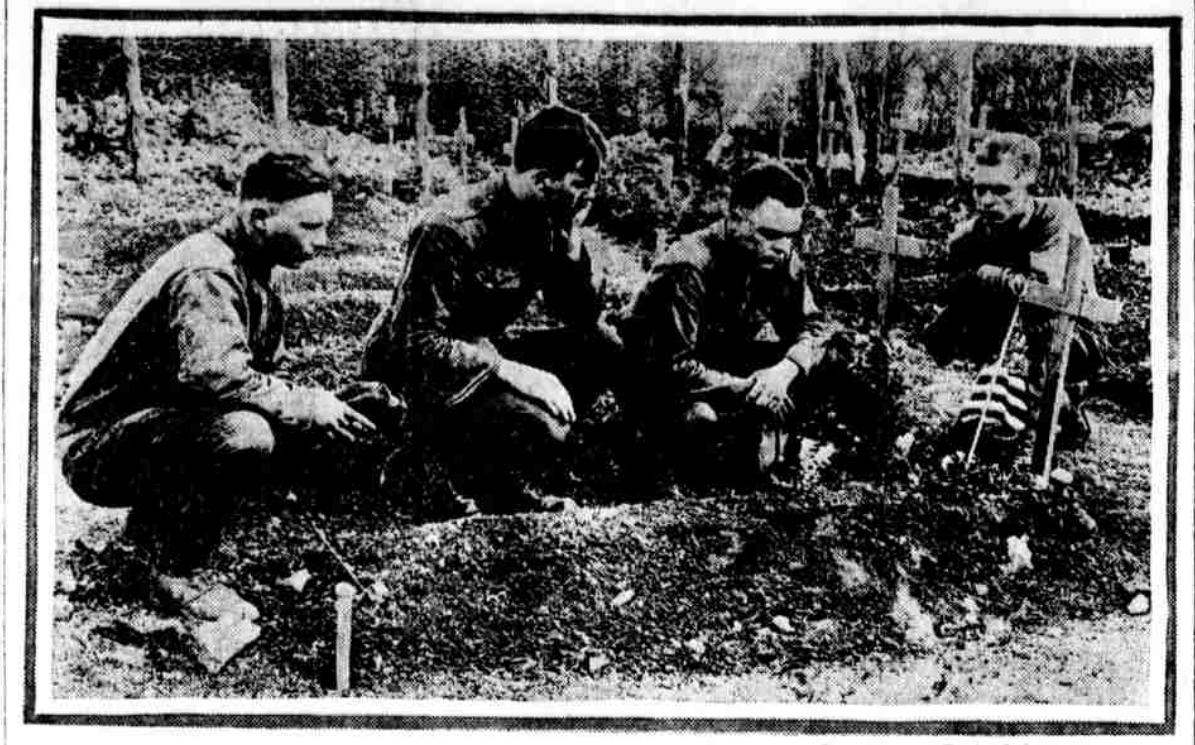
American soldiers at the grave of a doughboy who fell in pursuance of his duty