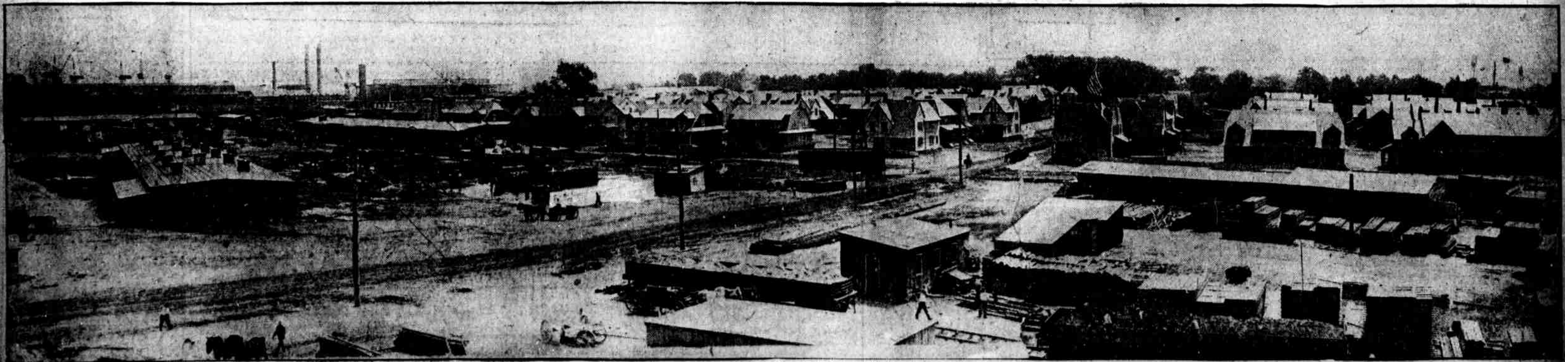
GENERAL VIEW of the shipworkers' village of Harriman, with the plant of the Merchants' Shipbuilding Corporation showing on the extreme left.