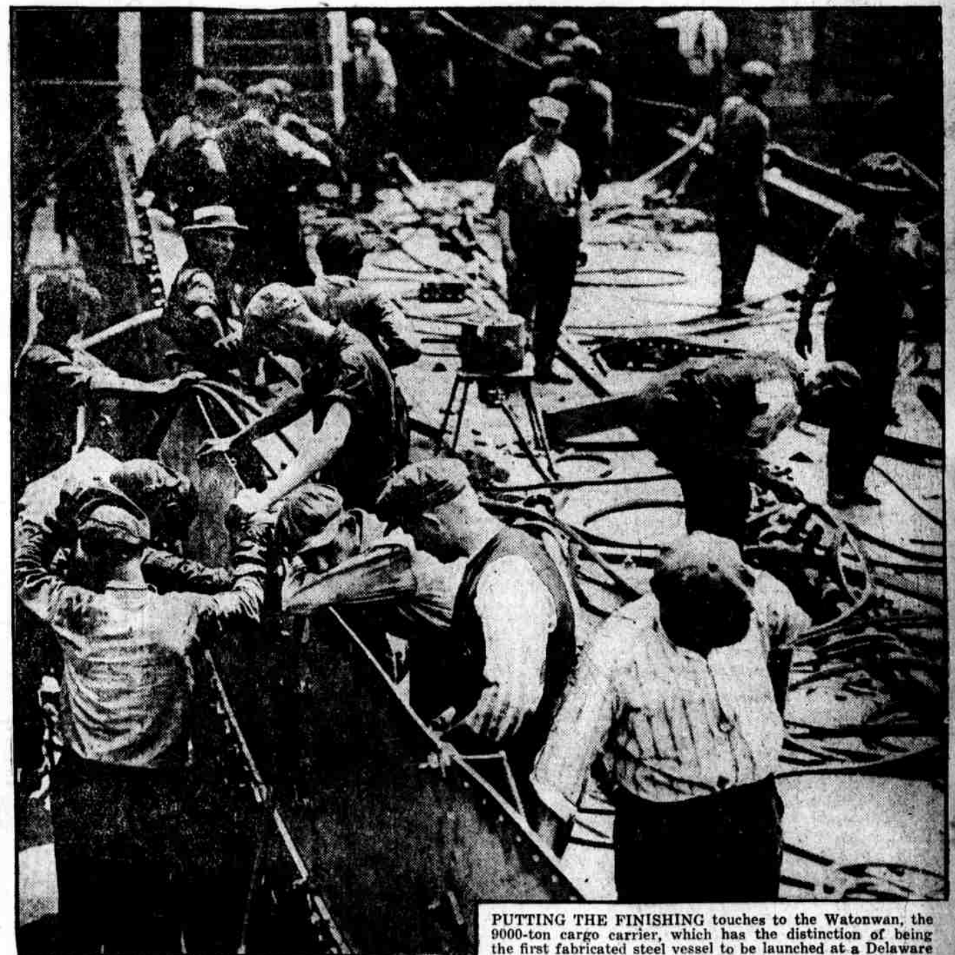
PUTTING THE FINISHING touches to the Watowan , the 9000-ton cargo carrier, which has the distinction of being the first fabricated steel vessel to be launched at a Delaware River shipyard.