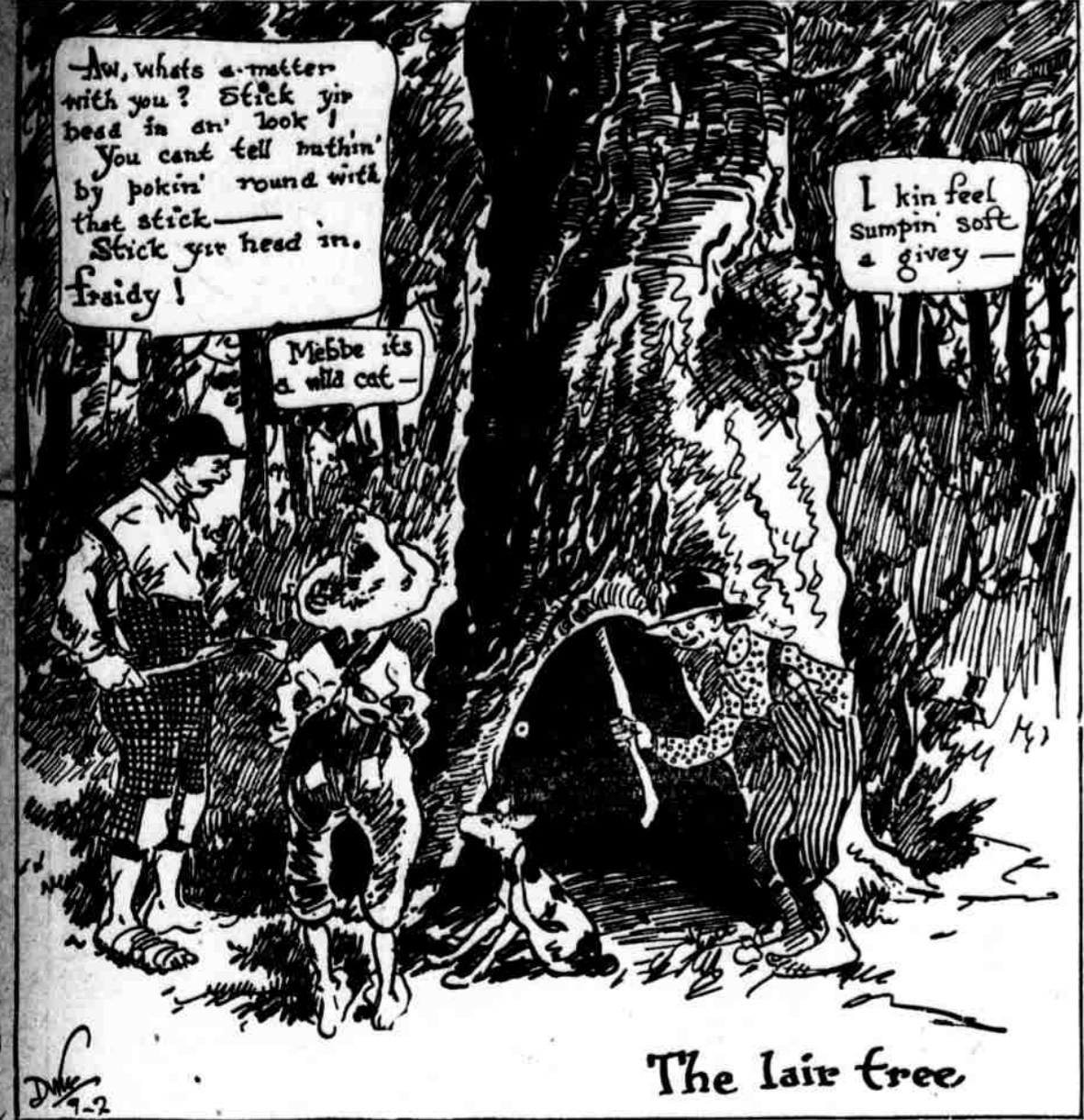
The lair tree