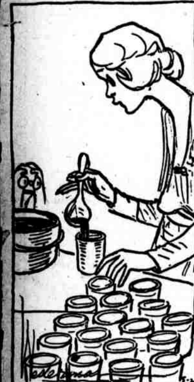
The young lady across the way says so many of the girls are getting married before the boys leave for France that it keeps her busy running downtown and picking out pieces of debris for wedding presents.