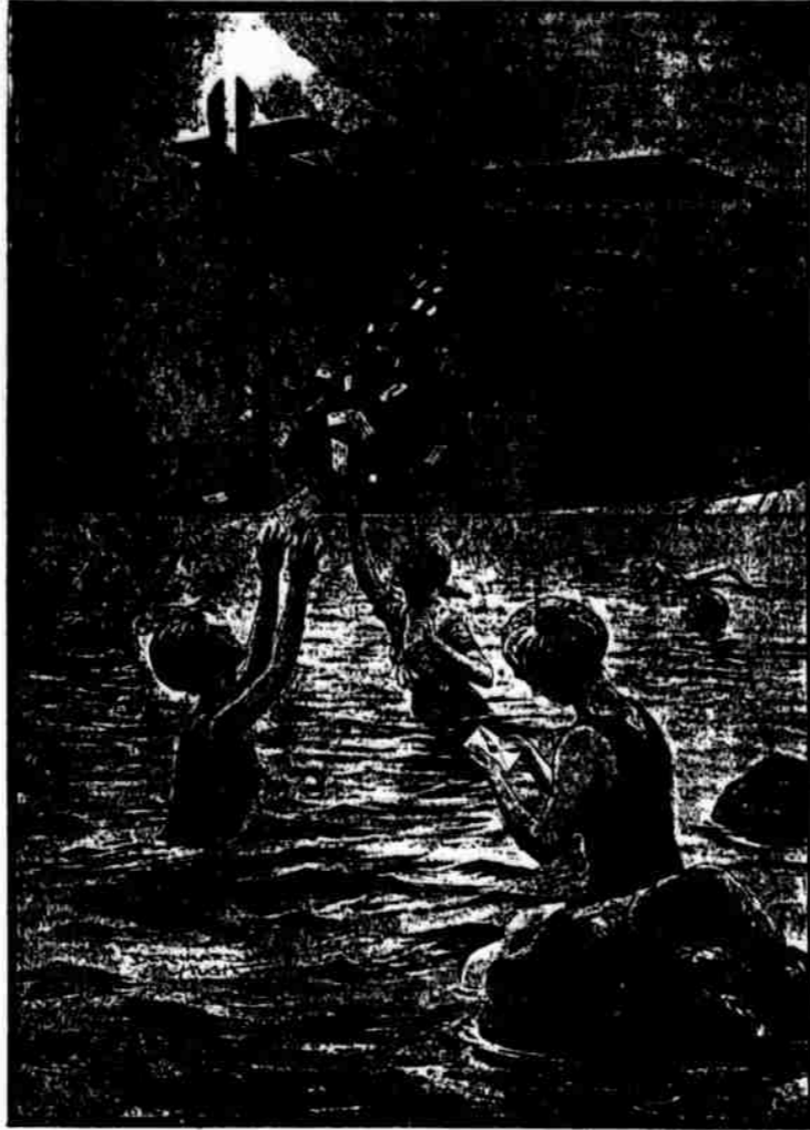
—Of a kind that always receives a rapturous welcome, even though it only preaches to the already converted.

Very Important—to Willie Teacher—Who can tell me a thing of importance that did not exist a hundred years ago? Little Willie—Me!—Answers.