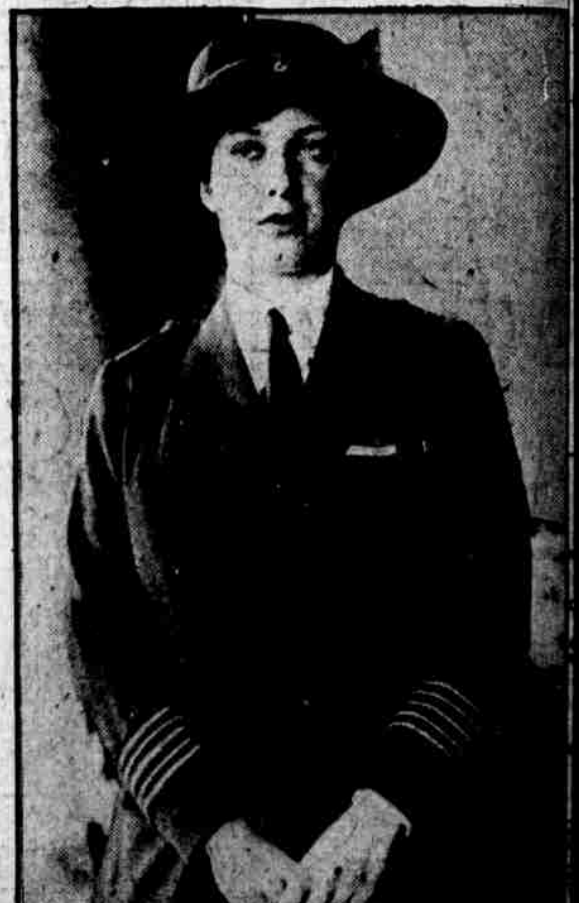
ROYALTY IS NOT EXCEPTED from the demands of war, and Her Royal Highness Princess Mary has assumed as a precaution in the... London