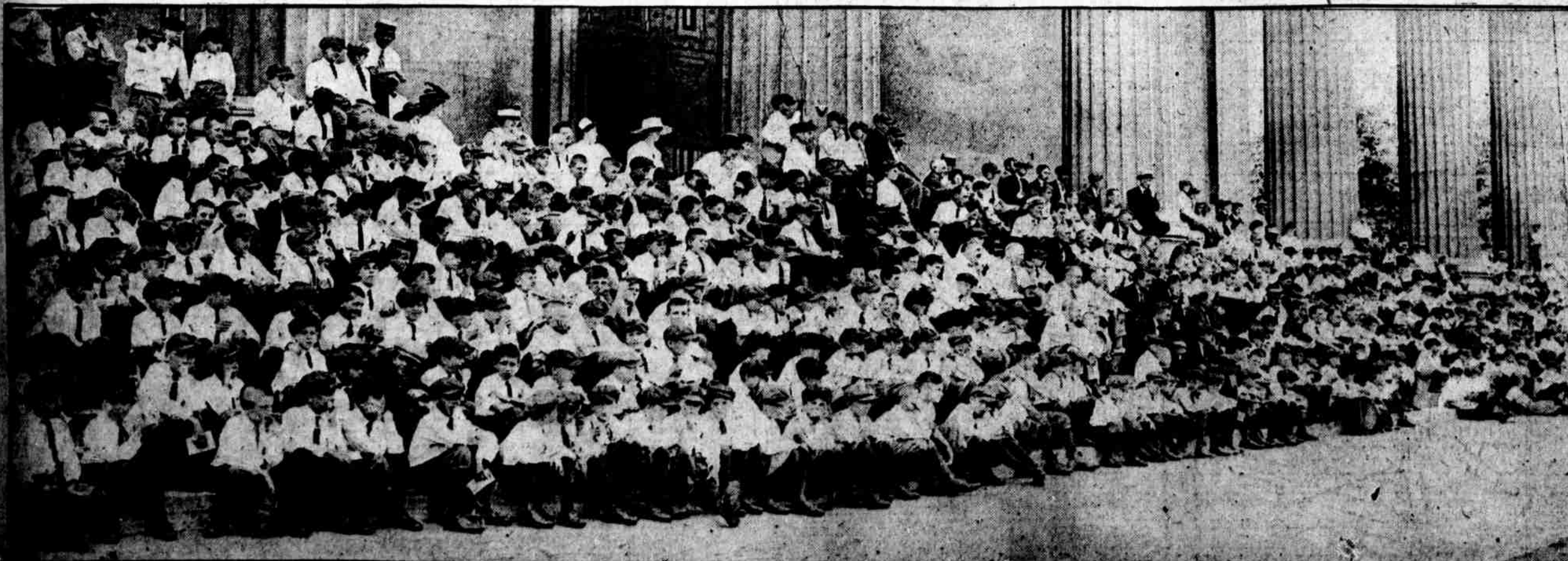
OUT AT GIRARD COLLEGE Fete Day is spelled with capital letters by the boys in the institution. Yesterday was no exception, for the athletic events arranged for the lads were even better than in former years, and that is a considerable claim.