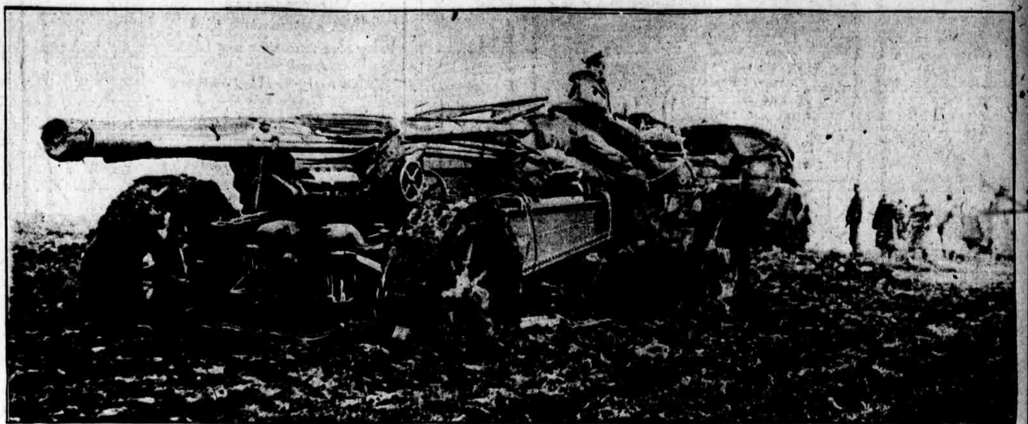
MUD HAS NO TERRORS for the great tractors which drag ponderous guns through every sort of quagmire as though they were the merest toys. Western Newspaper Union