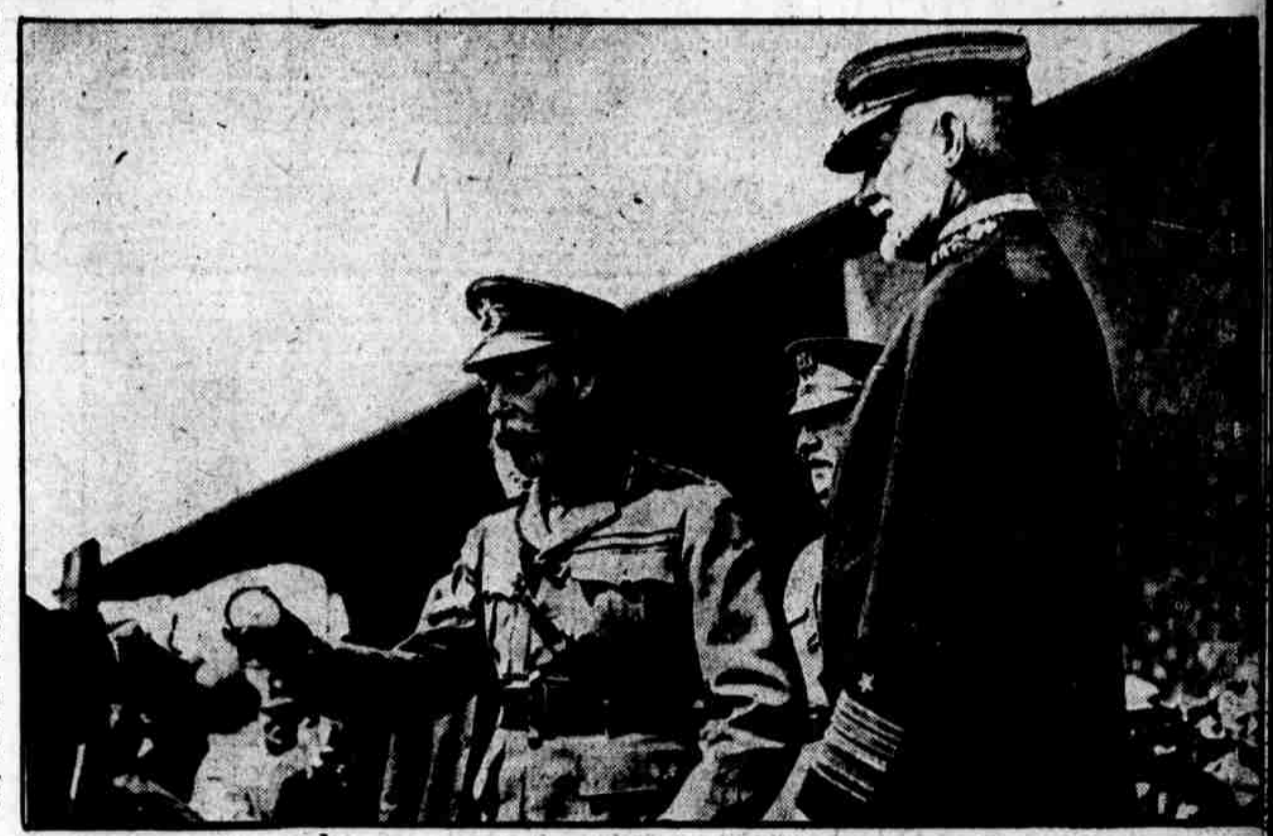
IT HAS NOT BEEN EXPLAINED why King George failed to throw out the ball at the Fourth of July game between the American service teams at Chelsea. Previous reports had told of His Majesty's practicing for the big event.